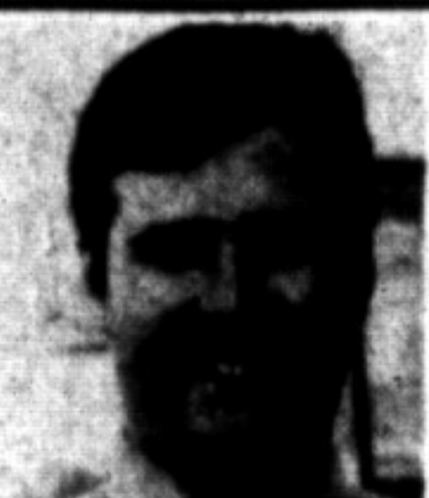
MILTON CHRYSLER DODGE