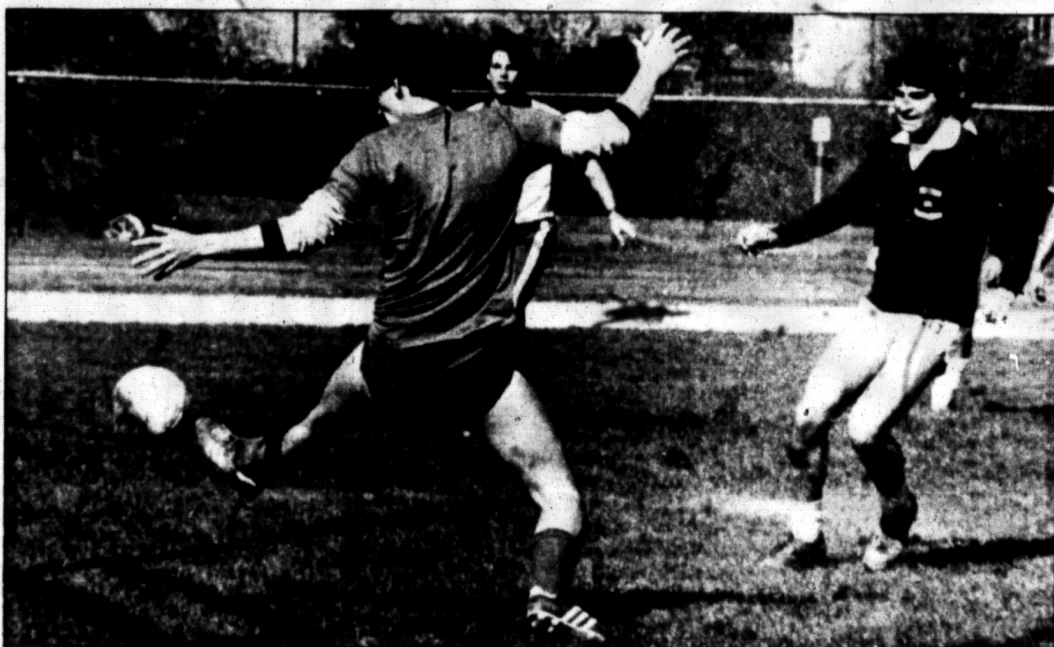
And there goes another one, unfortunately for Milton. Milton District High School's senior squad suffered a 7-1 setback at the hands of Perdue Panthers in Milton soccer action Friday at Milton District High School. Milton has only the slimmest chance of making playoffs, but could act as a spoiler. See story below.