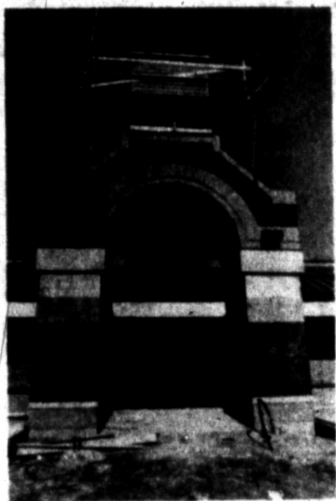
Carriage Square is rising quickly. The plaza on the northeast corner of Main and Martin streets has benefitted from the recent good weather.

He said Carriage Square intends to co-ordinate advertising with the DBIA.