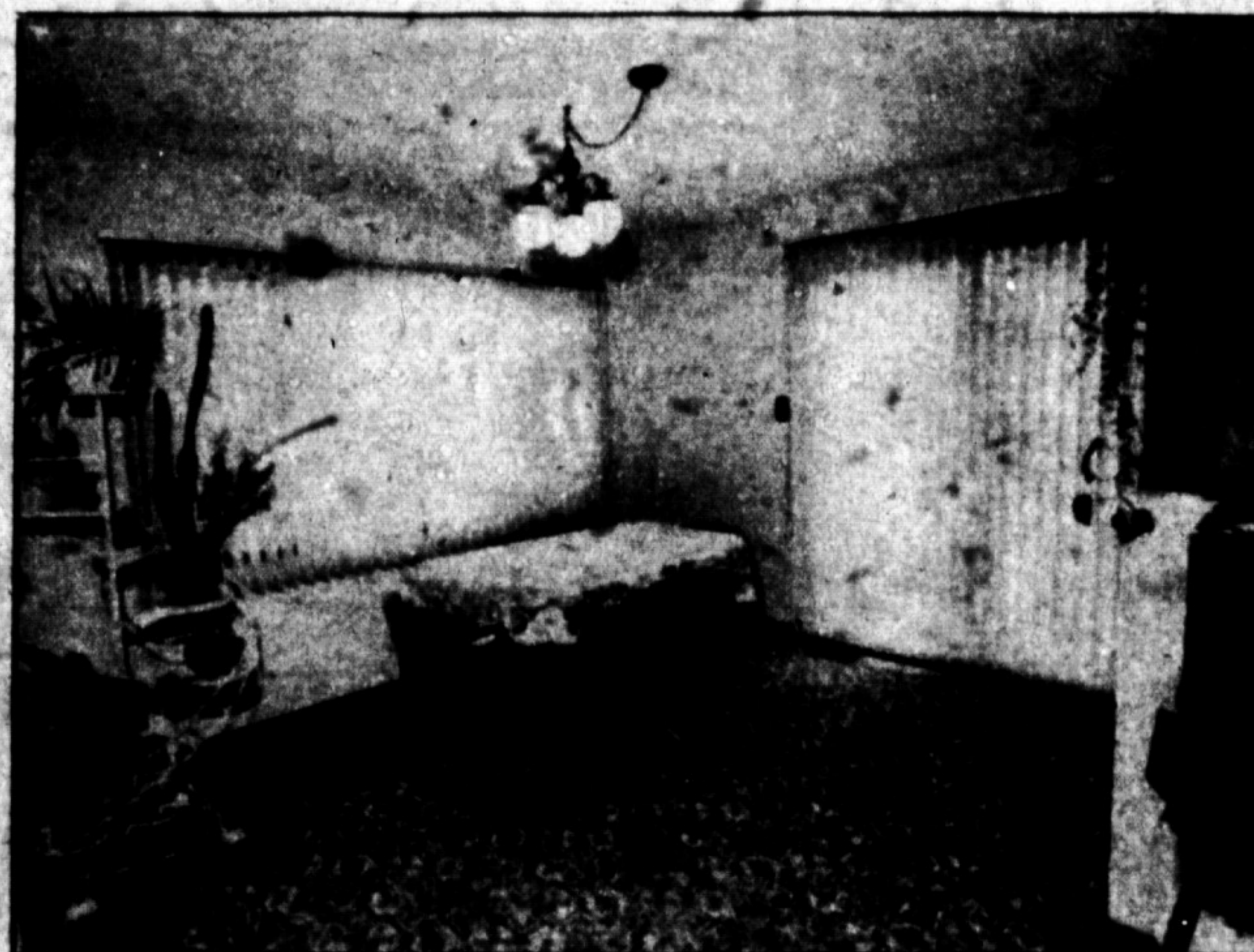
The living room/dining room combination has lots of light.