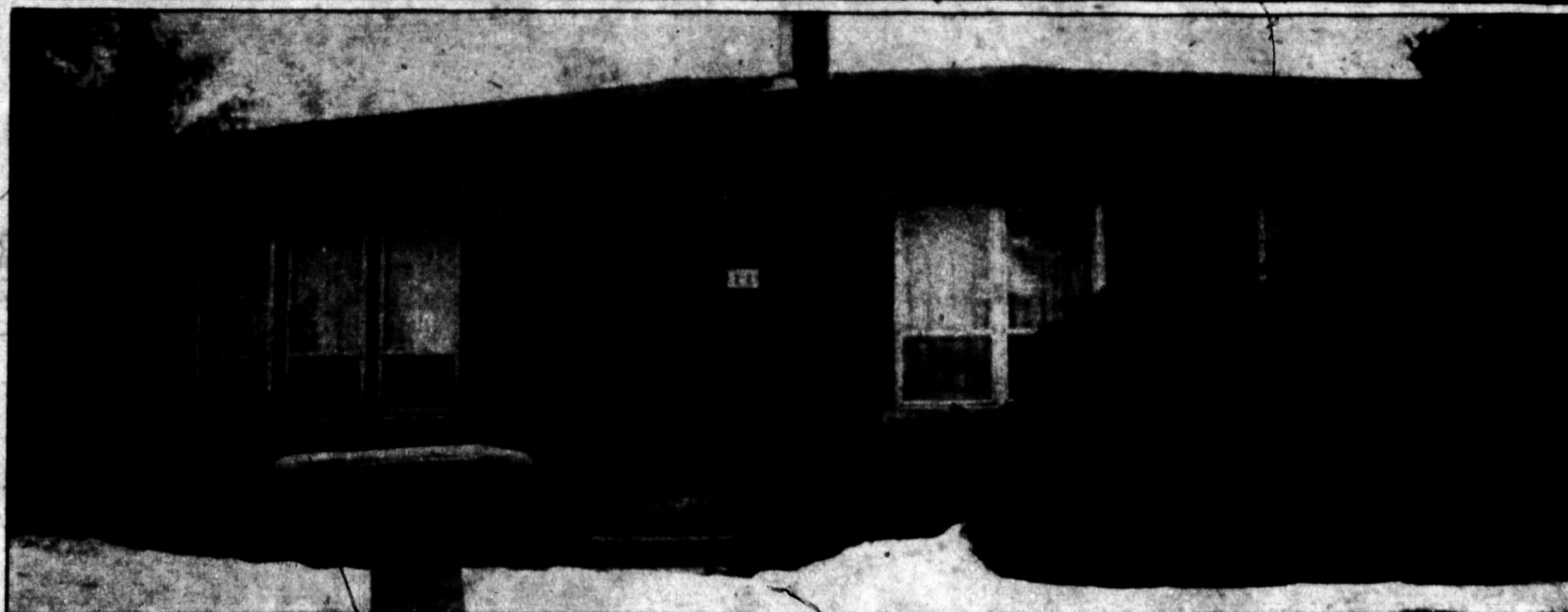
Here's a home that really is a breeze. This all-brick bungalow comes complete with air conditioning.