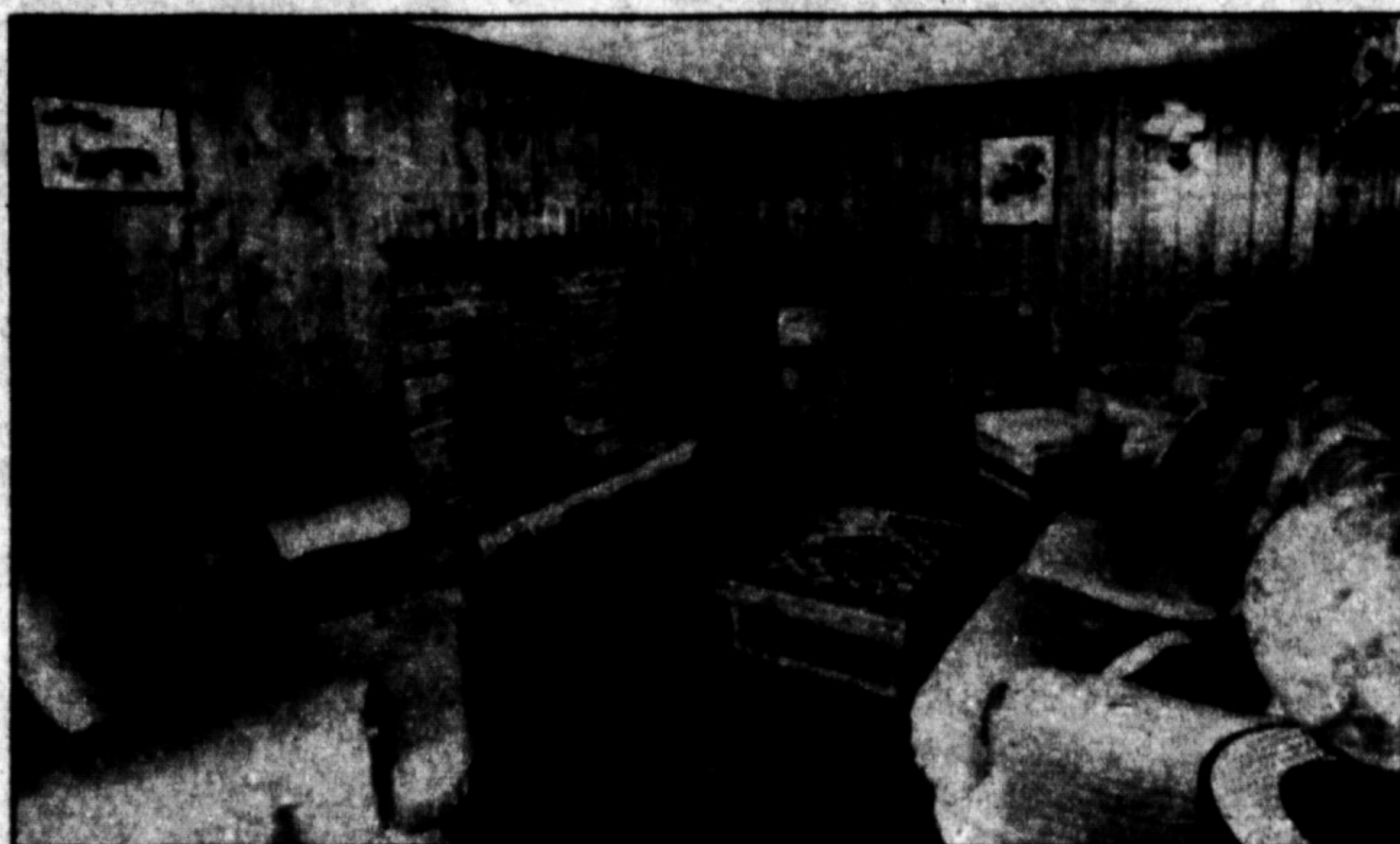
The family room is richly panelled with a fireplace.