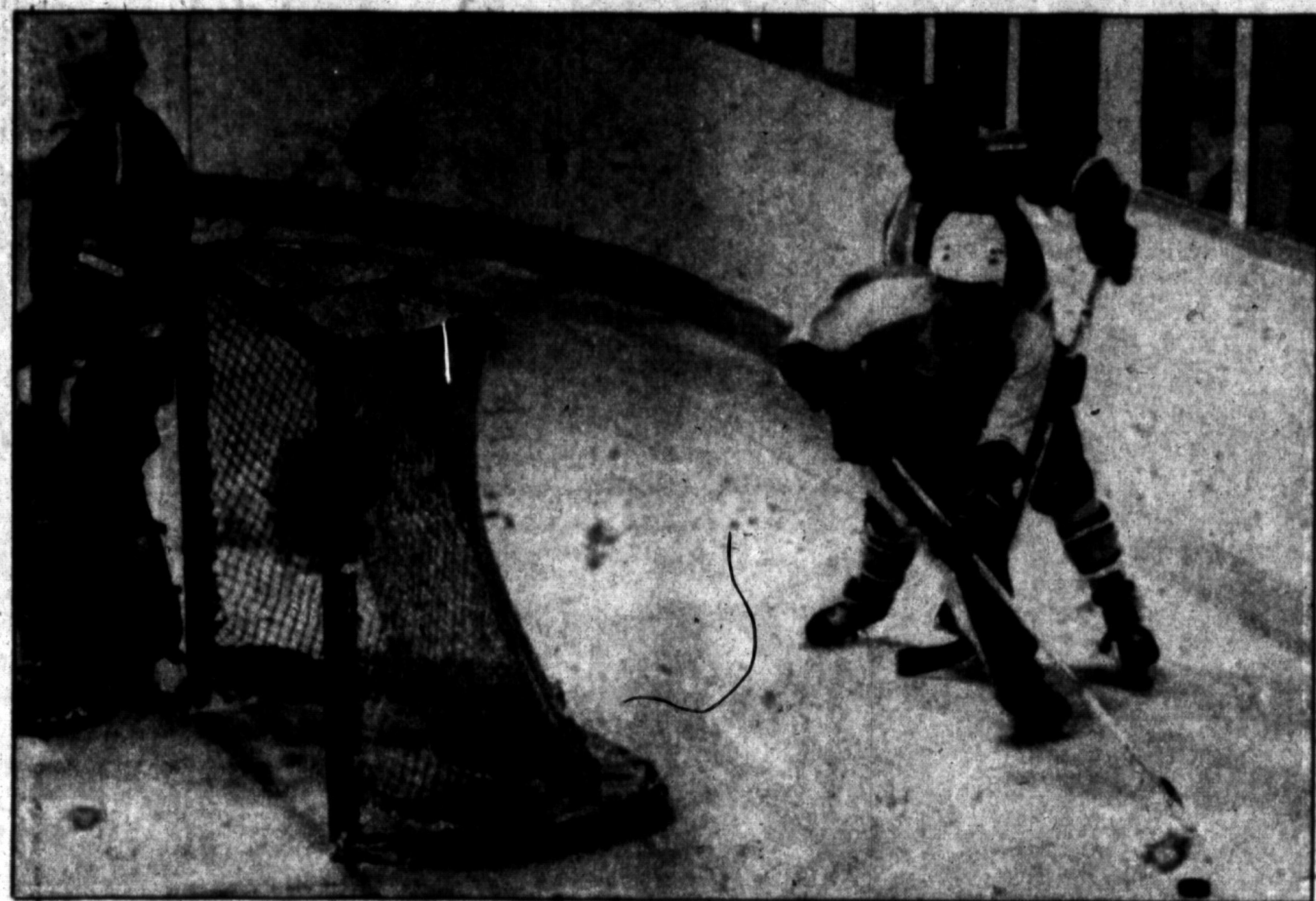
A Baugh Construction forward tries to sneak up behind the Welder net. It's do or die for Baugh Sunday.