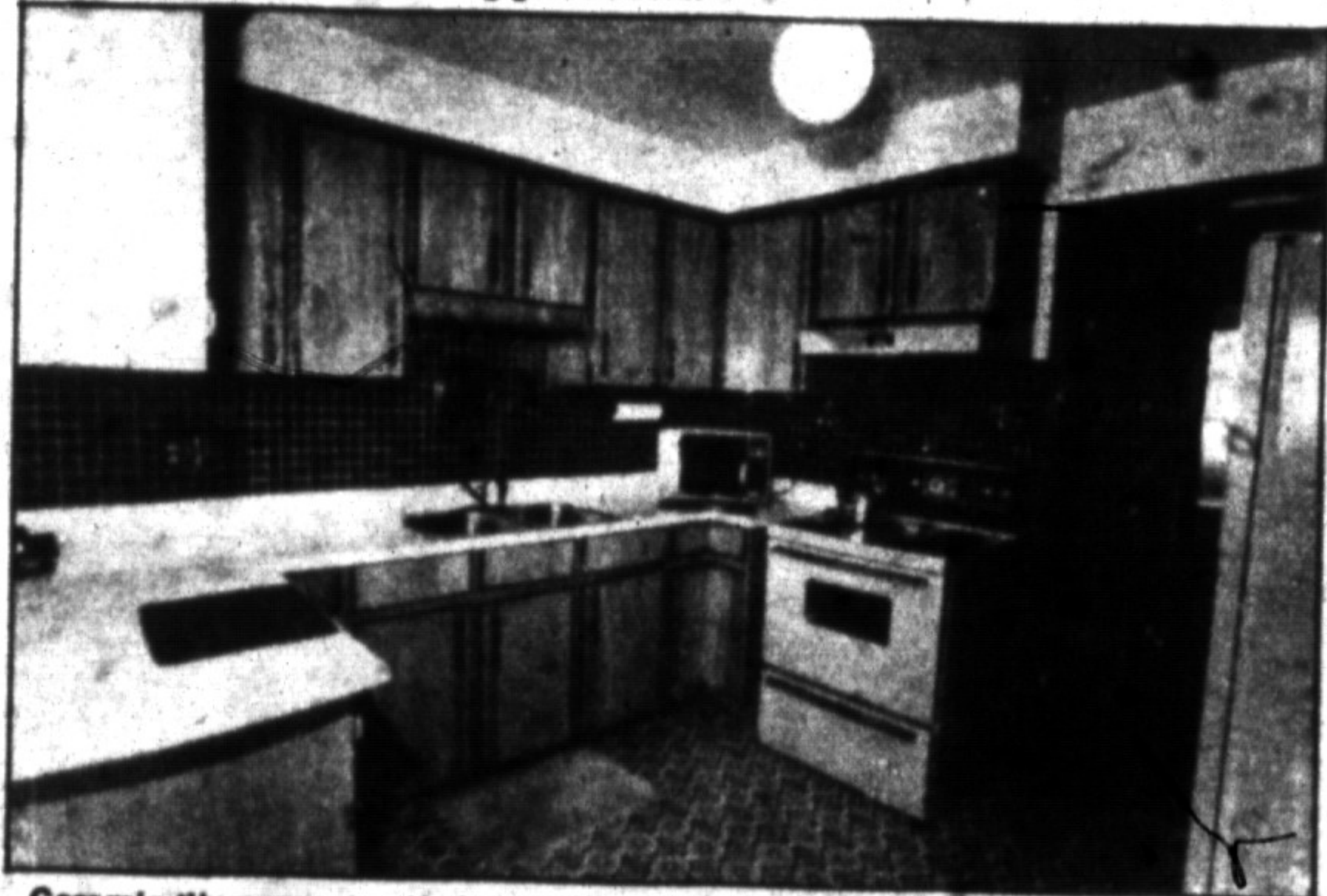
Ceramic tile separates the counter from the cupboards, providing an attractive and practical extra.