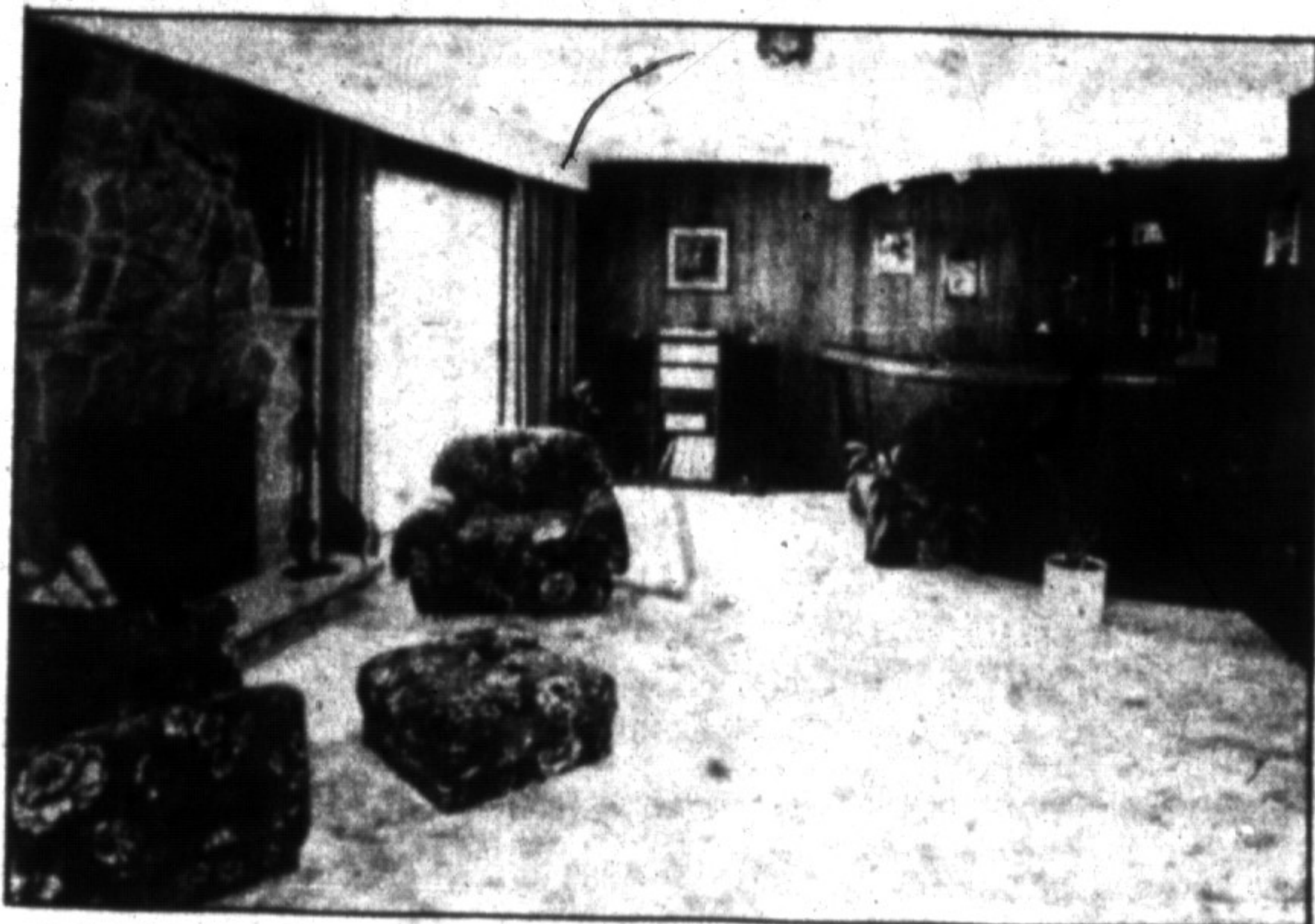
A family room like this is one many people only dream of having, complete with fireplace, bar and sliding glass doors.