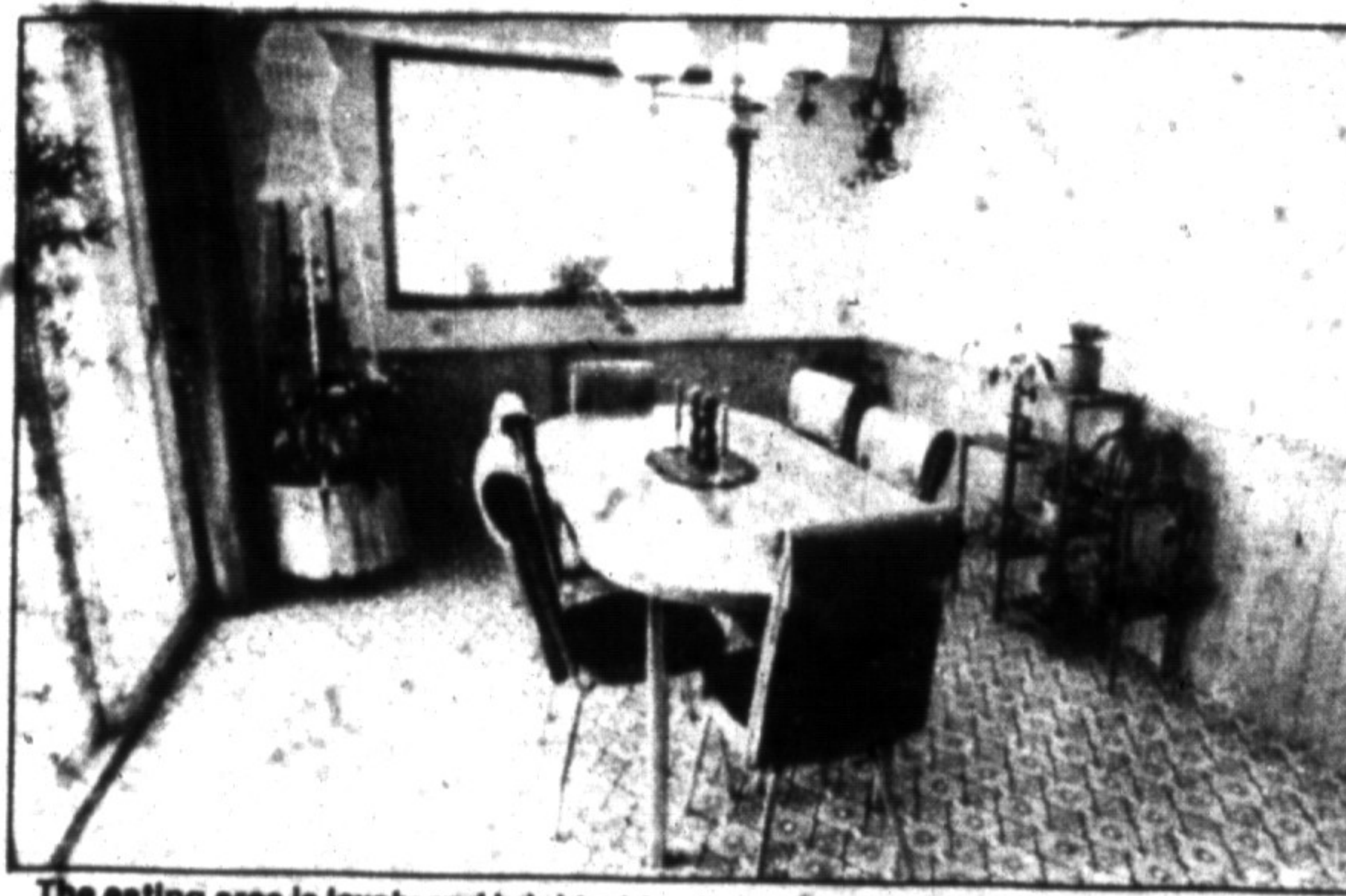
The eating area is lovely and bright with a large window and sliding glass doors.