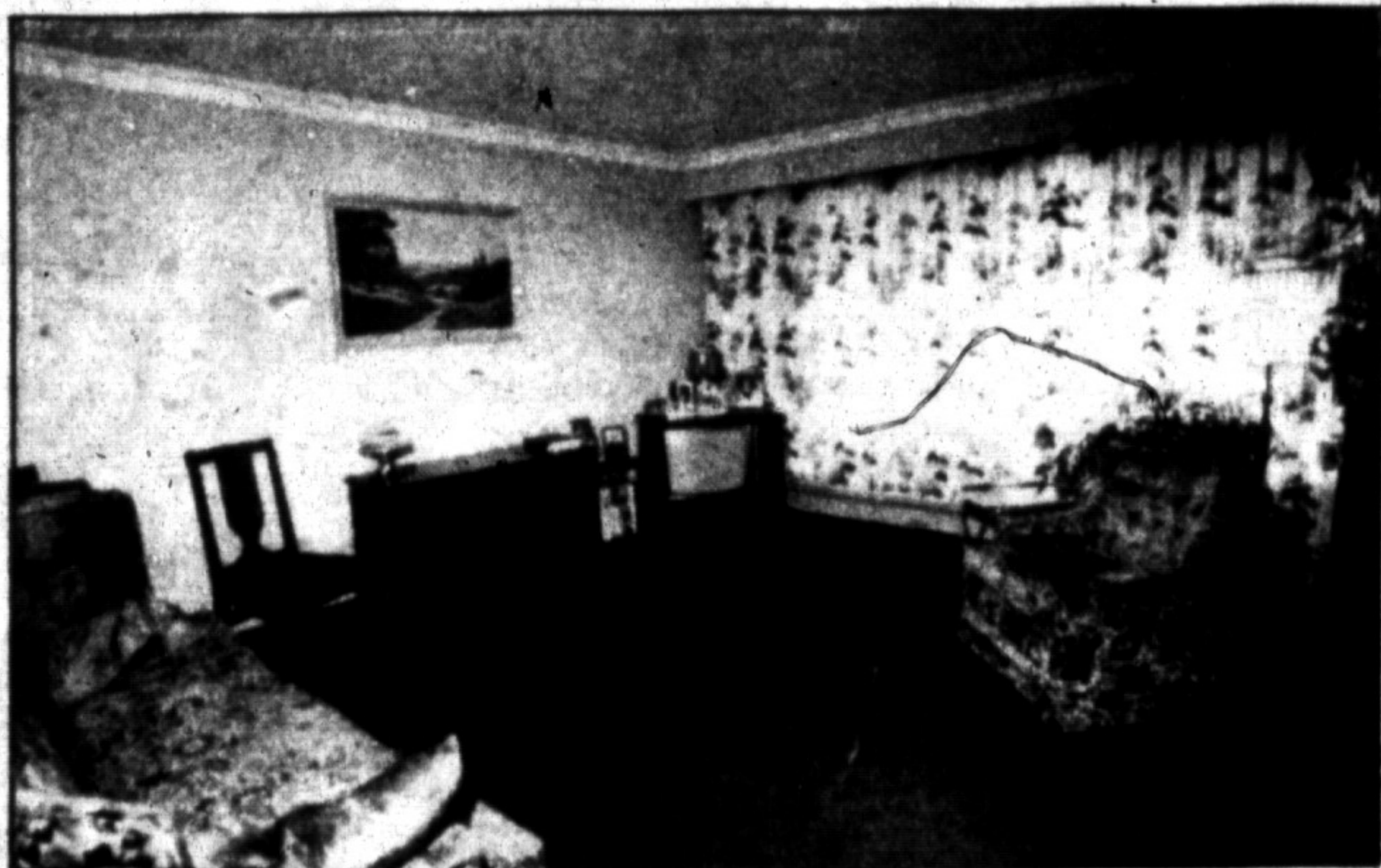
The living room can be saved for special occasions as this house has a family room for everyday use.