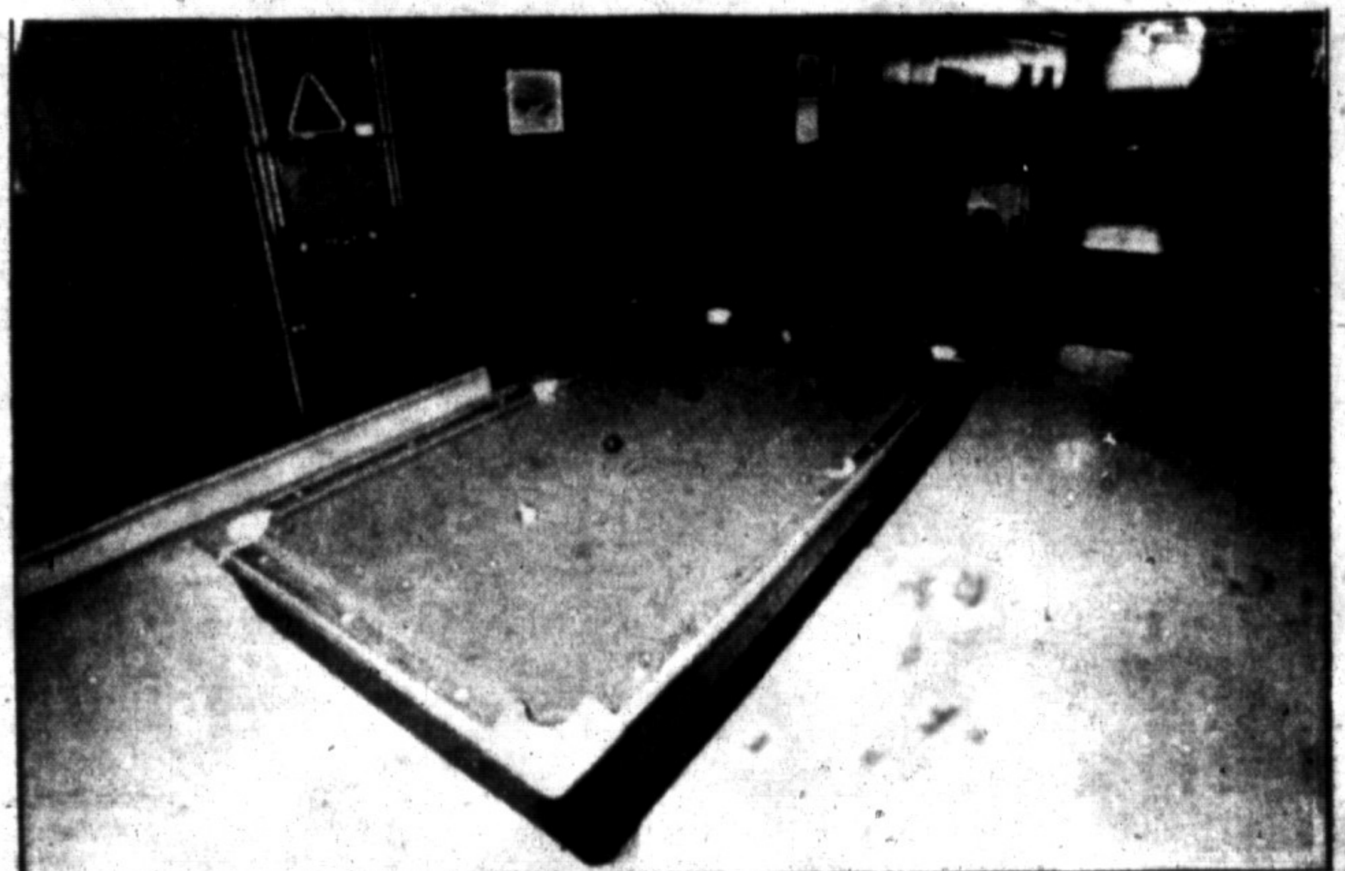
There is room to shoot a game of pool in this large recreation area.