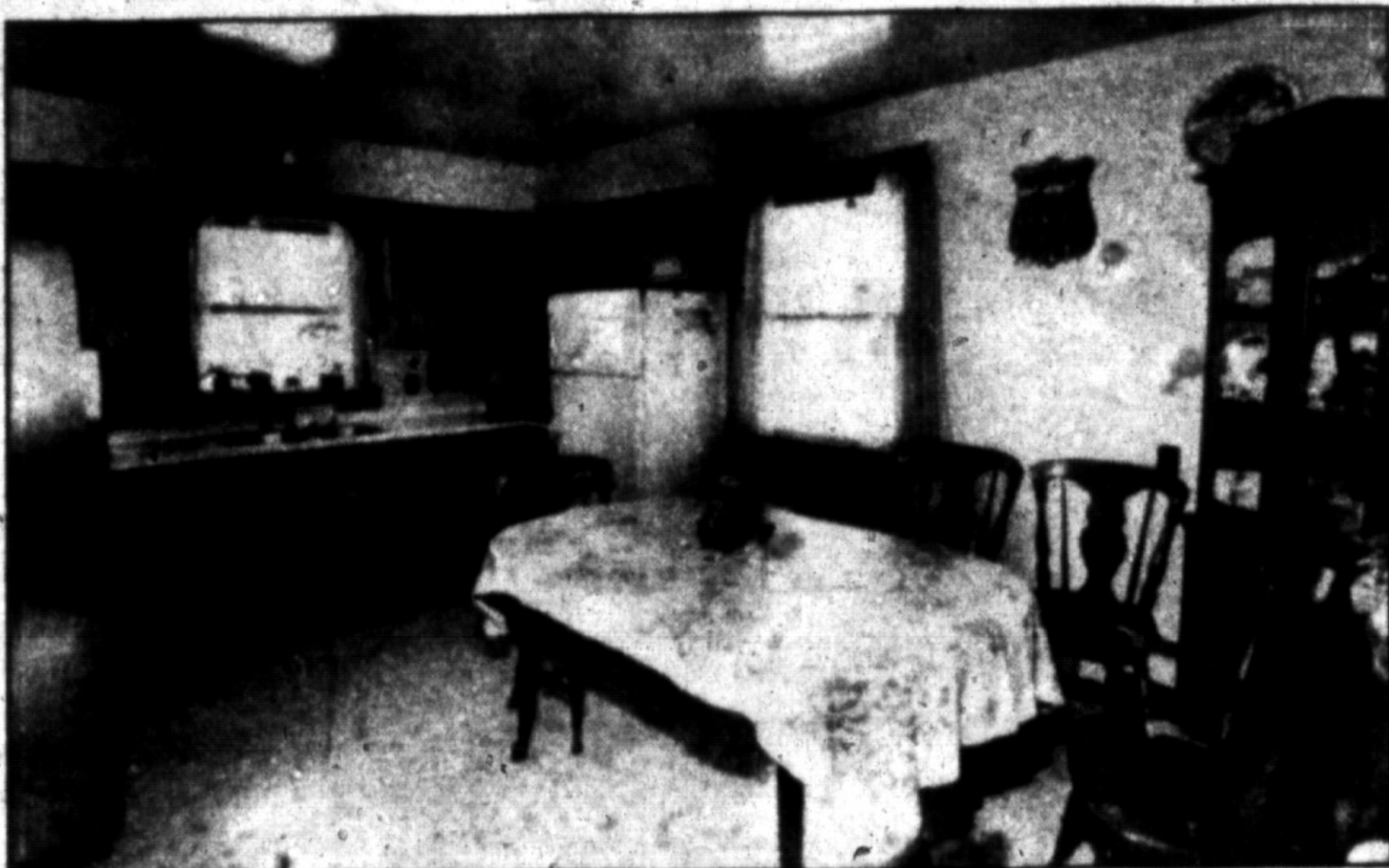
One of two kitchens, it provides plenty of space for cooking and dining.