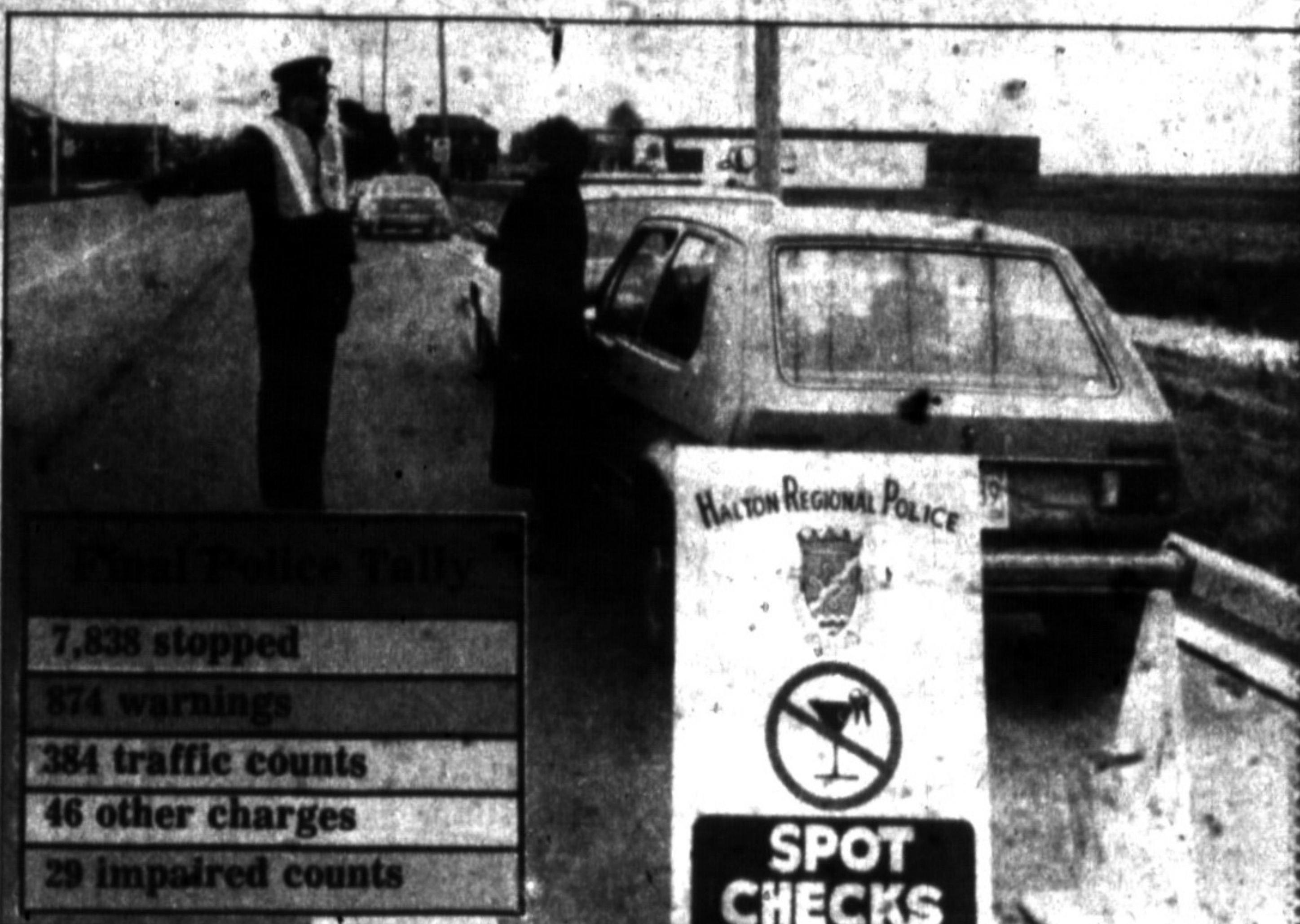
Halton Regional Police completed their spot-check program and report the number of charges for impaired driving down considerably from the year prior. Police stopped 7,838 cars in December and charged 29 with drinking-driving offences.