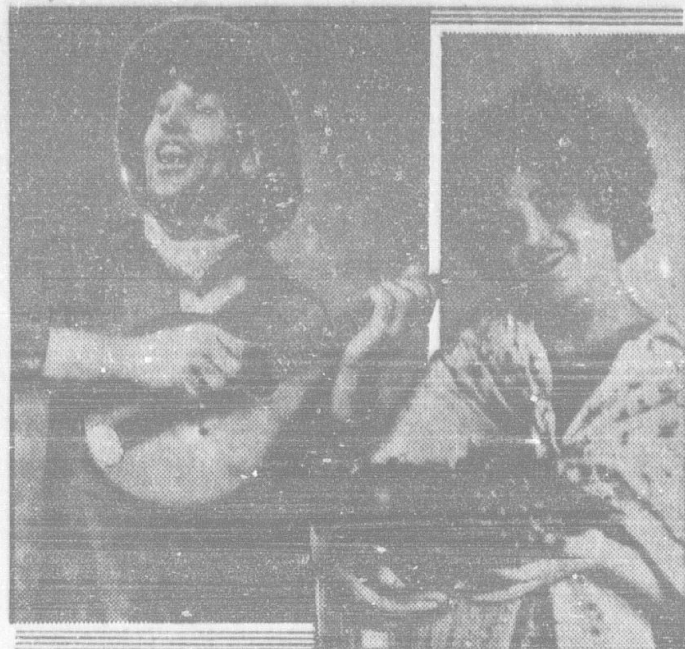
With a selftimer on your camera, you can make "character" snapshots of yourself.

Did you ever stop to think that all of us have had a desire at some time to be a stage or screen star? Deny it or not it is still true that we like to see ourselves in pictures—although it may be just a snapshot.