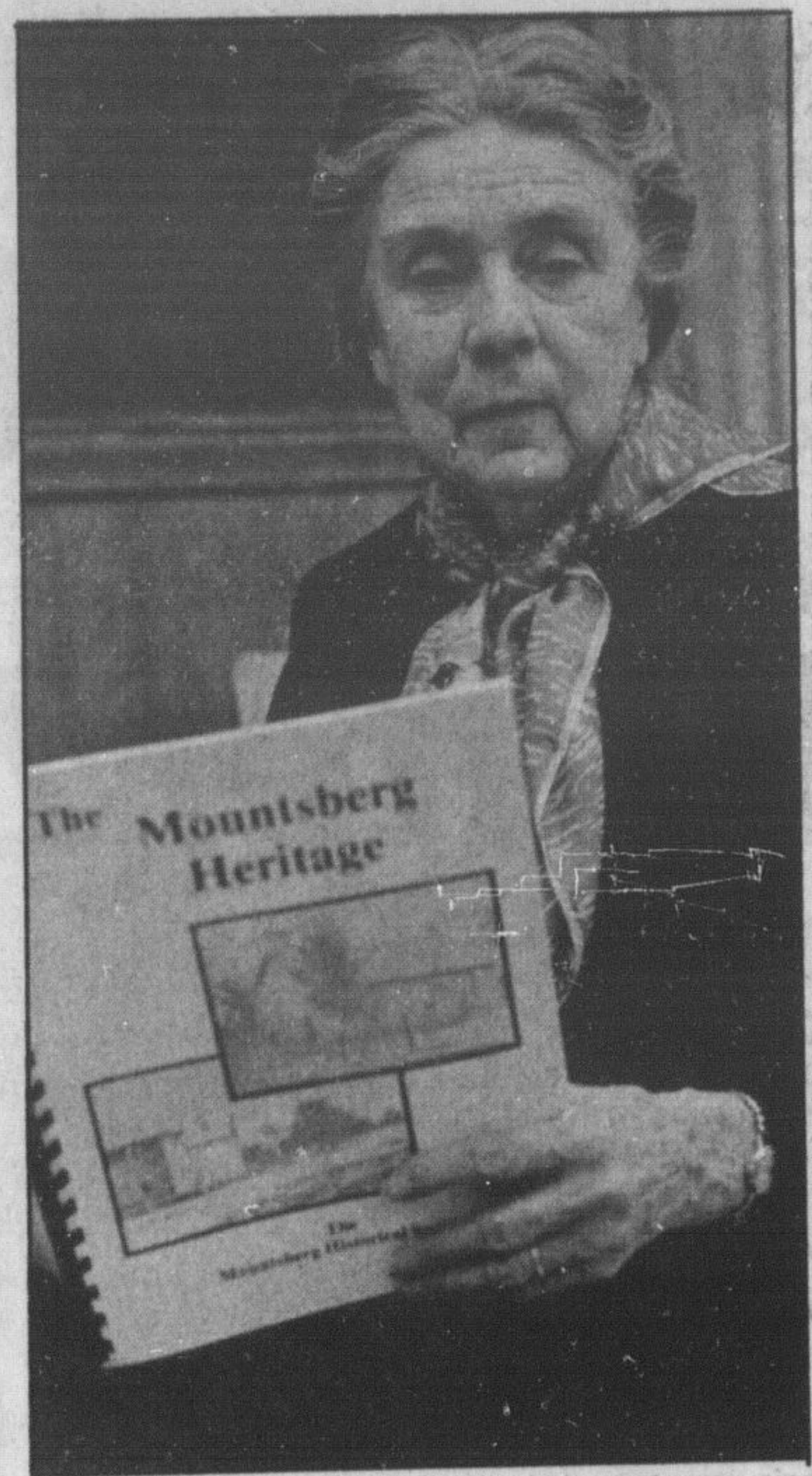
AUTHOR MERLE HEWINS CUST