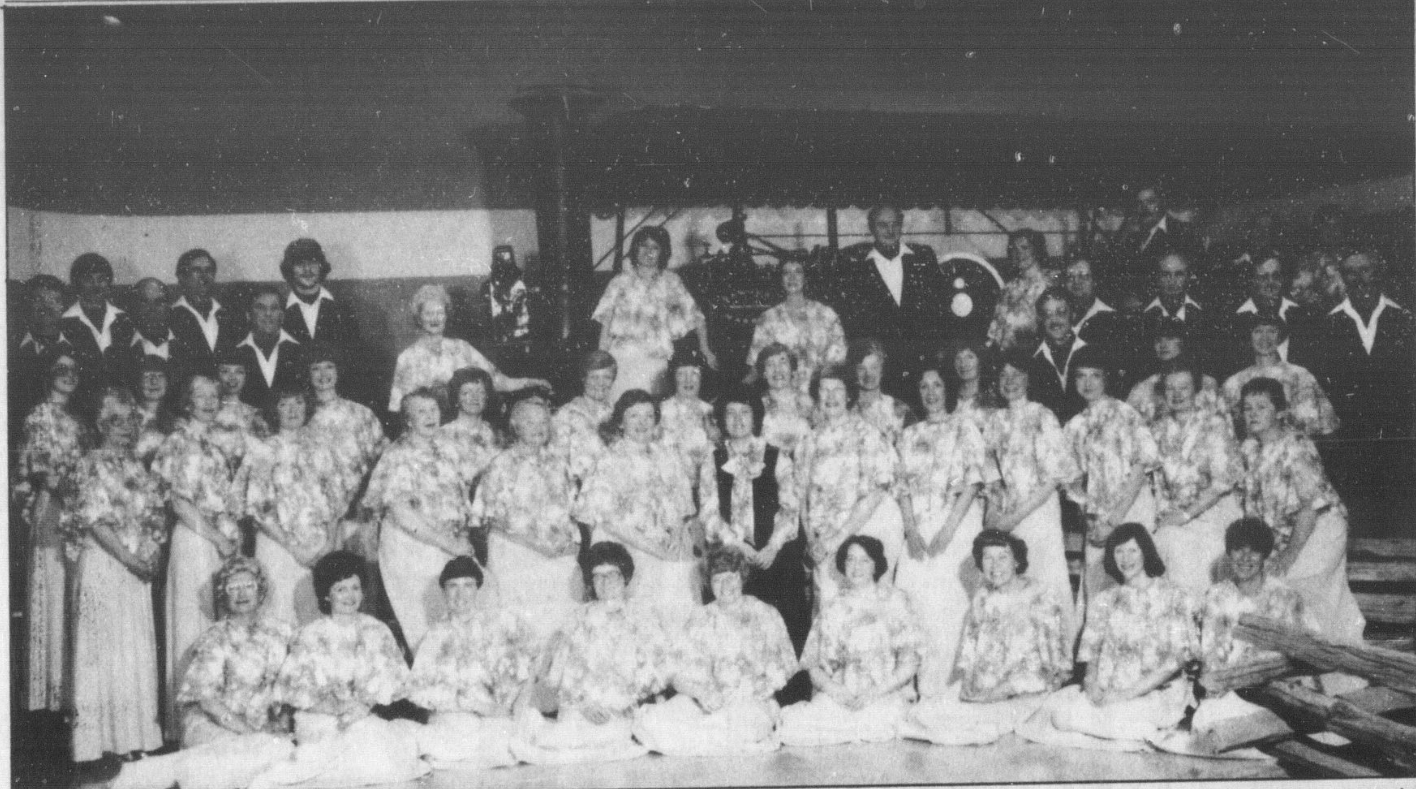
Milton Choristers. The 60-voice choir has just released its first long-play record, "A Gift of Song." The group posed for this photo by Gordon Campbell at Ontario Agricultural Museum in Milton, and it decorates the record jacket.