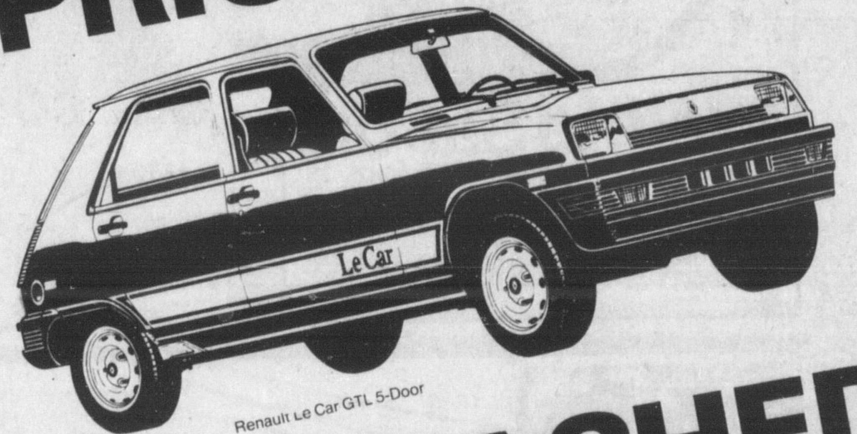
Renault LeCar GTL 5-Door