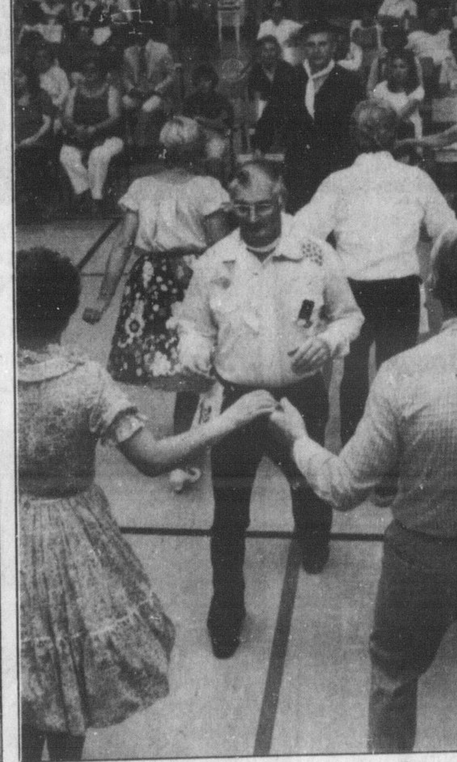
Swing along. Scotch Block Square Dancers entertained the crowd at the Old Fashioned Days costume judging contest.