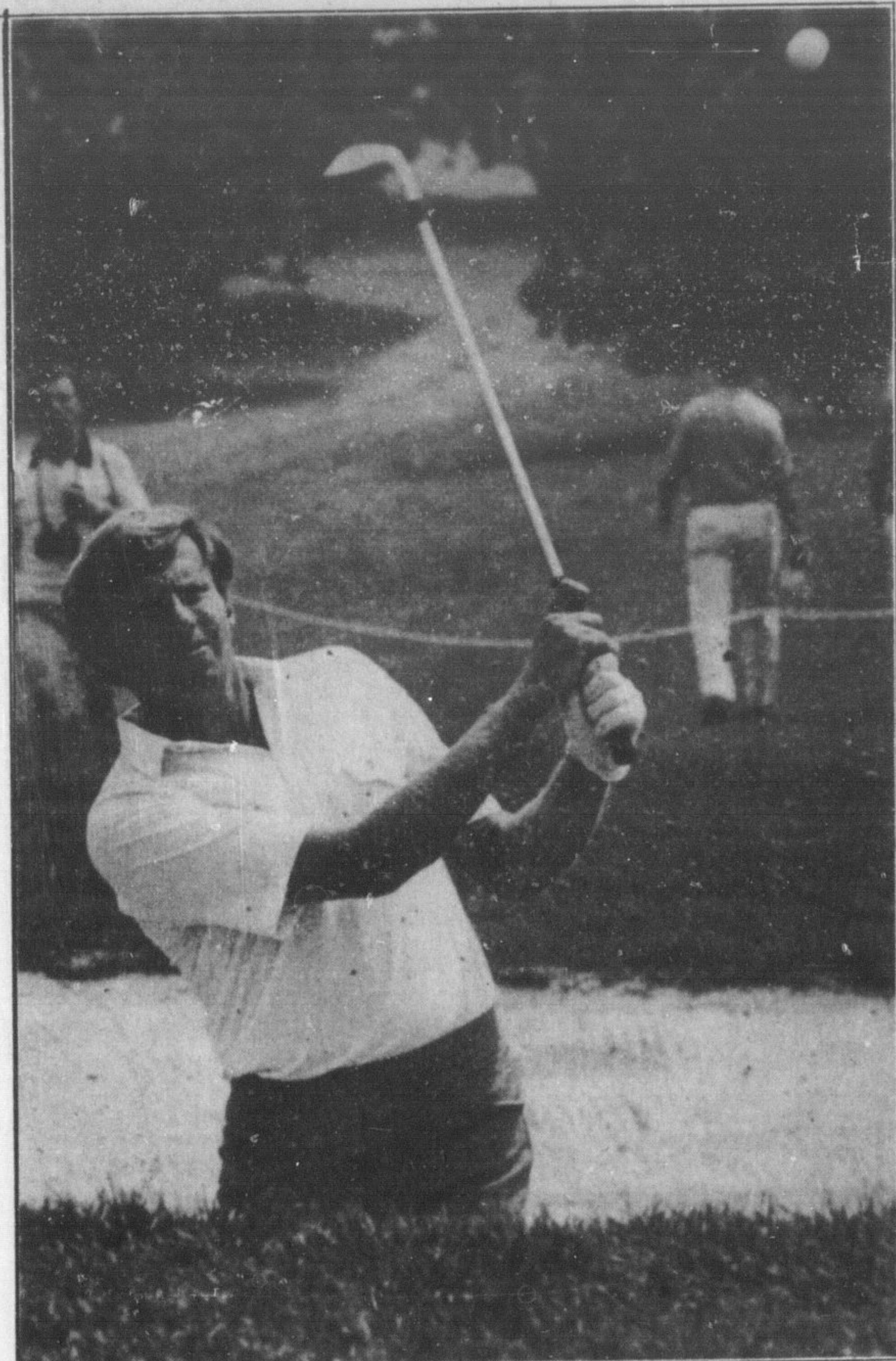
Winning form. Peter Oosterhuis, the transplanted English golfer, drives out of the sand at Glen Abbey on his way to the Canadian Open title.