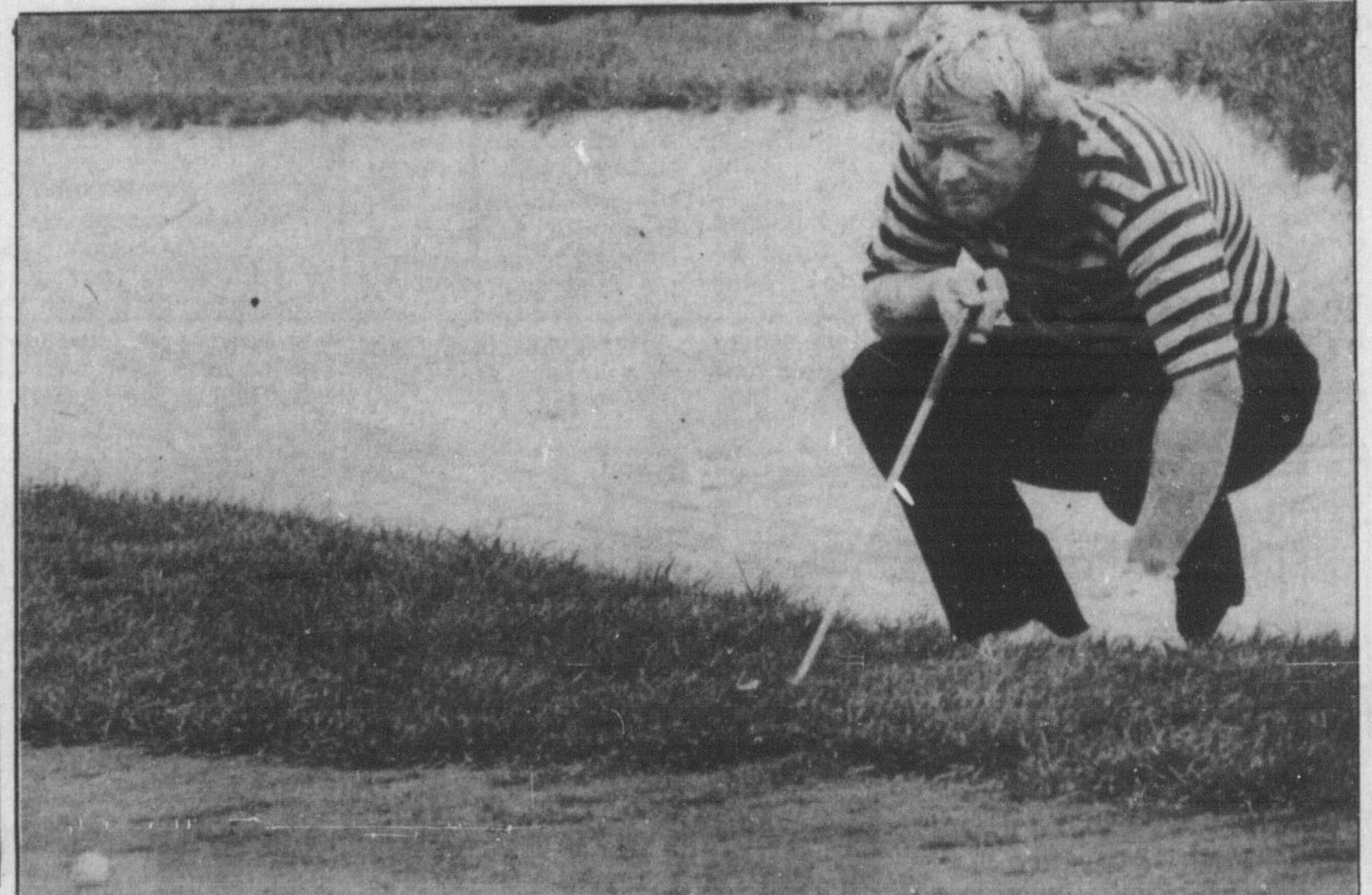
Jack's baby. Course designer Jack Nicklaus, who finished second for the fifth time, eyes an eagle putt (which he missed) on the 18th at Glen Abbey. The putt cost him the title and about $45,000 prize money.