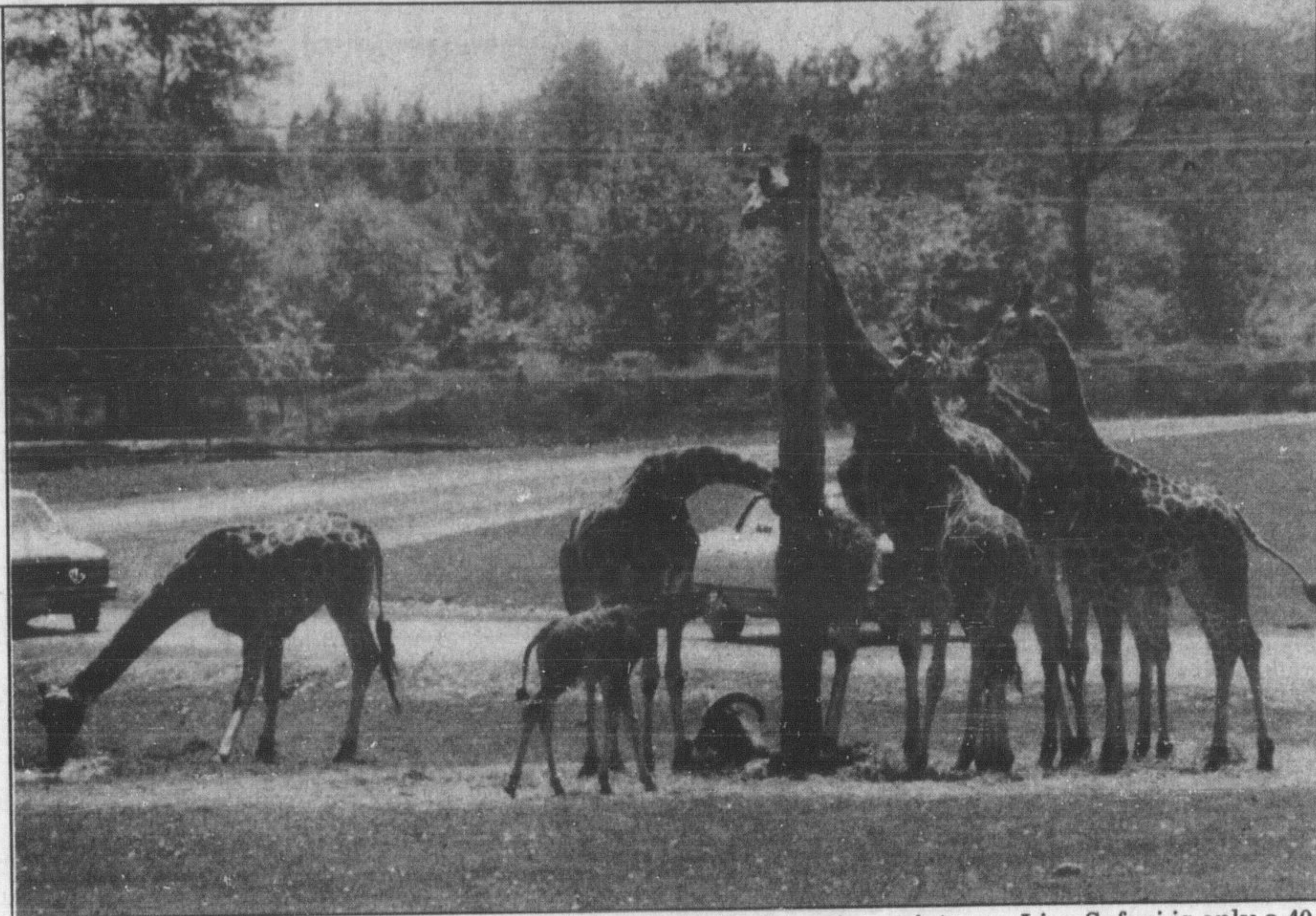
Chow time. When attendants toss out a bale of hay, the giraffes gather around for lunch and the African Lion Safari visitor gets a good opportunity for unique pictures. Lion Safari is only a 40-minute drive from Milton.