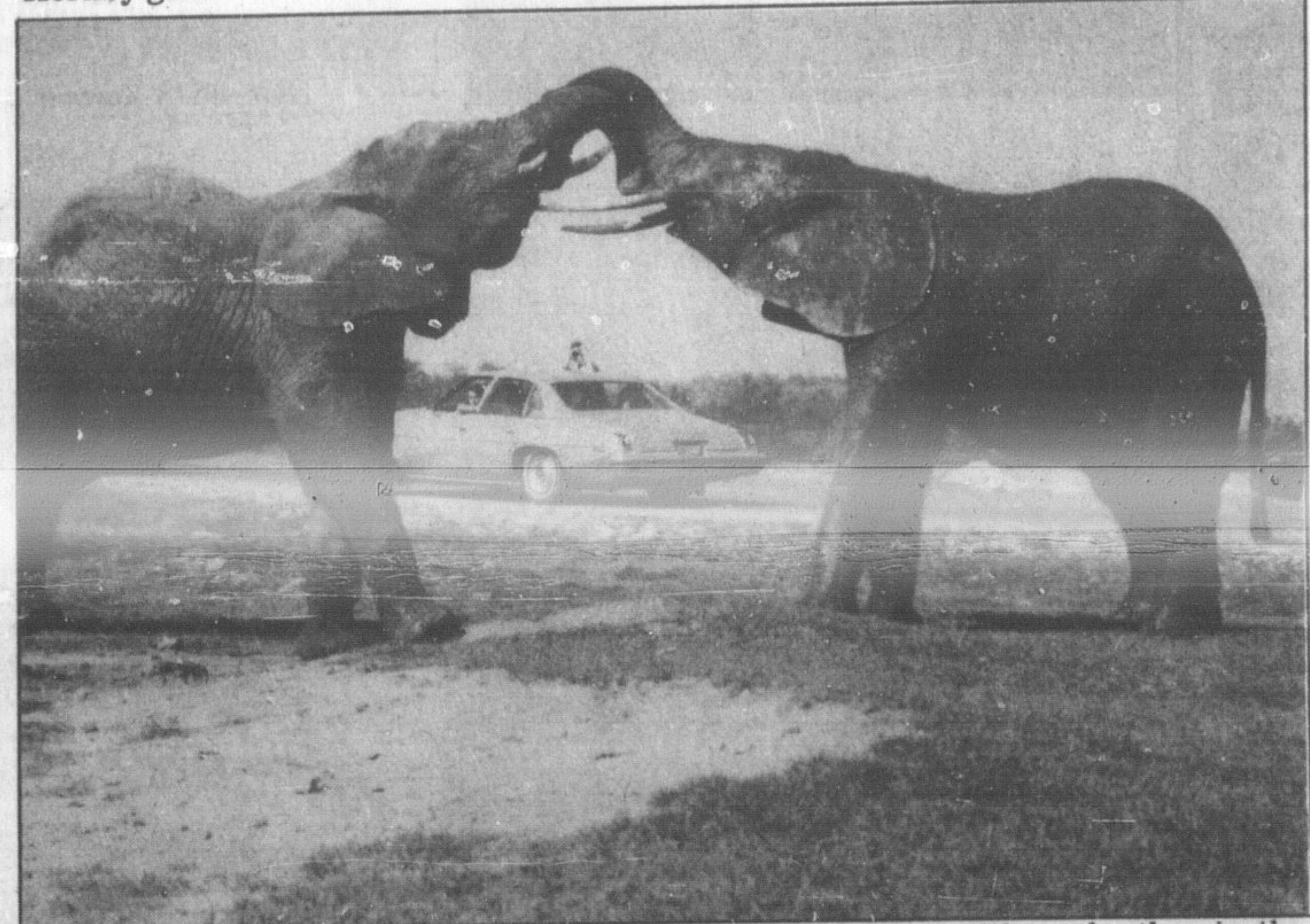
Only playing. The elephants continuously pretend to fight with each other in the Lion Safari game preserve, but they're only funning. Yes, you can drive your car through the wildlife park.