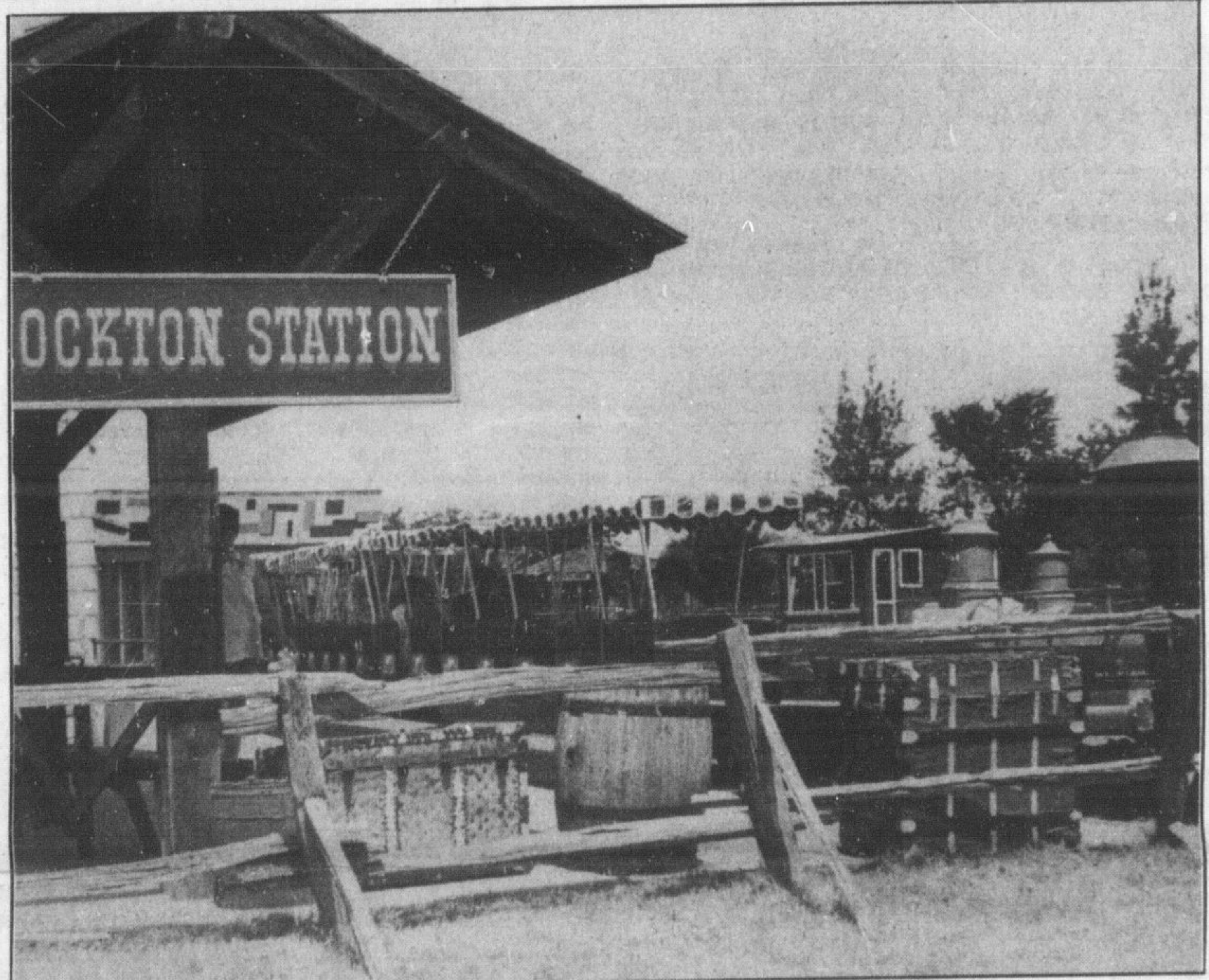
Rockton Station. That's where you get a thrilling ride on the miniature Safari Train through African Lion Safari.

The park covers 500 acres and boasts 1,000 wild animals and birds. "Spend a day on safari, in deepest, darkest Ontario," says the brochure.