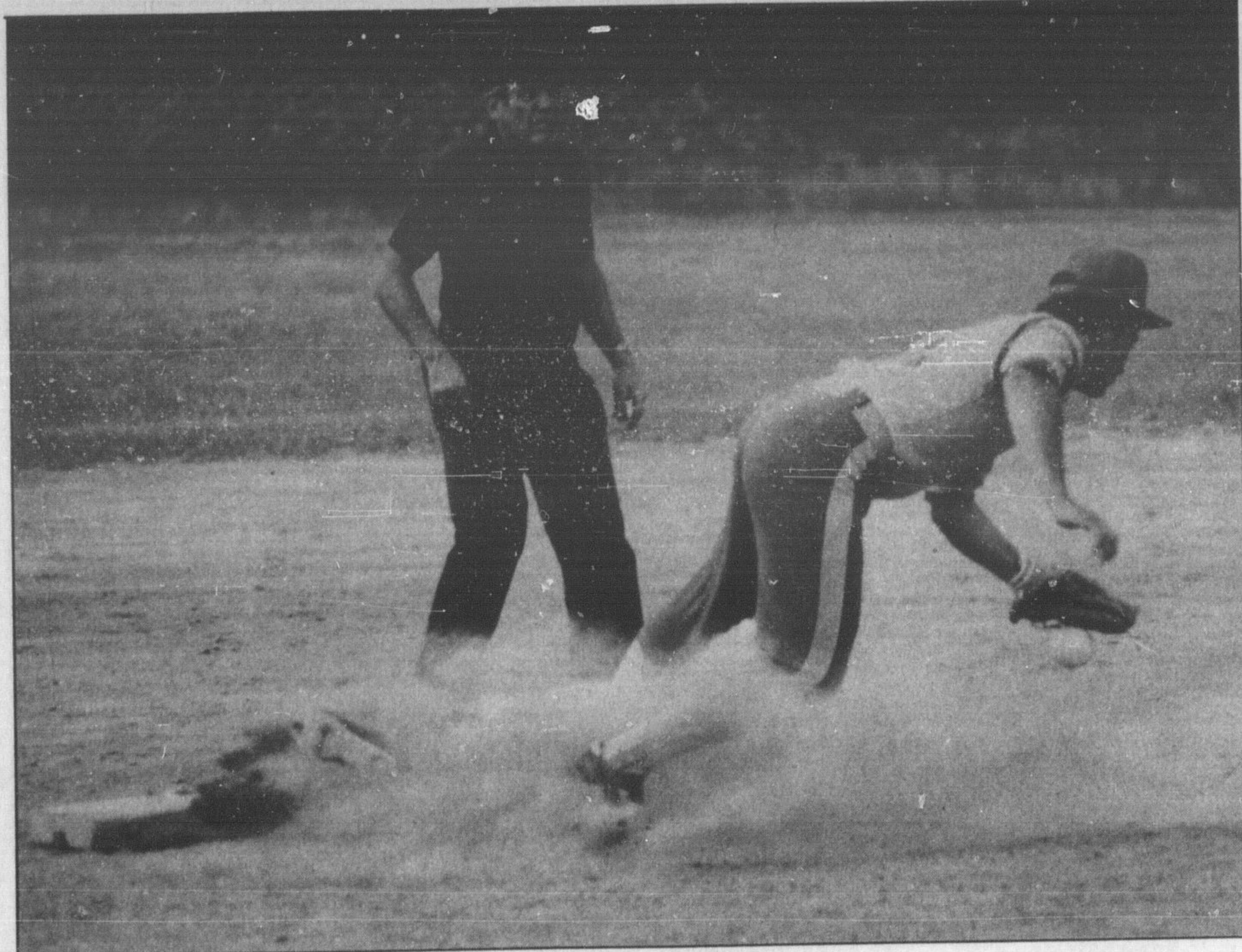
He's in there . . .

Somewhere in the dust (look for the shoe near the bag) is a Kilbride Merchant sliding safely into second base with a steal. Kilbride went on to win posting 18 runs to gain a split of their doubleheader with Stratford Sunday.