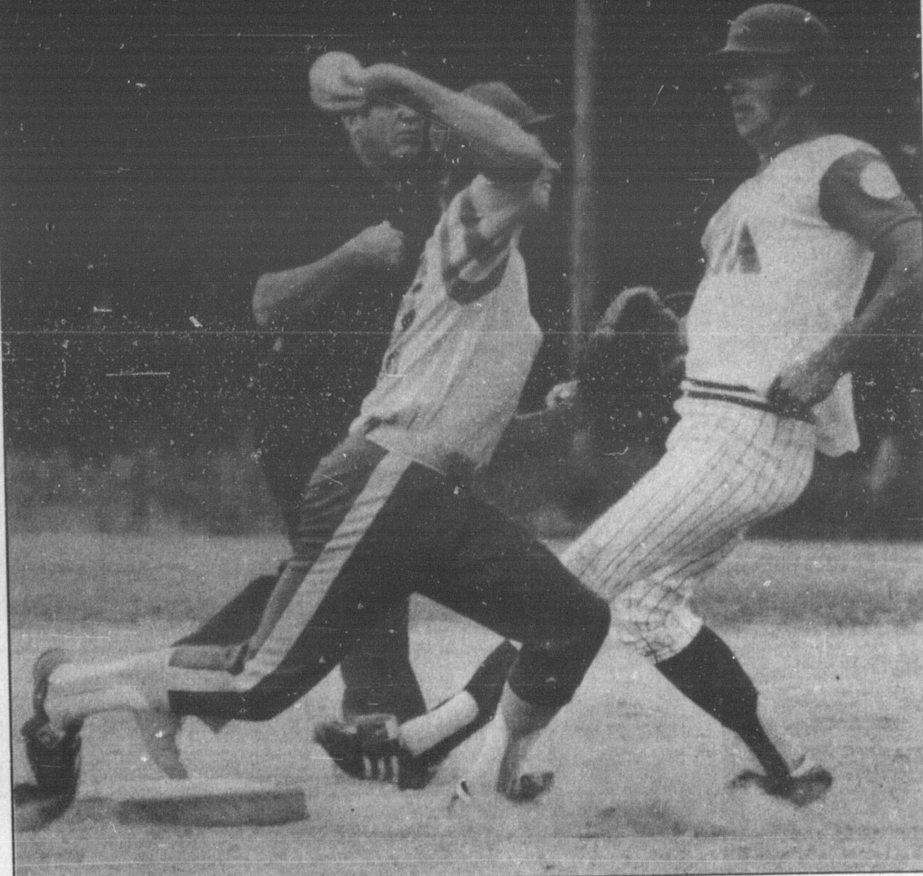
. . .but they got this guy

Somewhere in the dust (look for the shoe near the bag) is a Kilbride Merchant sliding safely into second base with a steal. Kilbride went on to win posting 18 runs to gain a split of their doubleheader with Stratford Sunday.