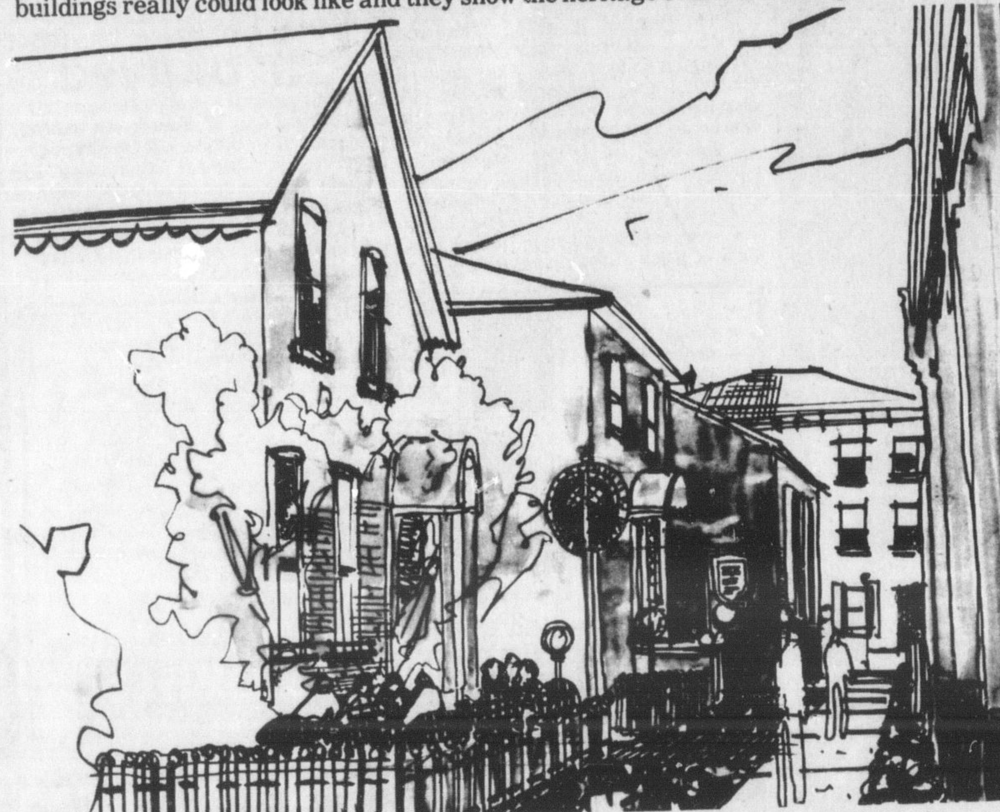
Another laneway suggestion. There the consultants have transformed the laneway alongside Knox Church to part of the heritage walkway they are proposing.