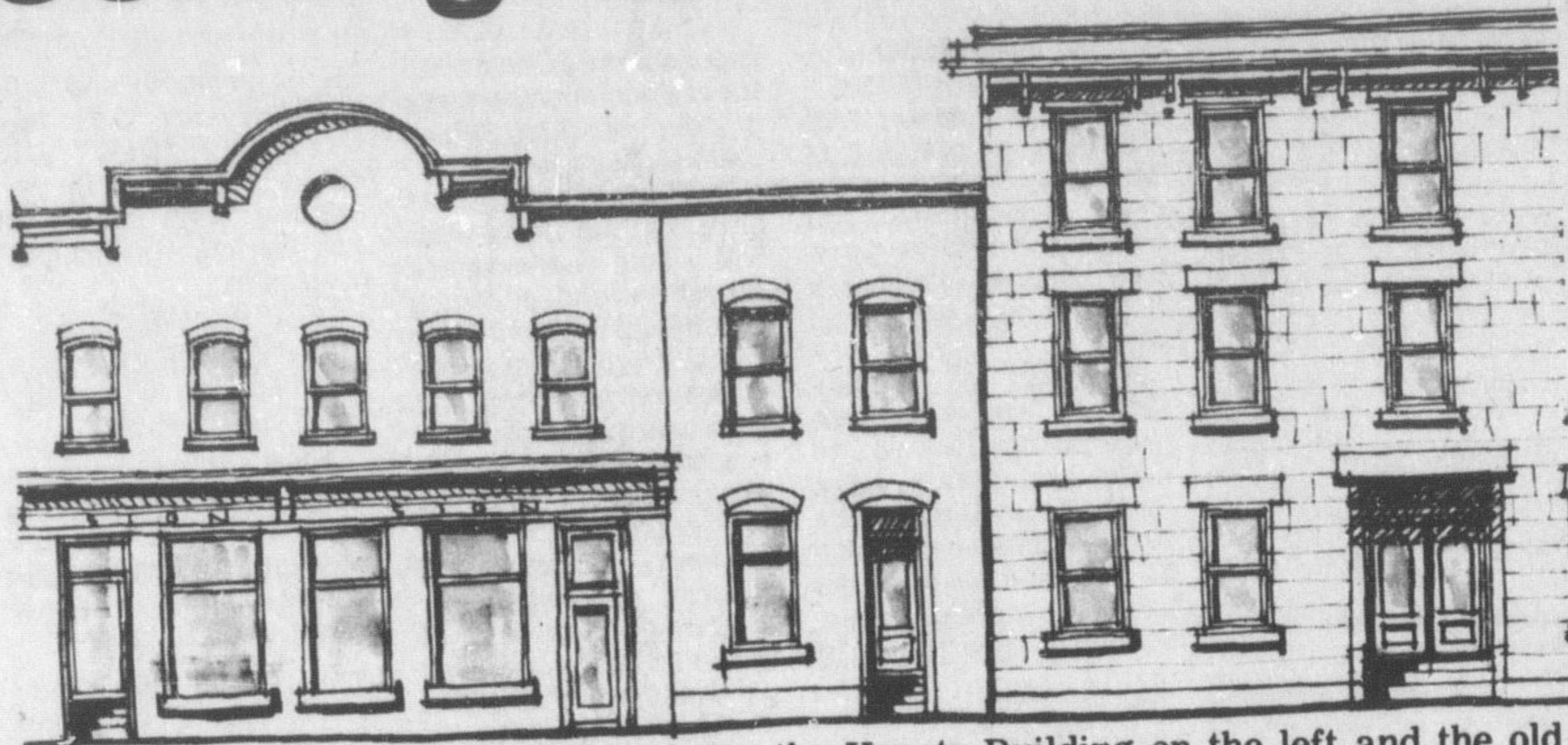
There is beauty to be found. This shows the Krantz Building on the left and the old Thompson House Hotel on the right. Beneath the paint and false fronts this is what the buildings really could look like and they show the heritage construction to good effect.