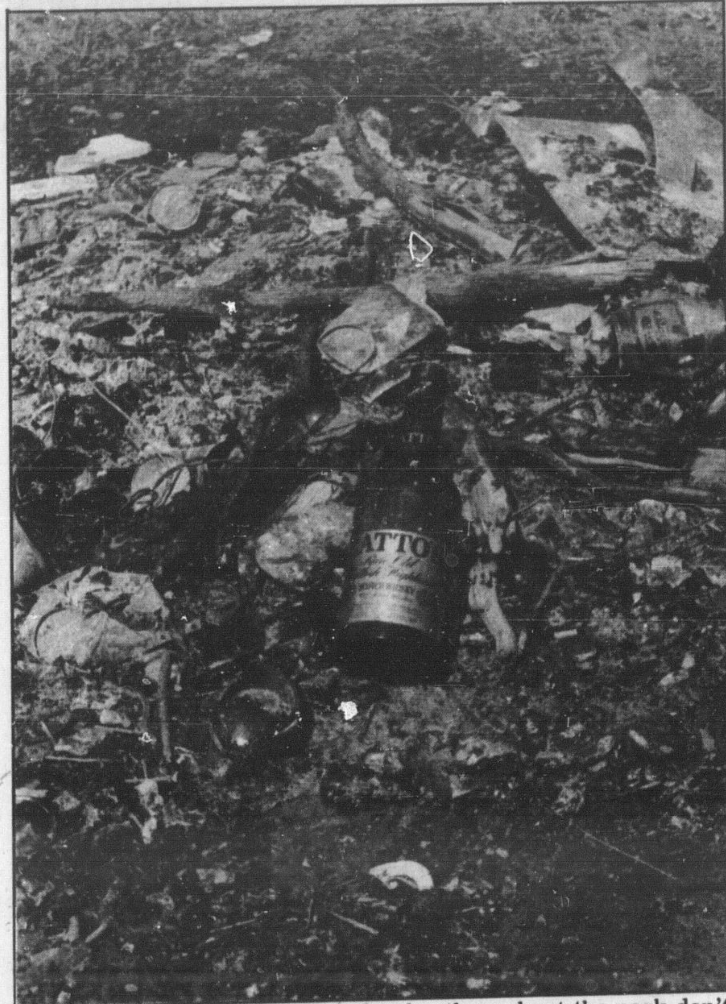
Picnic remains. Smashed beer bottles throughout the park don't leave it fit for anybody to walk through. Police say half of the problem lies with weak town by-laws that permit beer in the parks.

Although present liquor laws prevent any individual from drinking in other than a licensed public place, Milton is the only area where beer is allowed in the parks, said police.