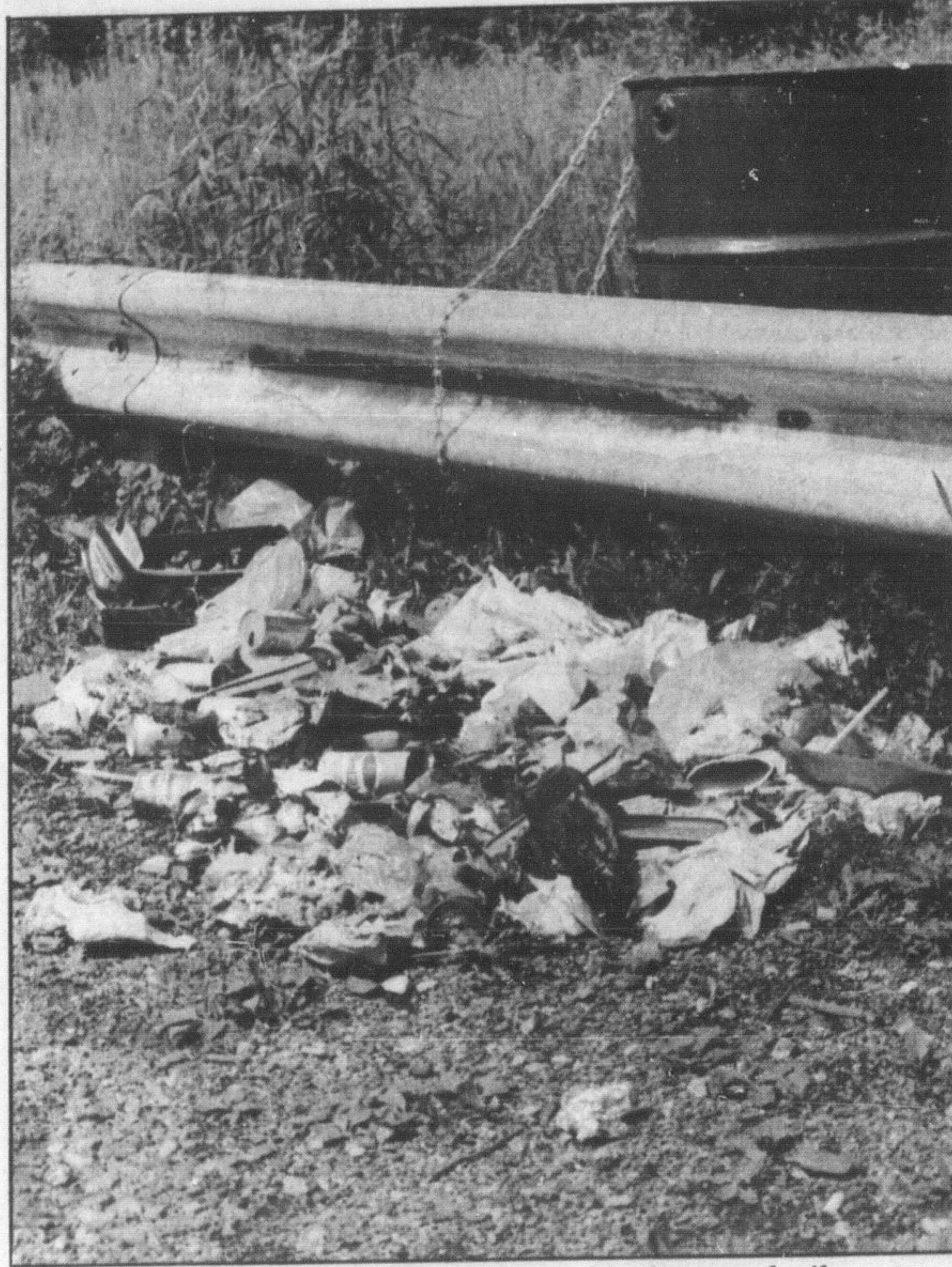
Not a pretty sight. Garbage bins chained to the guardrail are rarely used. Instead debris is strewn through the park and parking lot area. This scene is commonplace at Henderson Park, off Lower Base Line Rd. Excessive damage last year to the park forced its closure, but police hope this year a park patrol will discourage drinking parties.