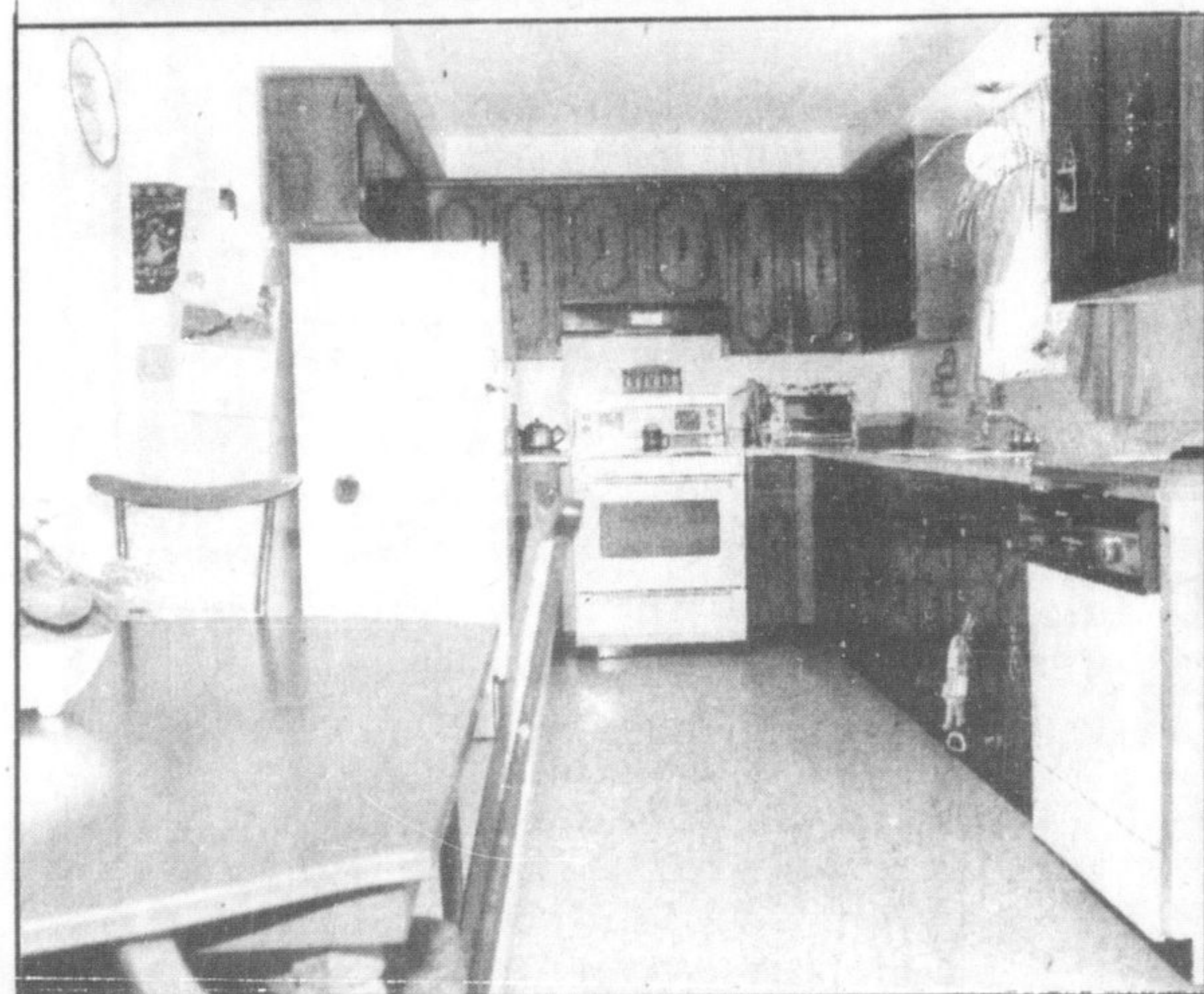
Kitchen bliss. With plenty of cupboard space and counter top areas, nobody will be able to complain about doing kitchen duties. The breakfast area at one end of the kitchen also makes it handy to feed the family on informal occasions.