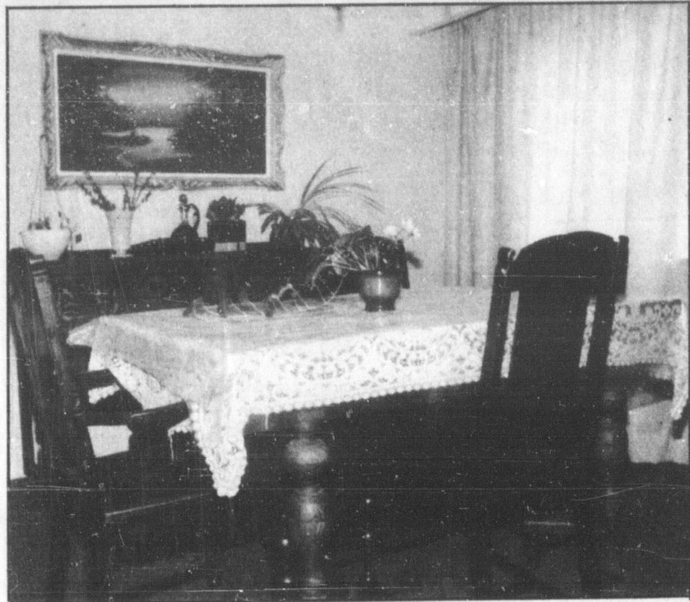
Dining Elegance. This traditionally styled dining room offers the perfect spot for entertaining on those special occasions. It includes a large window overlooking the side lawn.