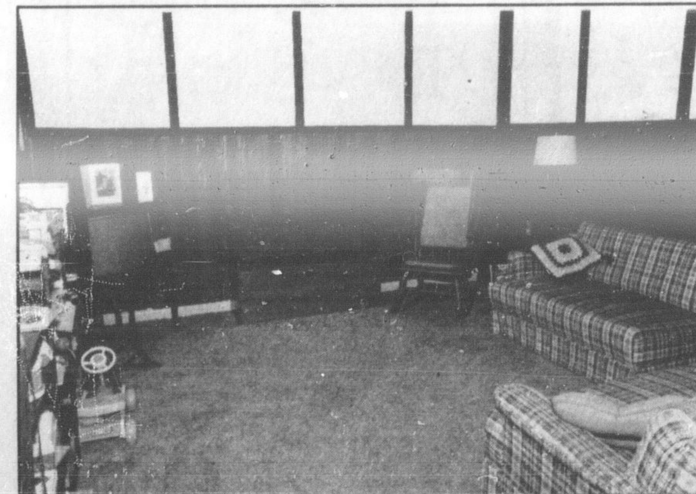
Need some extra room? This sunken family room located off the kitchen area offers the necessary space for a busy family with growing children. It can also double as a den or games room.