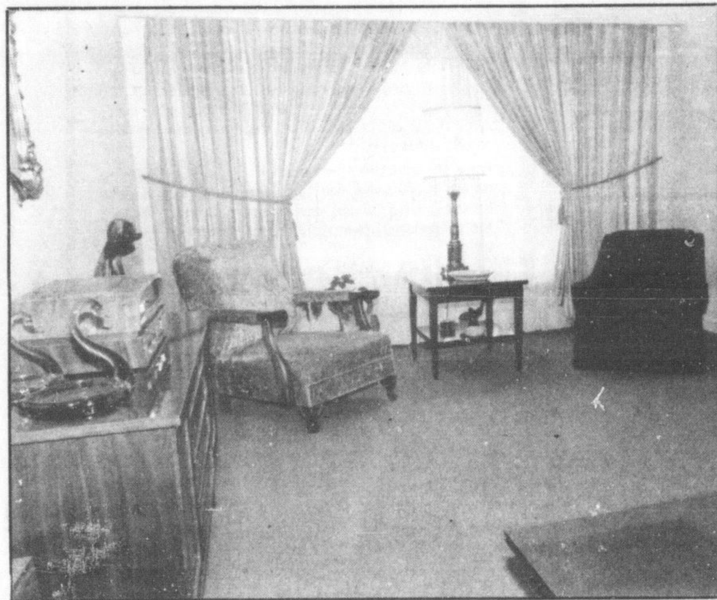
Spacious. Plenty of room is the nicest feature of this living area. The huge front window overlooks the front area of the home.