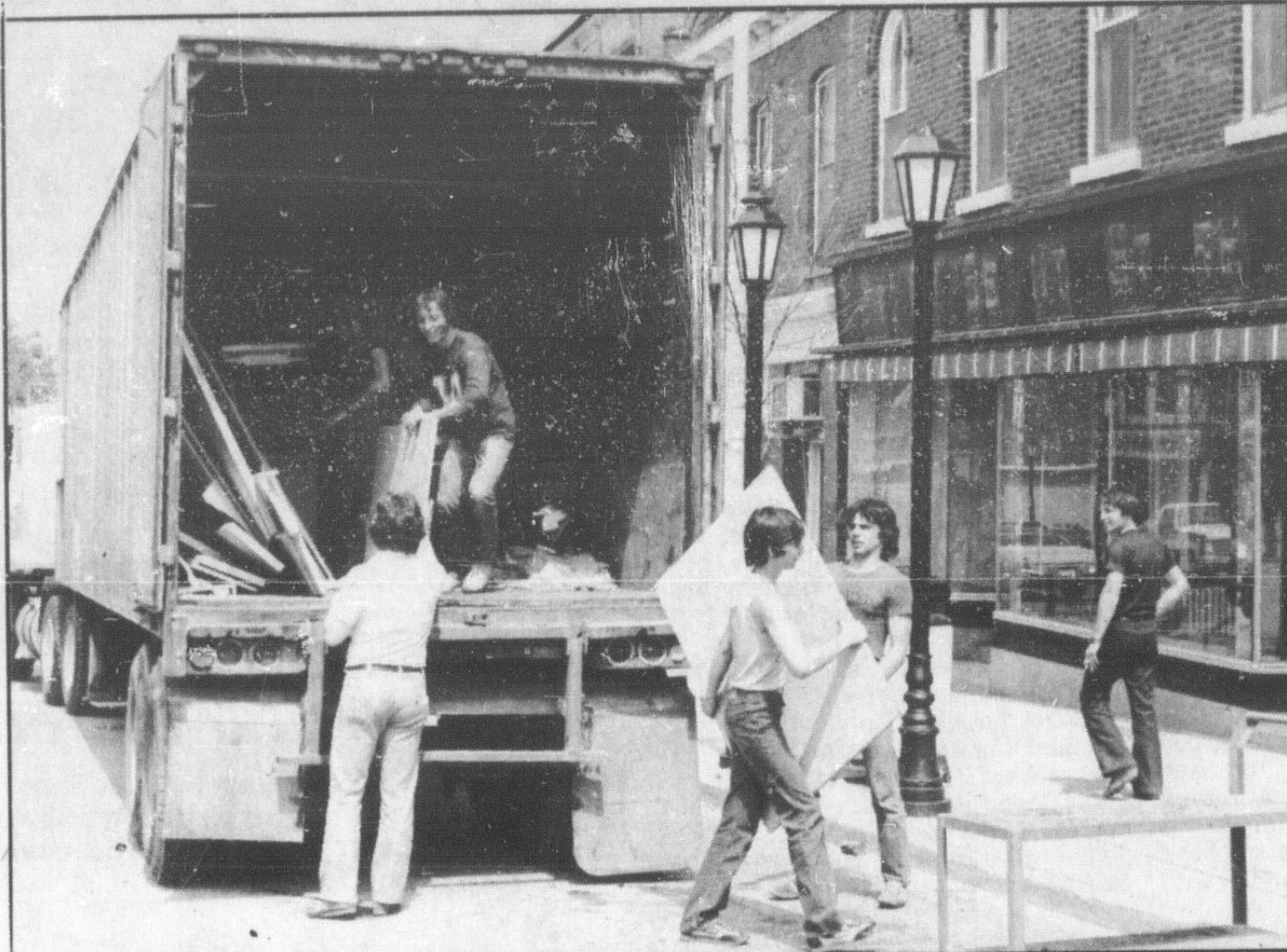
Moving in. Workers starting moving in shelving and display cases for the new BiWay store on Main St. last Thursday even though the opening is still a month away.