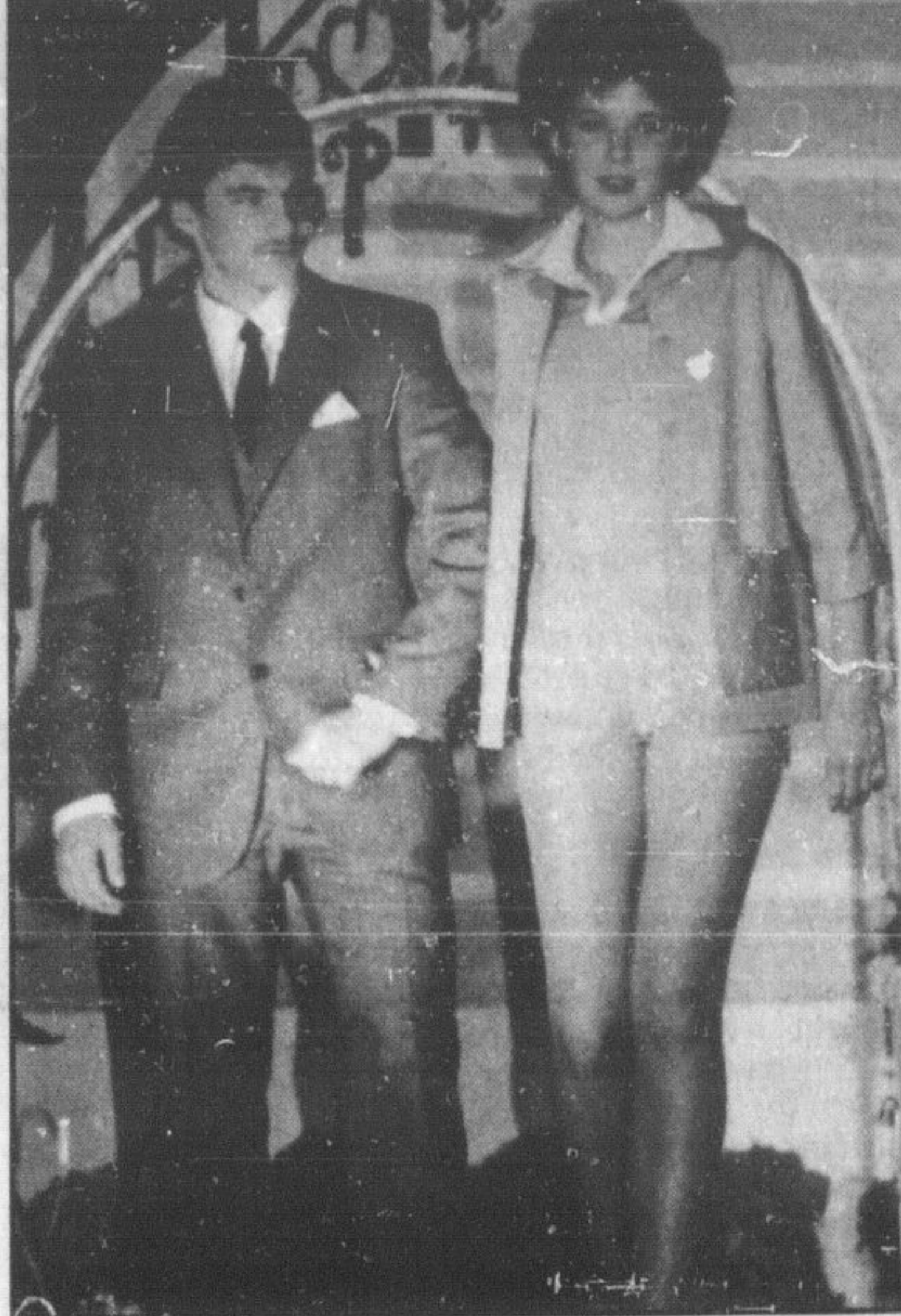
Drury fashions. Simplicity Patterns cooperated with Ernest C. Drury High School and School for the Hearing Handicapped, on a slick fashion show in the school auditorium last week. Students were models and the school band played background music.