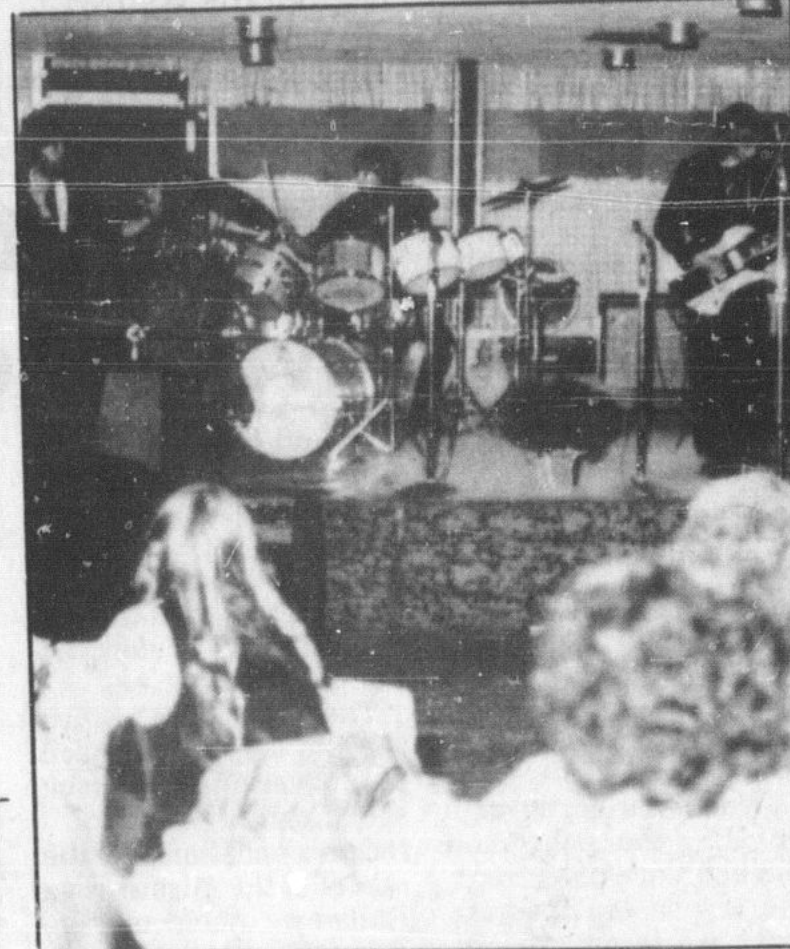
Rock show. The new local band Salem entertained at the "Off Broadway" production at the high school Wednesday.