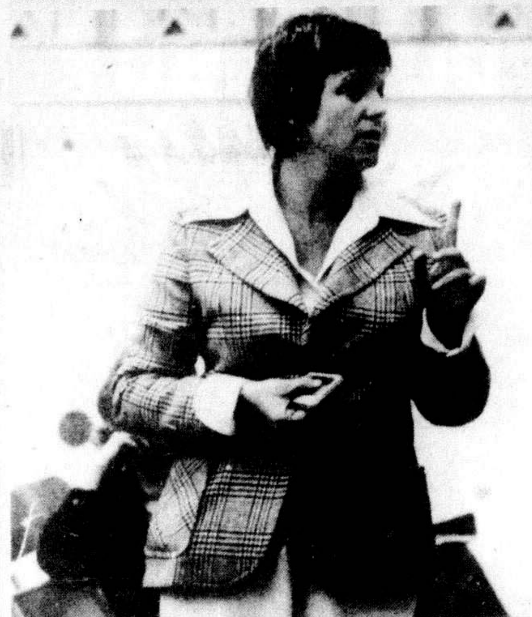
CONCERNED VOTERS last week took advantage of a question and answer session during an all-candidates meeting in Milton. Education was the topic at the Halton Renaissance Committee-sponsored event held at the Drury School.