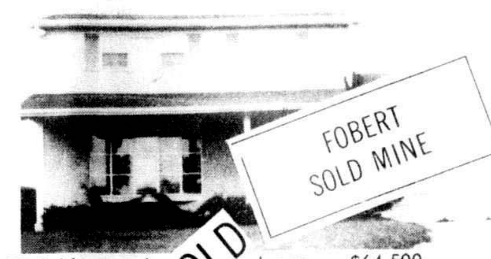
Model home, 1 1/2 acre trees . . . $64,500