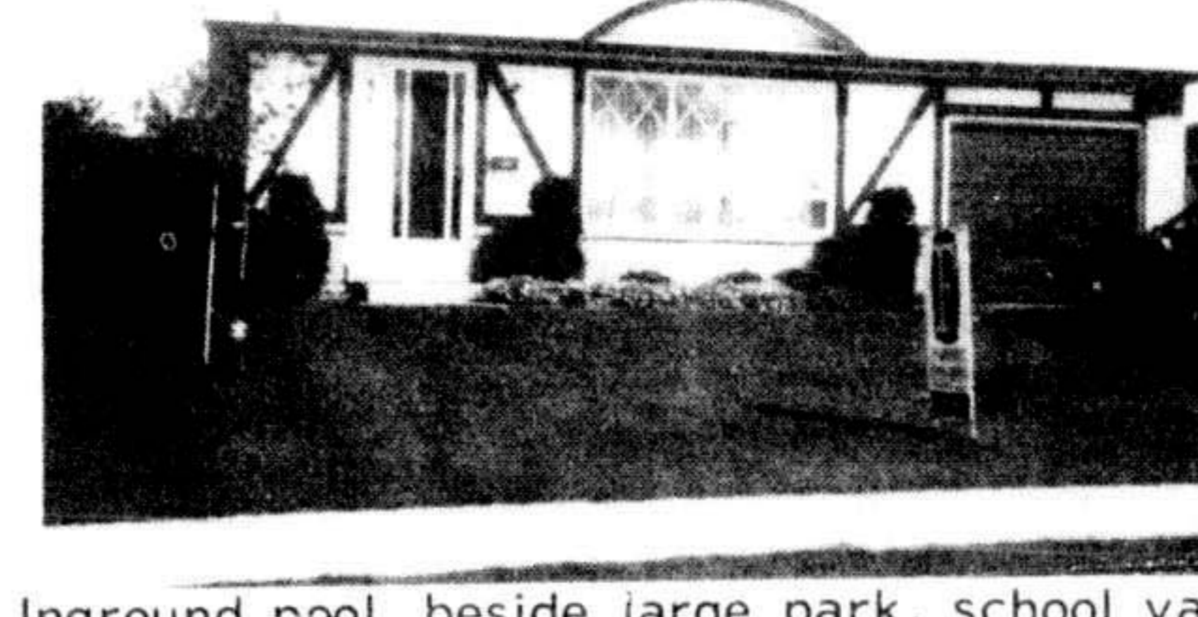
Inground pool, beside large park, school yard close by . . . $64,900