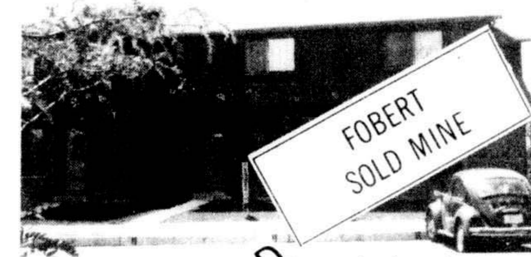
Town house, near shopping and shopping . . . $43,900