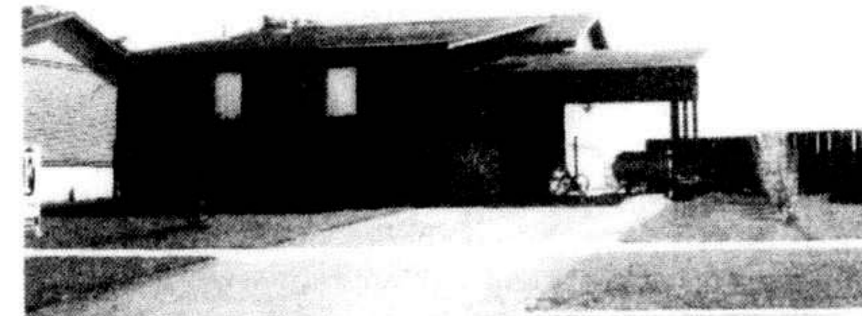
4 Level backsplit, walk to school through a park . . . $62,900