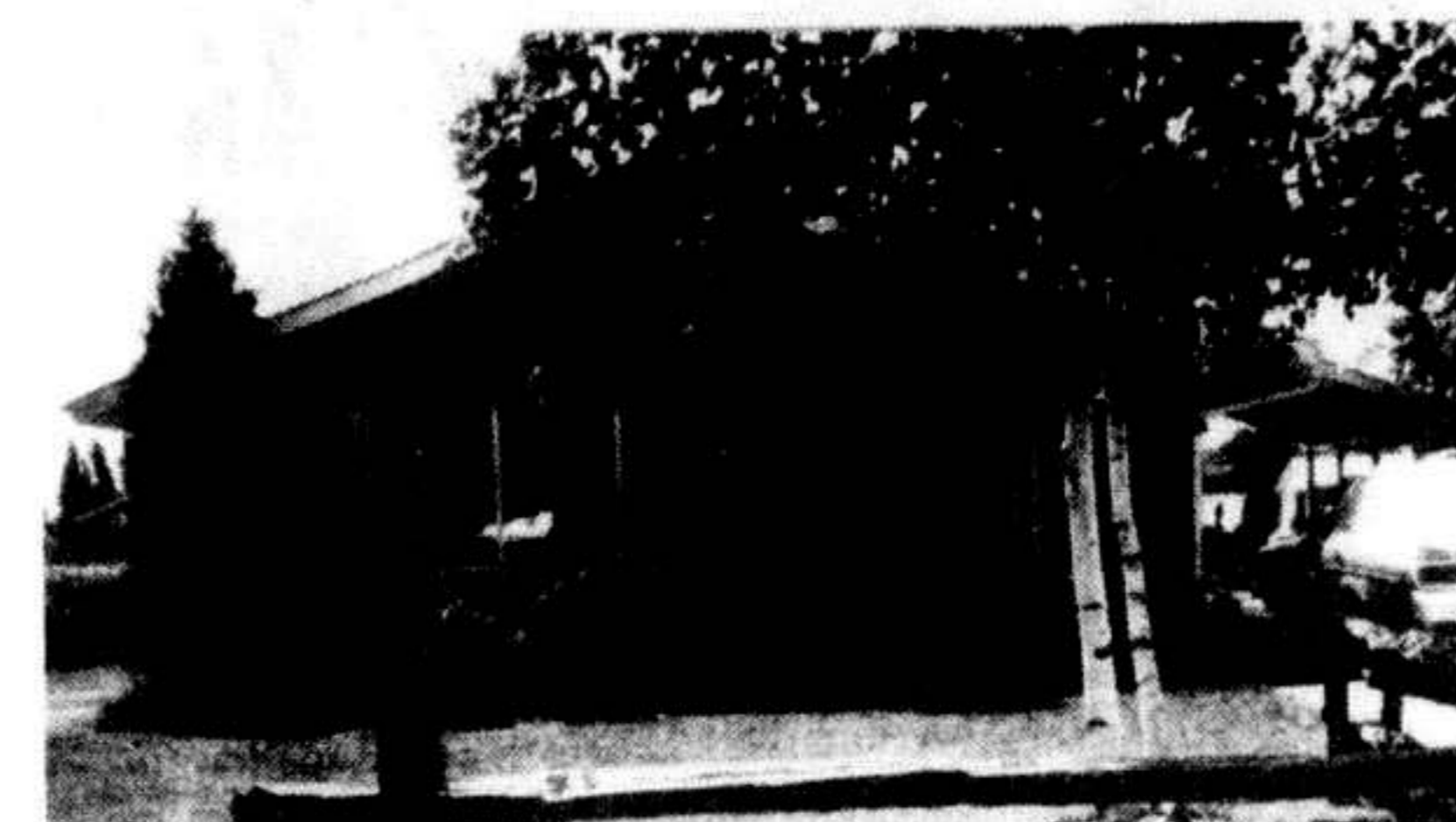
Mature trees, home in excellent condition . . . $59,500