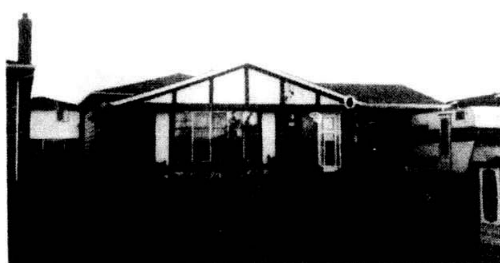
3 Bedroom backsplit, quiet crescent . . . $58,500