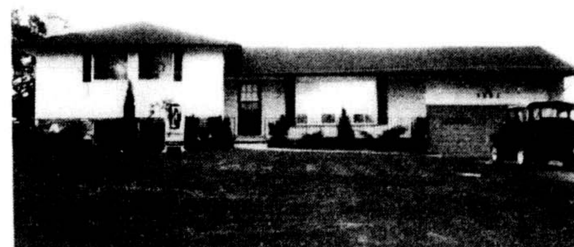
1/2 Acre, inground pool, family room, games room, fireplace . . . $87,900