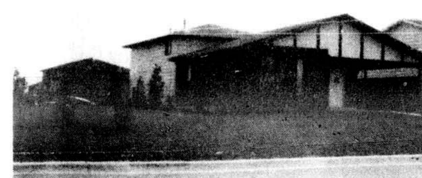
Backsplit, family room, in-ground pool . . . $69,900