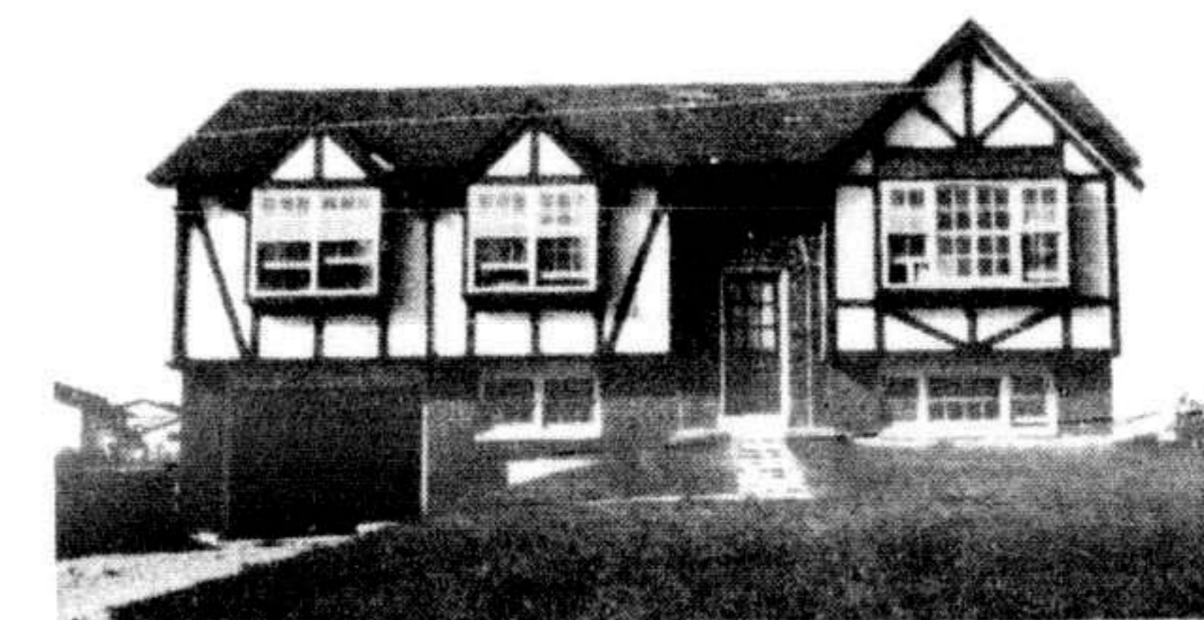
Tudor style 3 bedroom raised bungalow . . . $62,900