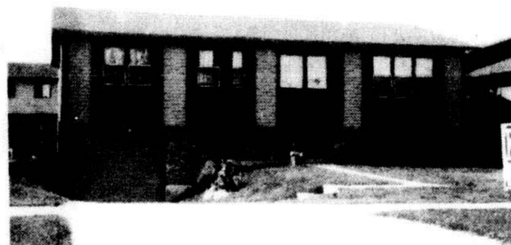
3 Bedroom raised bungalow . . . $59,500.

Just let us know what you're looking for and we've probably got it!!!!