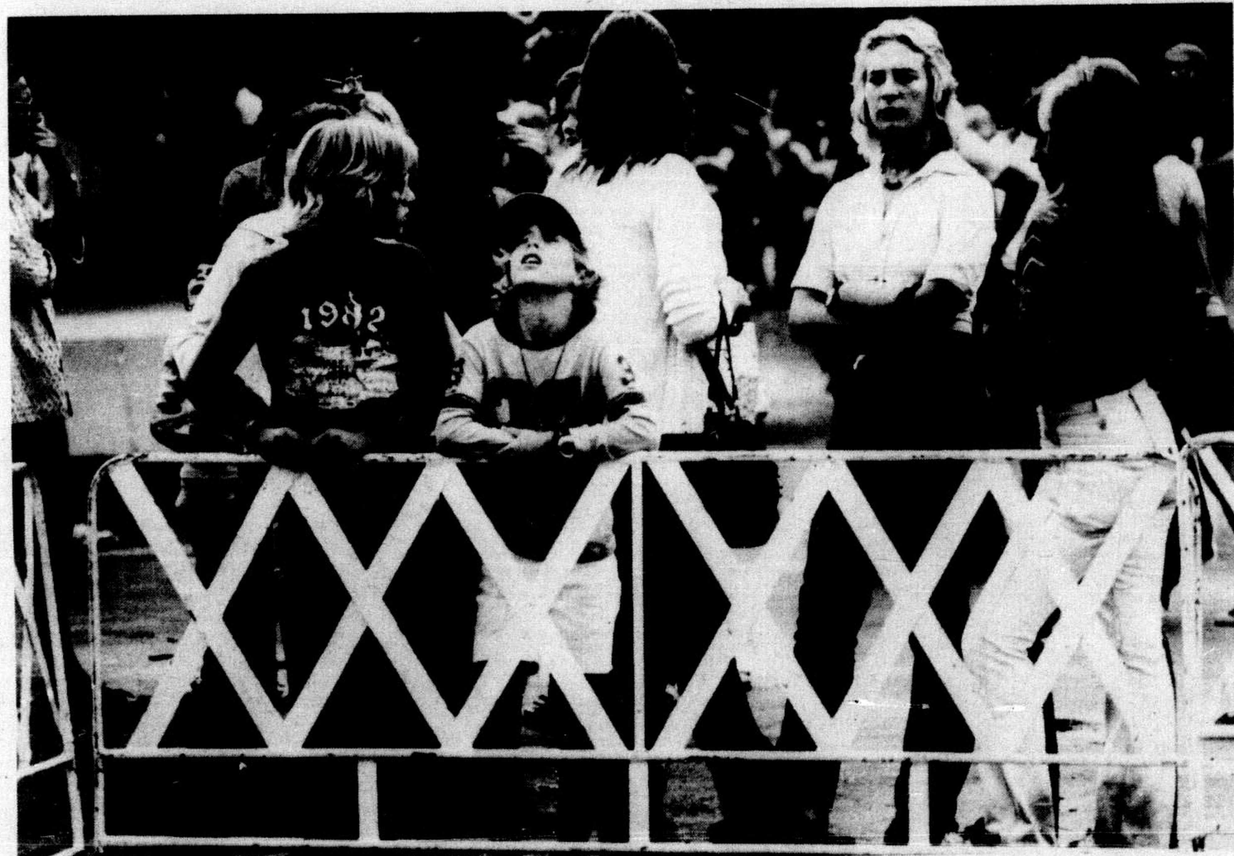
Those who would rather watch.