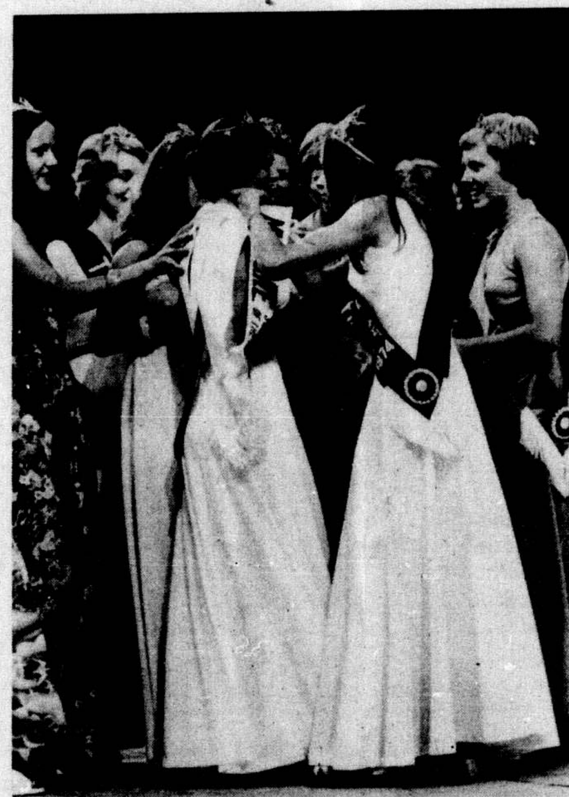
Having people make a fuss.