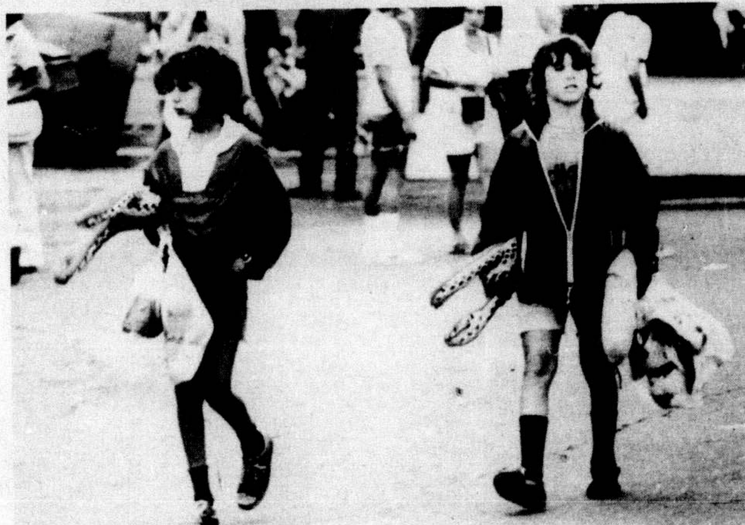
Searching for new adventures

What the opening day of The Canadian National Exhibition had to offer.