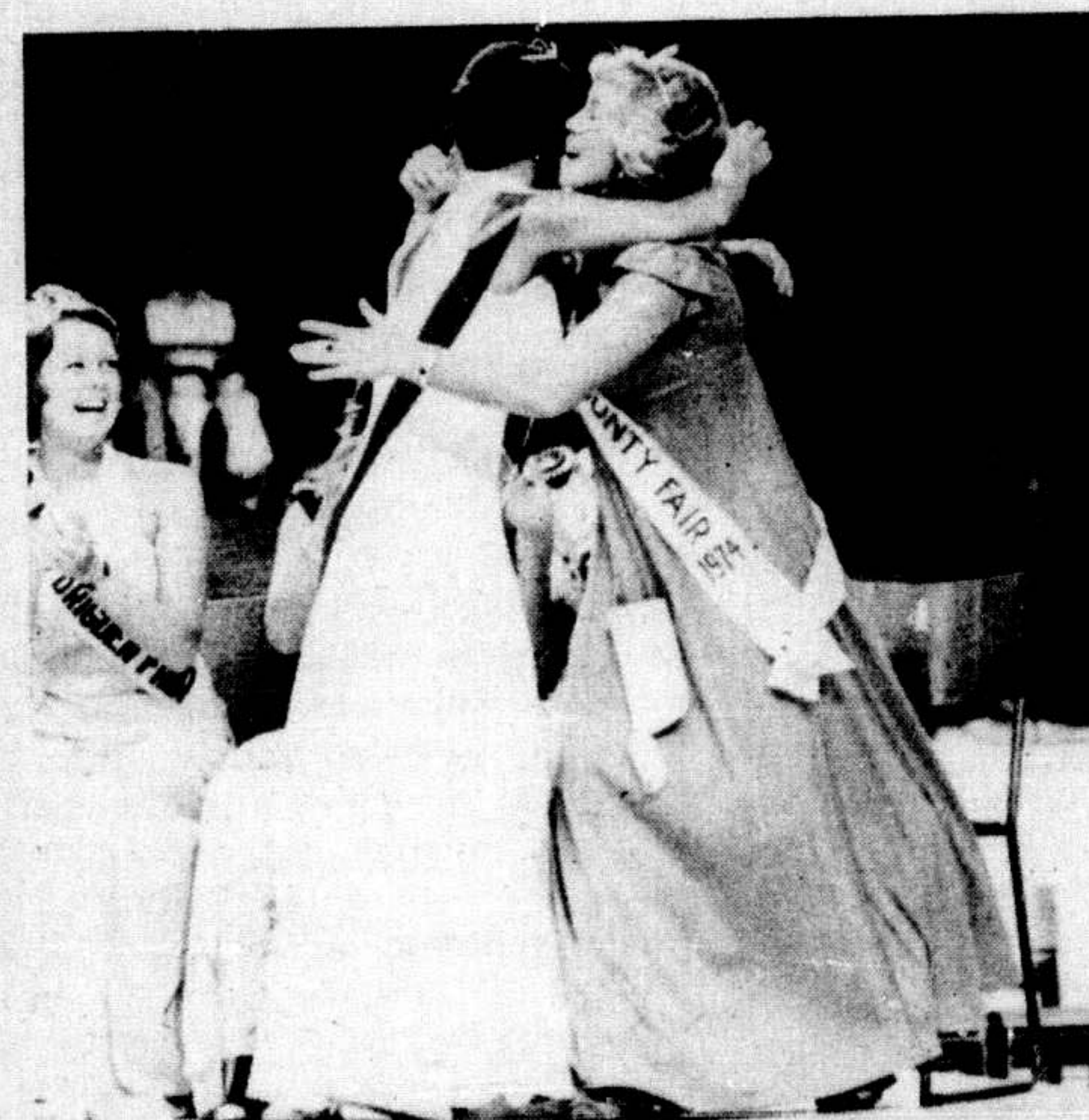
The excitement of winning Miss CNE