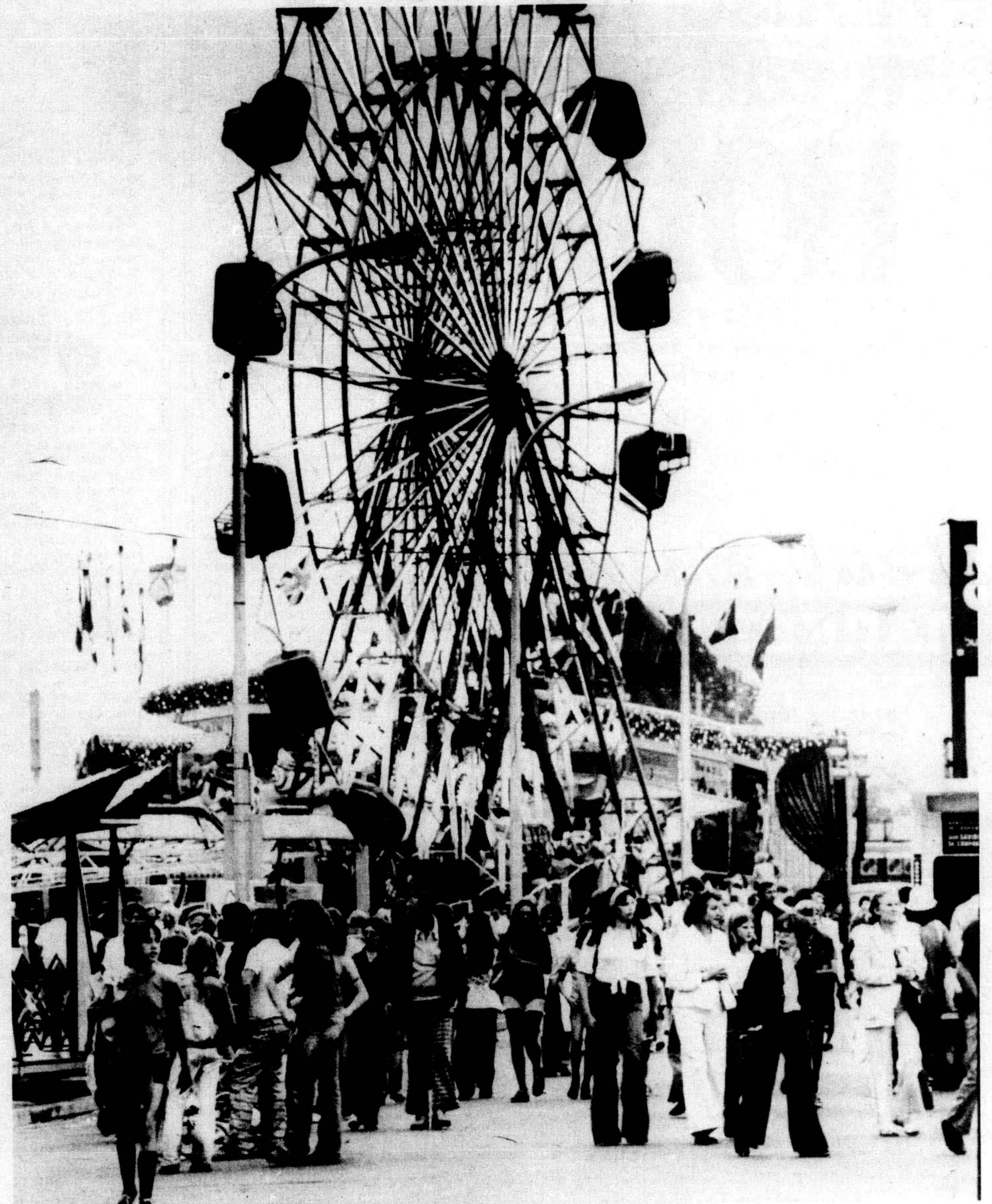
Seeing what the world of rides and games has to offer.