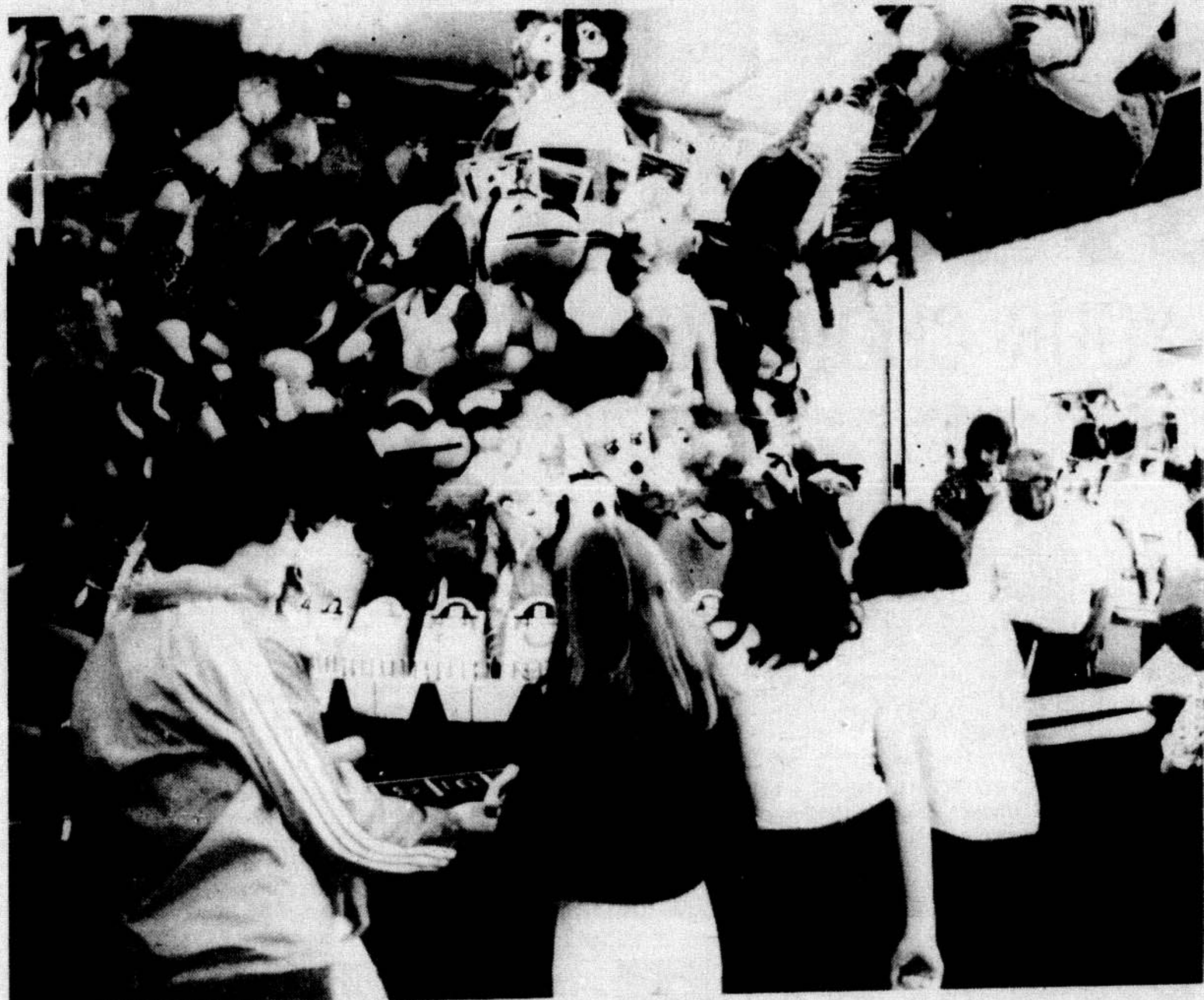
A stuffed friend won would provide comfort.