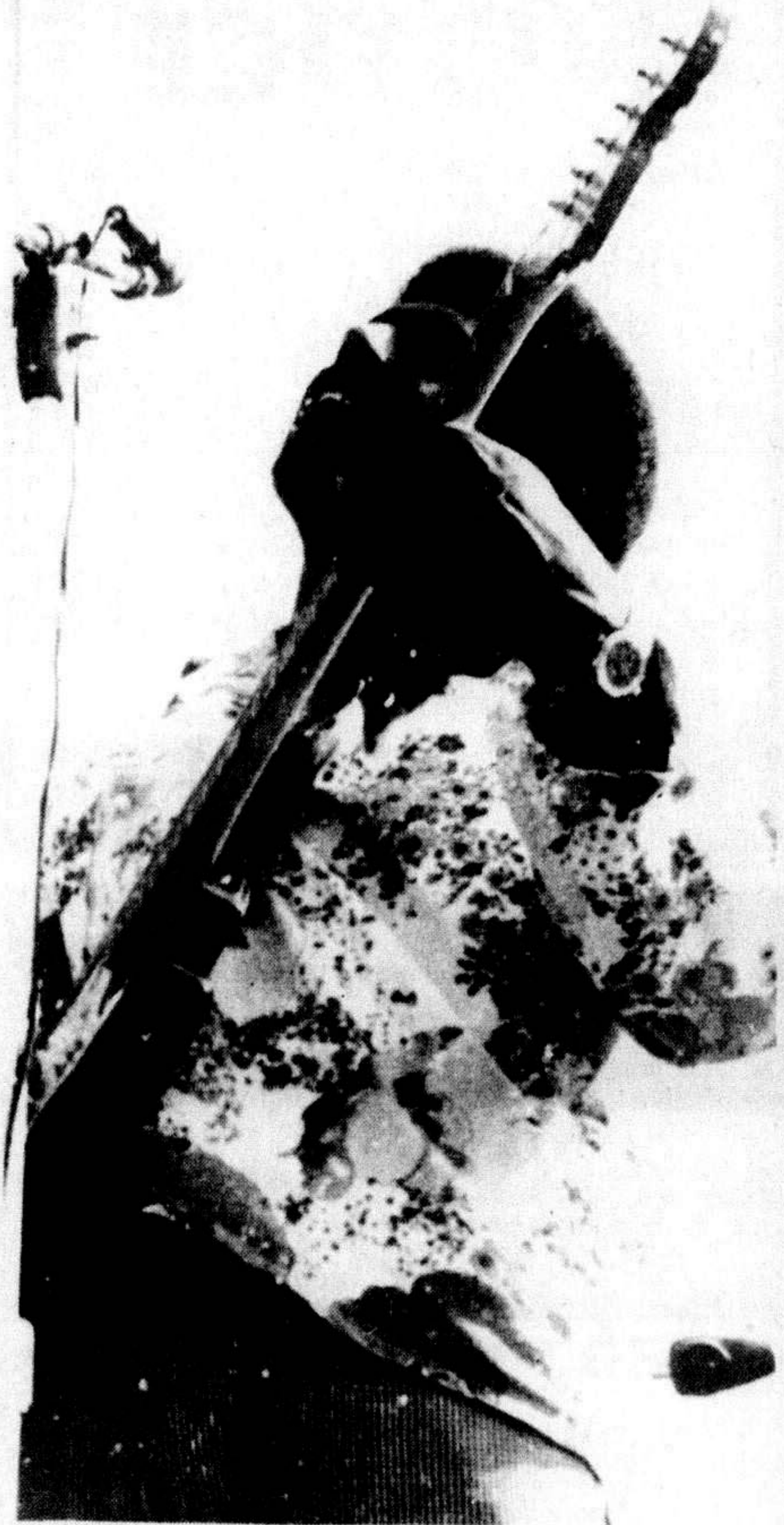
A CARIBBEAN BAND called Syncona entertained at the Halton Liberal picnic last weekend.