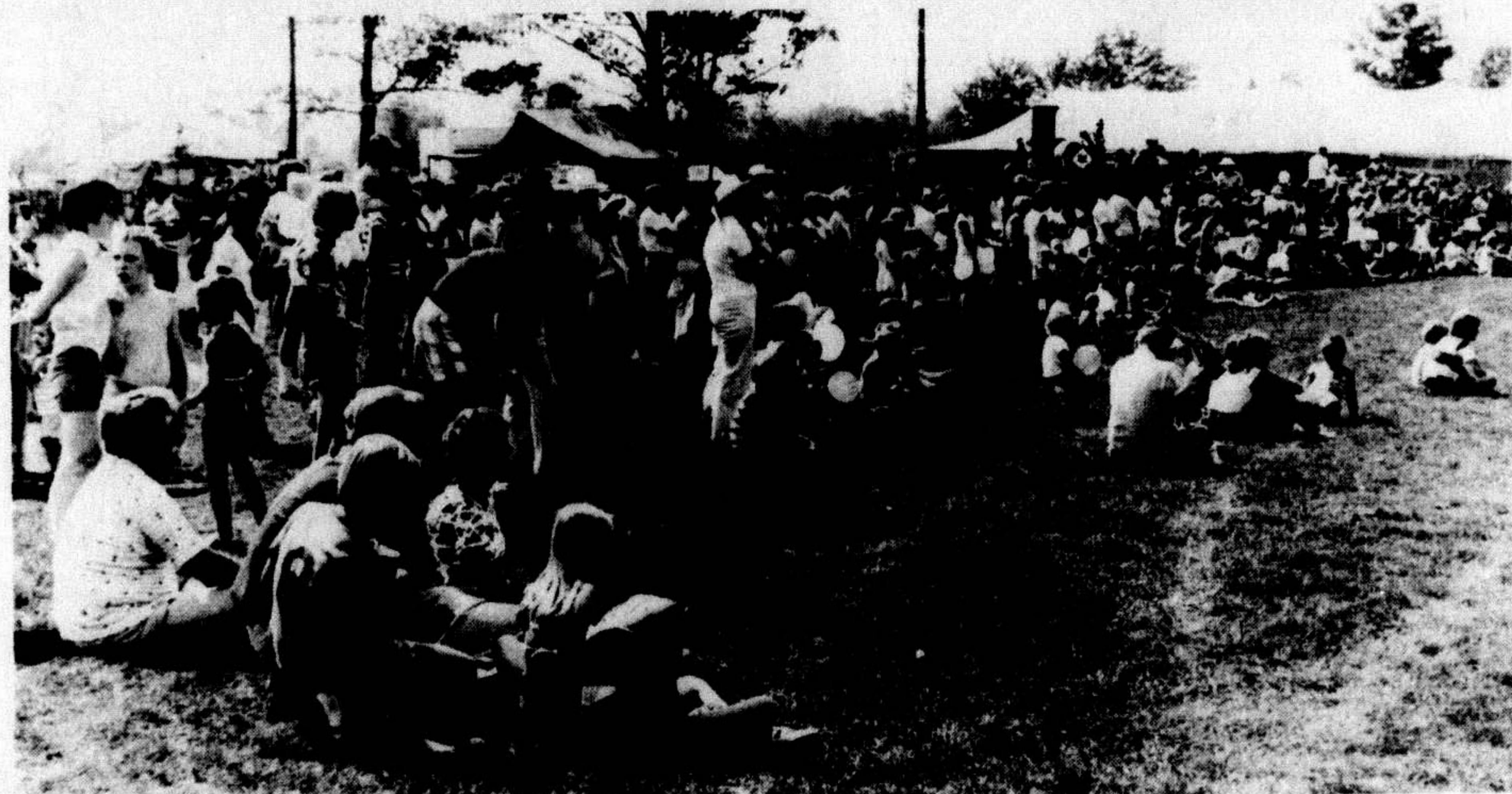
LARGE CROWDS at the Day in the Park watch as the Burlington Teen Tour Band performs. The band was heartily applauded.