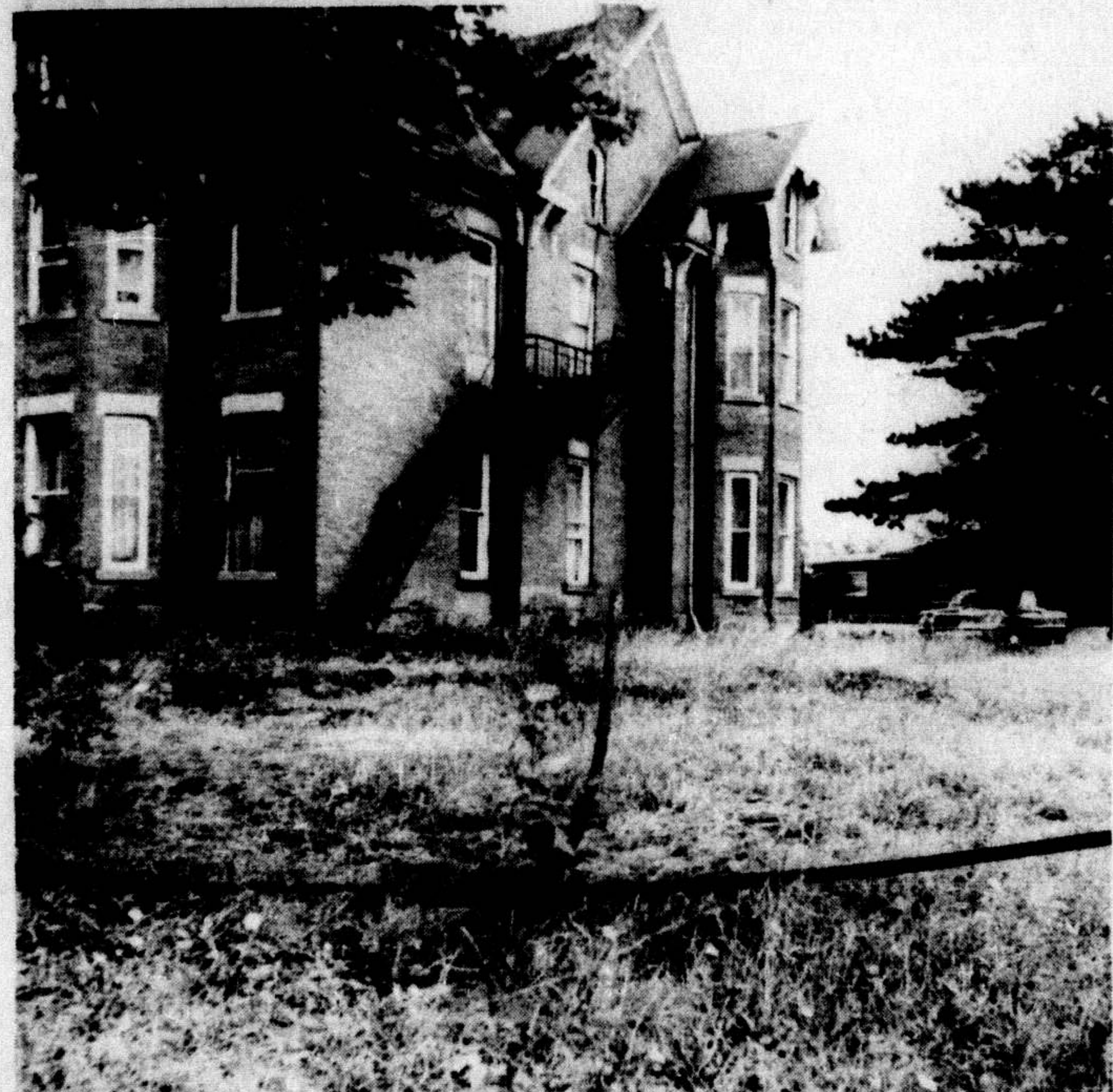
AN OLD HOUSE which has become run down since being divided into flats is to be razed for the modern-looking, three-storey building proposed for the Court-Main corner. It was once a Children's Aid home for orphans.

"That could be a blessing in disguise," the mayor said.