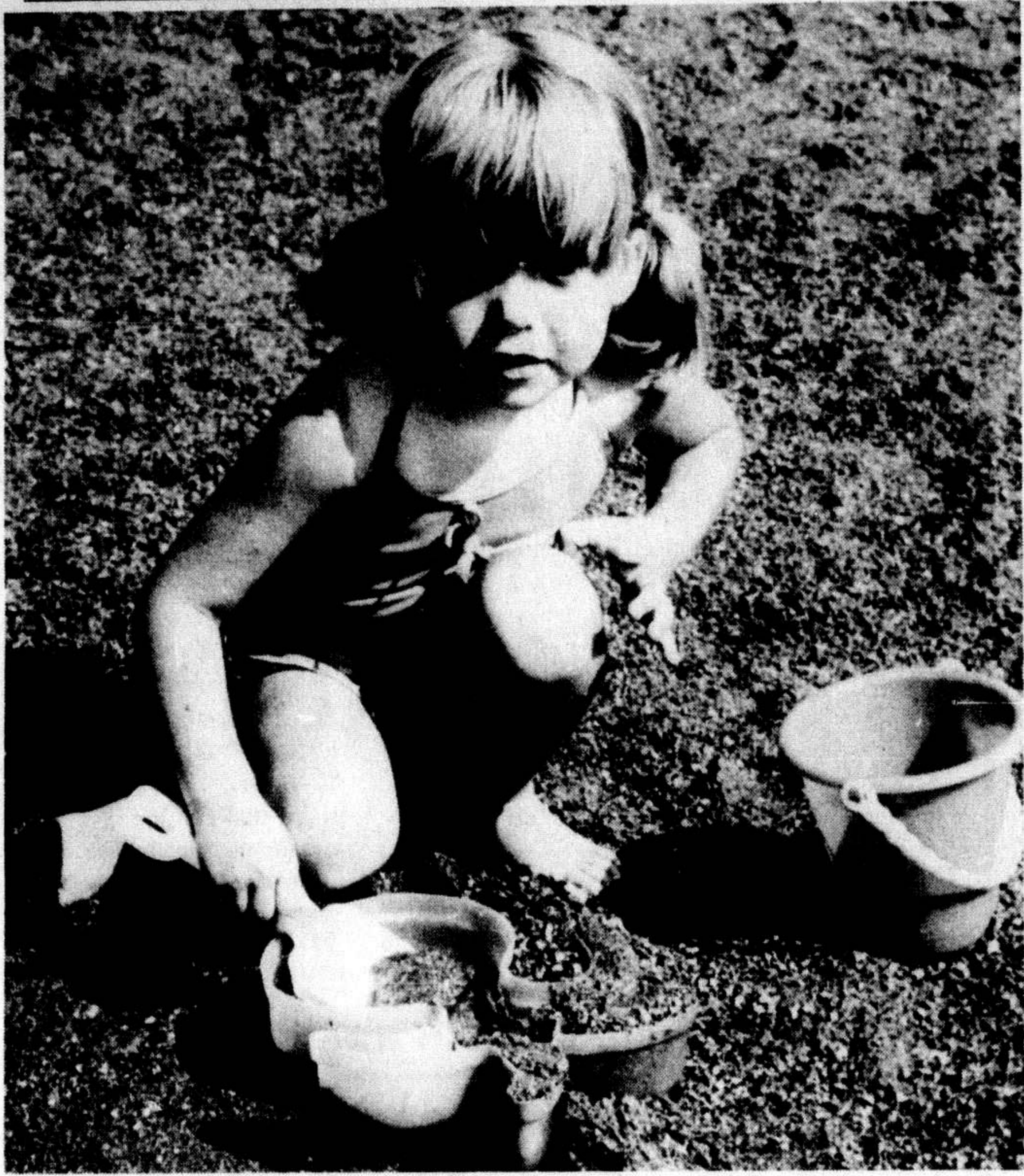
A YOUNG VISITOR enjoyed the sand more than the water on her visit last weekend to the beach at Kelso Conservation Area.