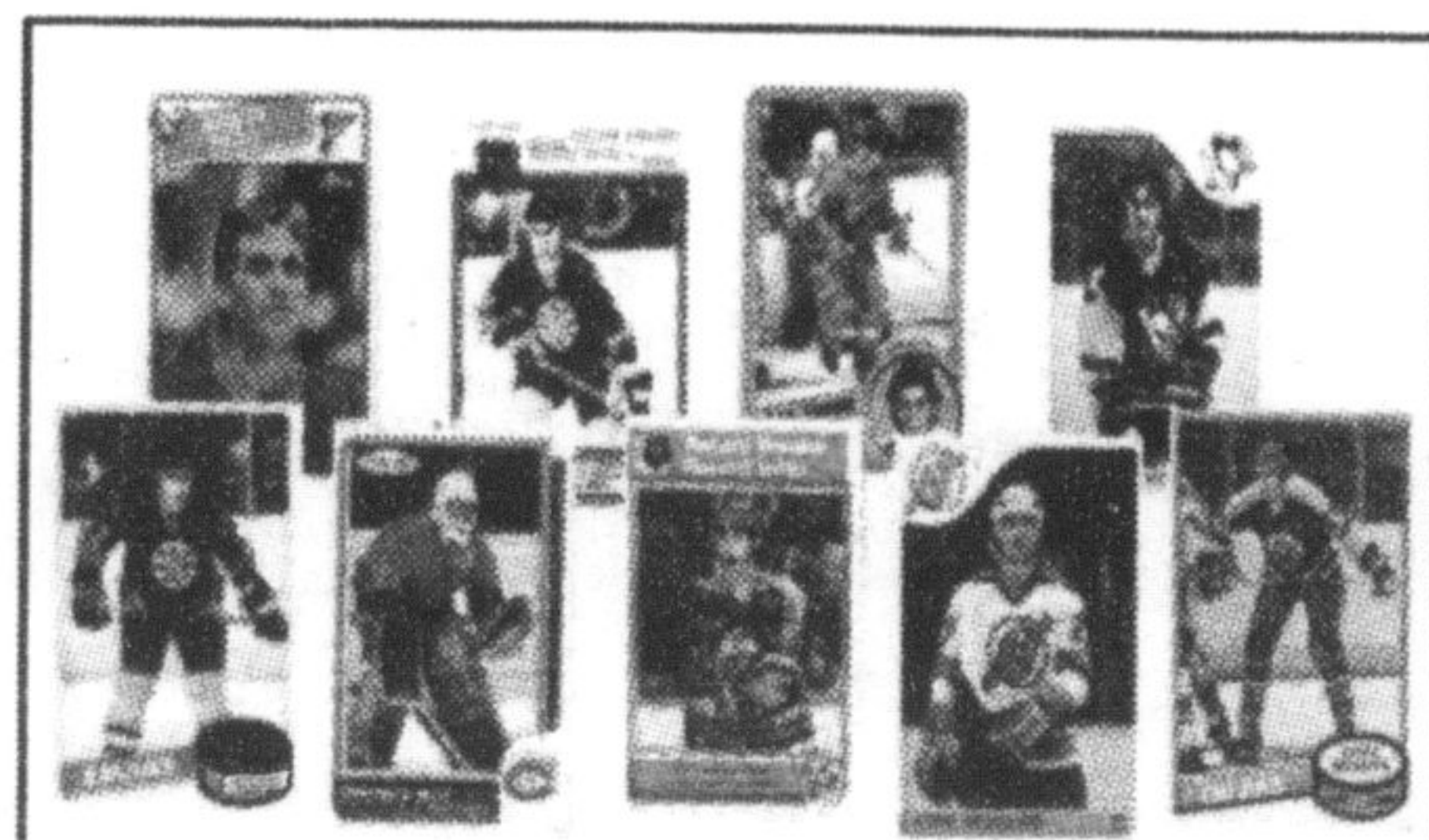
All sports memorabilia is in high demand including: Pre 1970's baseball cards; hockey cards, autographed baseballs, footballs & basketballs; jerseys; signed photos; etc...