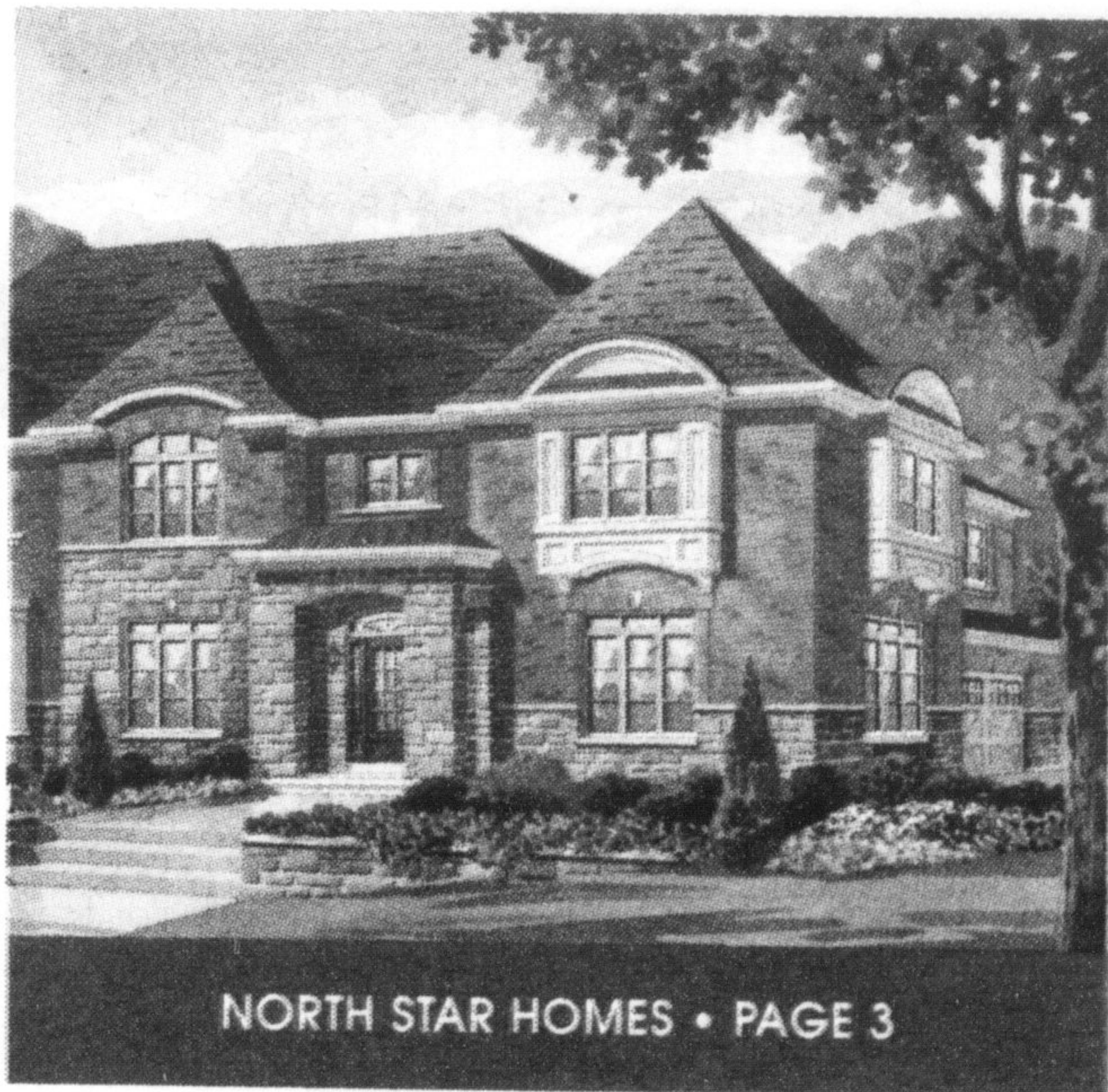
NORTH STAR HOMES • PAGE 3