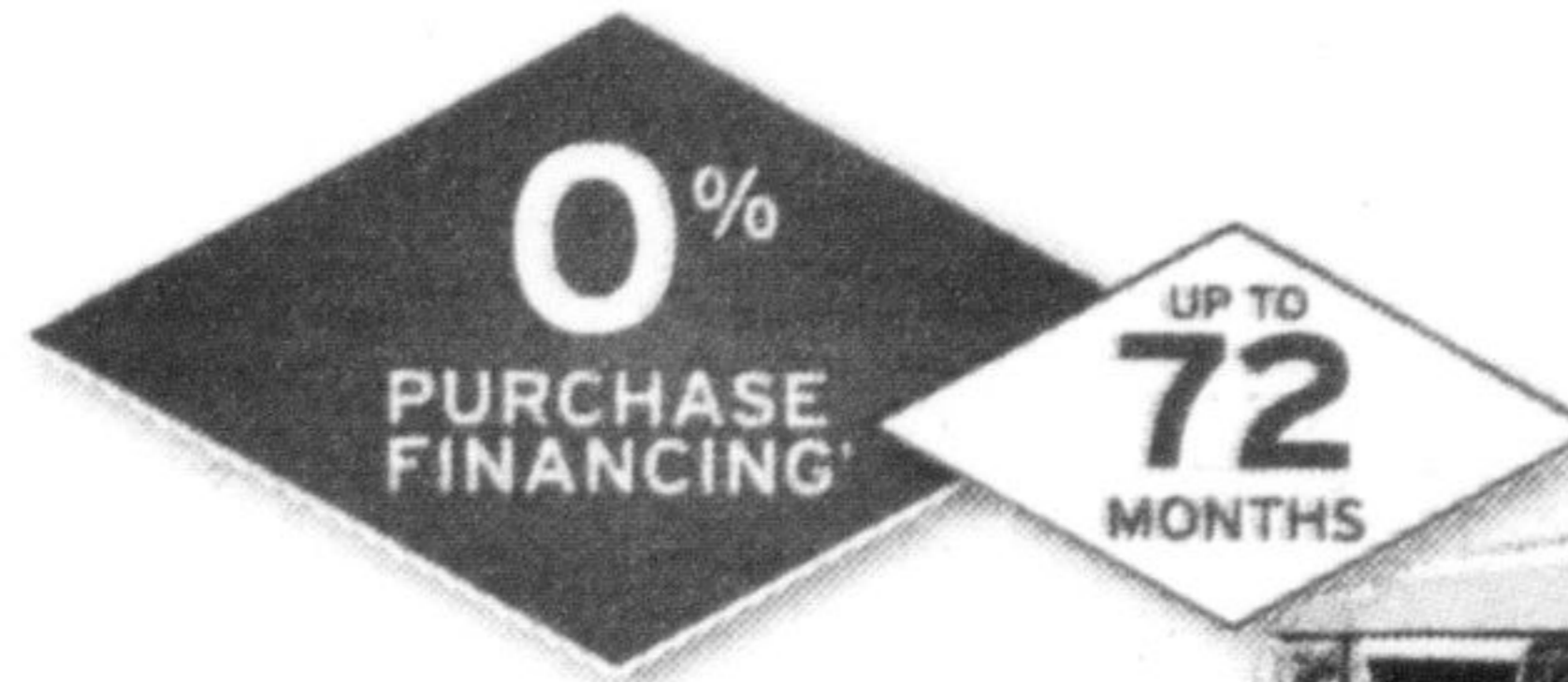
GT-V6 model shown