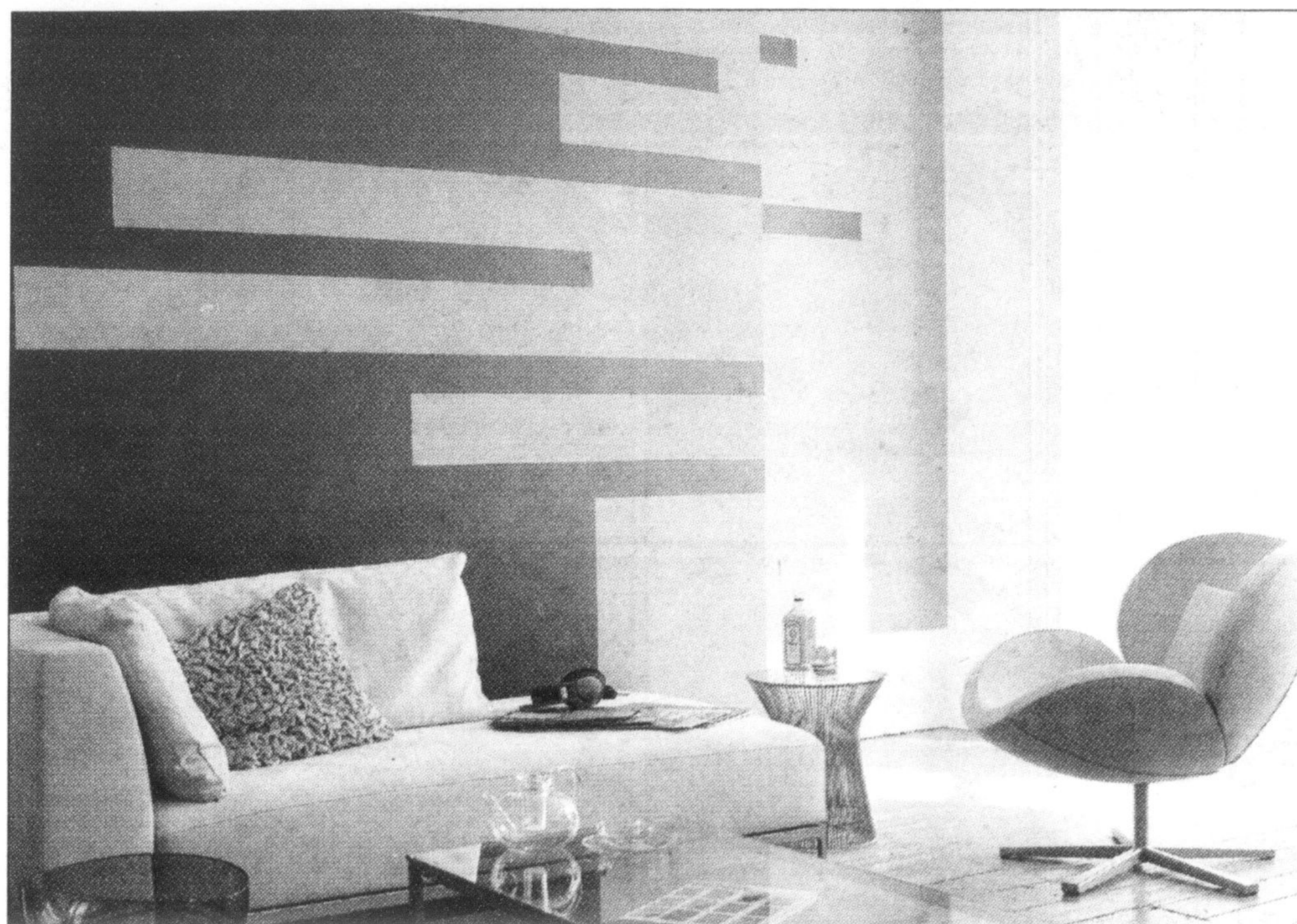
Above: Colour zoning spaces with Sico's Flamenco Red (6054-75) & Cotton Flower (6186-31)

It can also be a great way to help define an open space. For example, you could paint a zone of colour in the dining room area of a large space in a warm hue to create an instant feeling of cosiness. Other attractive applications for colour zoning include highlighting handsome moulding, drawing the eye to an architectural detail or creating an instant focal point through harmonious colours or