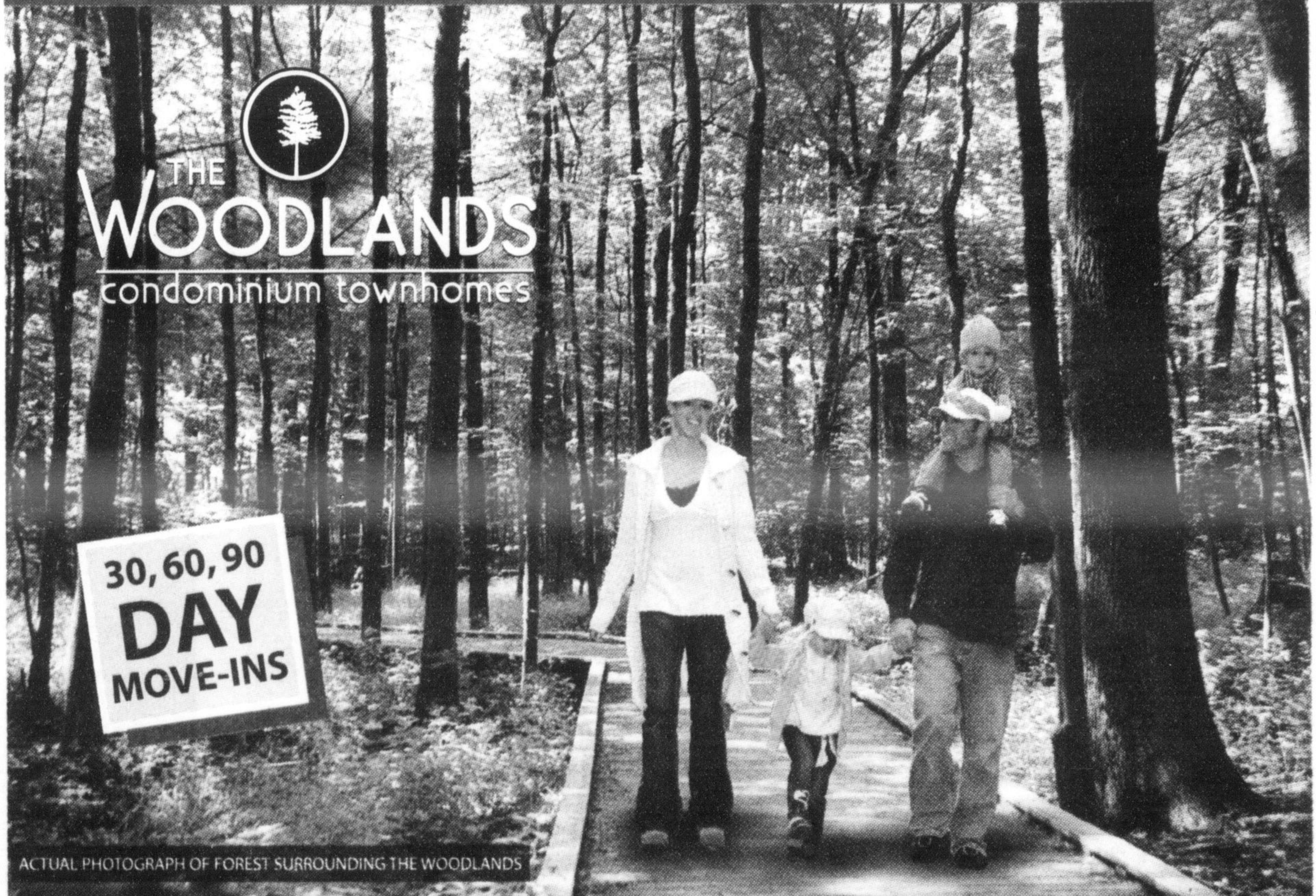
ACTUAL PHOTOGRAPH OF FOREST SURROUNDING THE WOODLANDS