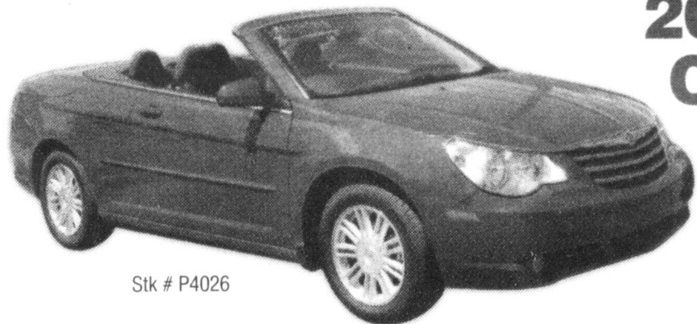
Stk # P4026