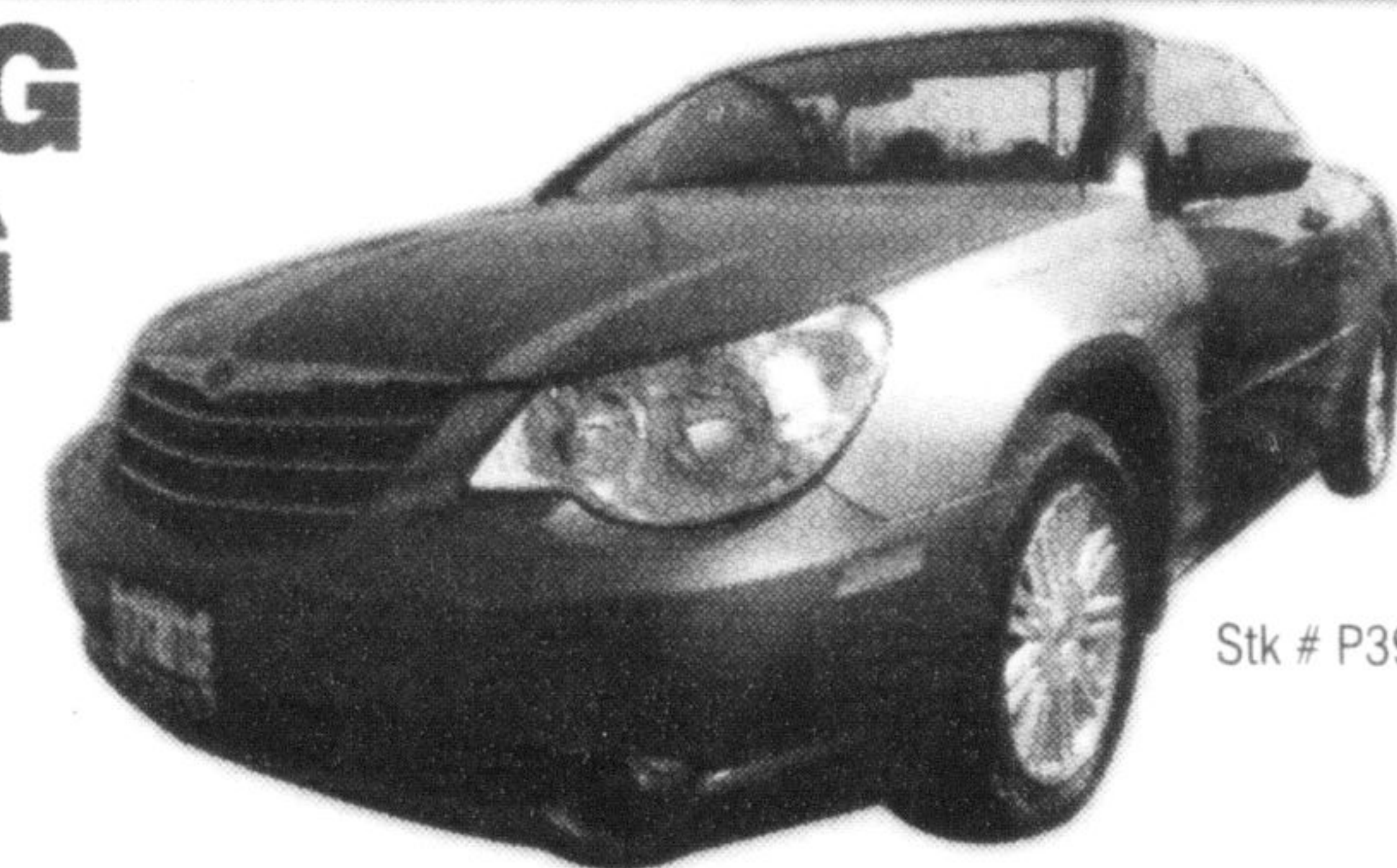
Stk # P3974