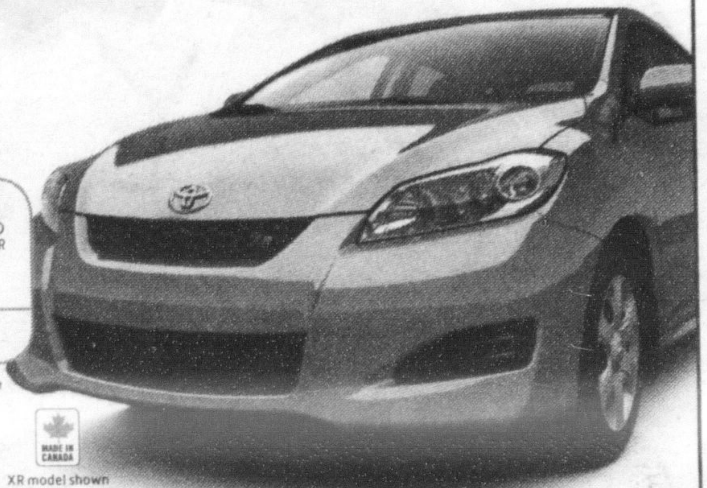
XR model shown