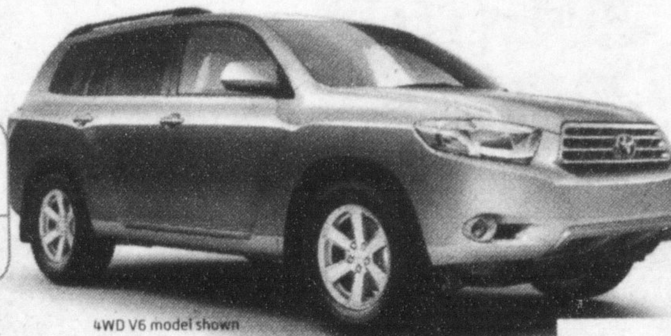
4WD V6 model shown