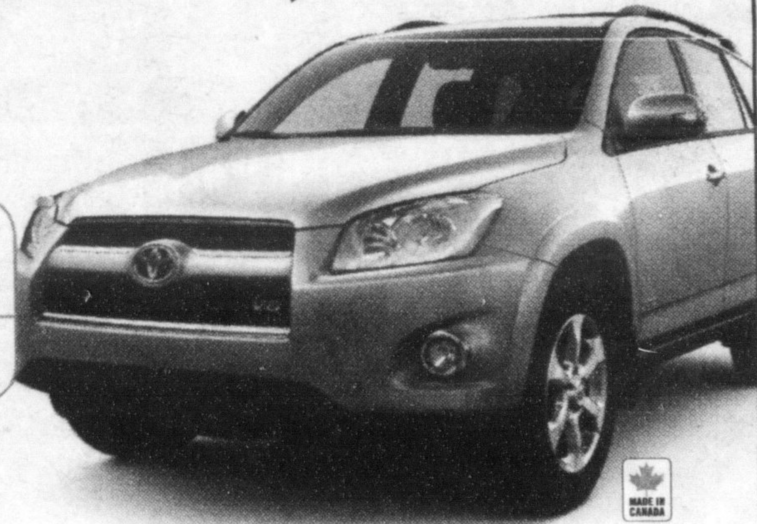
V6 limited model shown

CURRENT TOYOTA OWNERS RECEIVE $500-$1,000 WITH THE TOYOTA LOYALTY PROGRAM.*