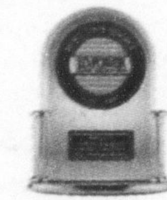
"MOST DEPENDABLE VAN IN THE US FOR 2009"

Our Payment Includes All Fees. Only PST, GST, Lic. & Gas Charge Extra.