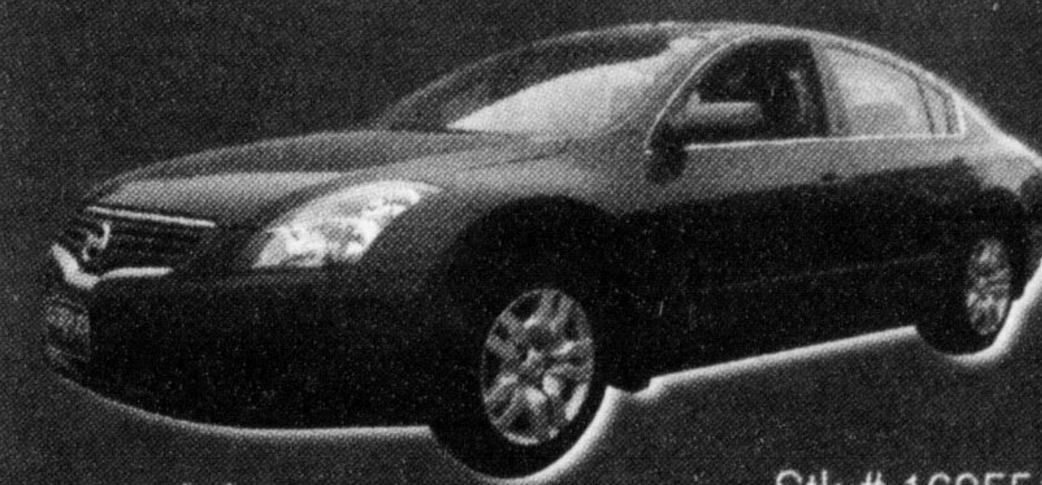
2009 Nissan Altima 2.5 S