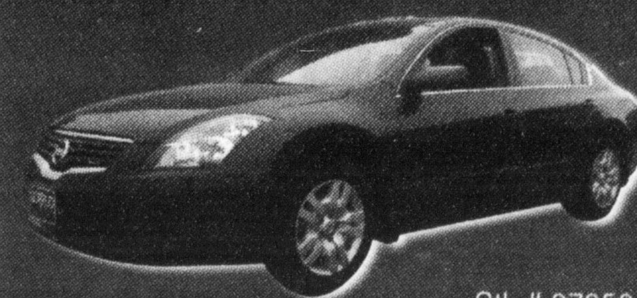
2005 Nissan Maxima 3.5 SE