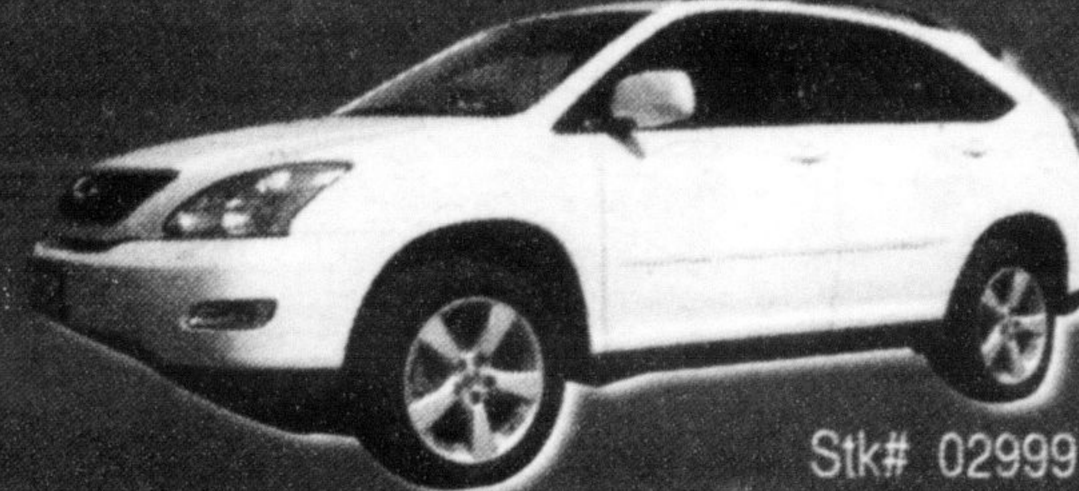
2007 Lexus RX 350