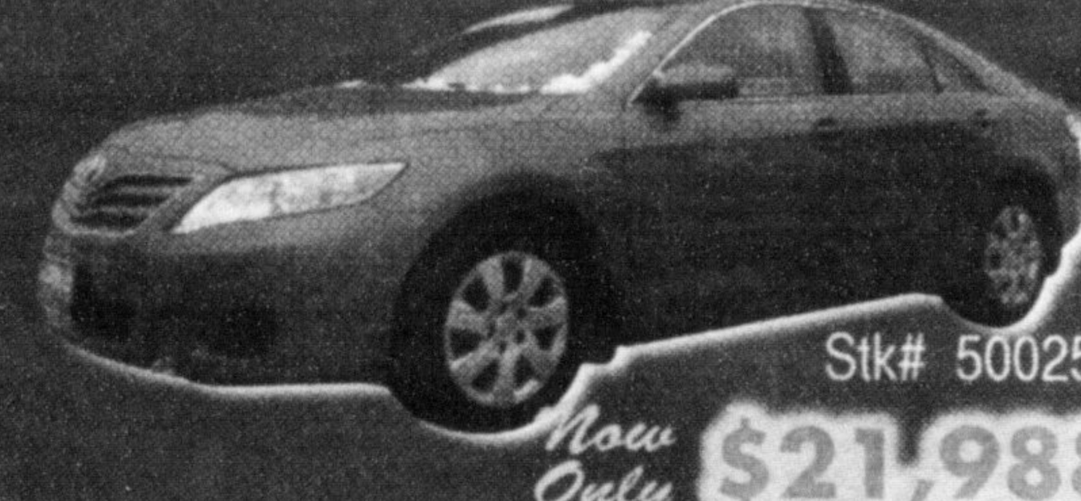
2010 Toyota Camry LE