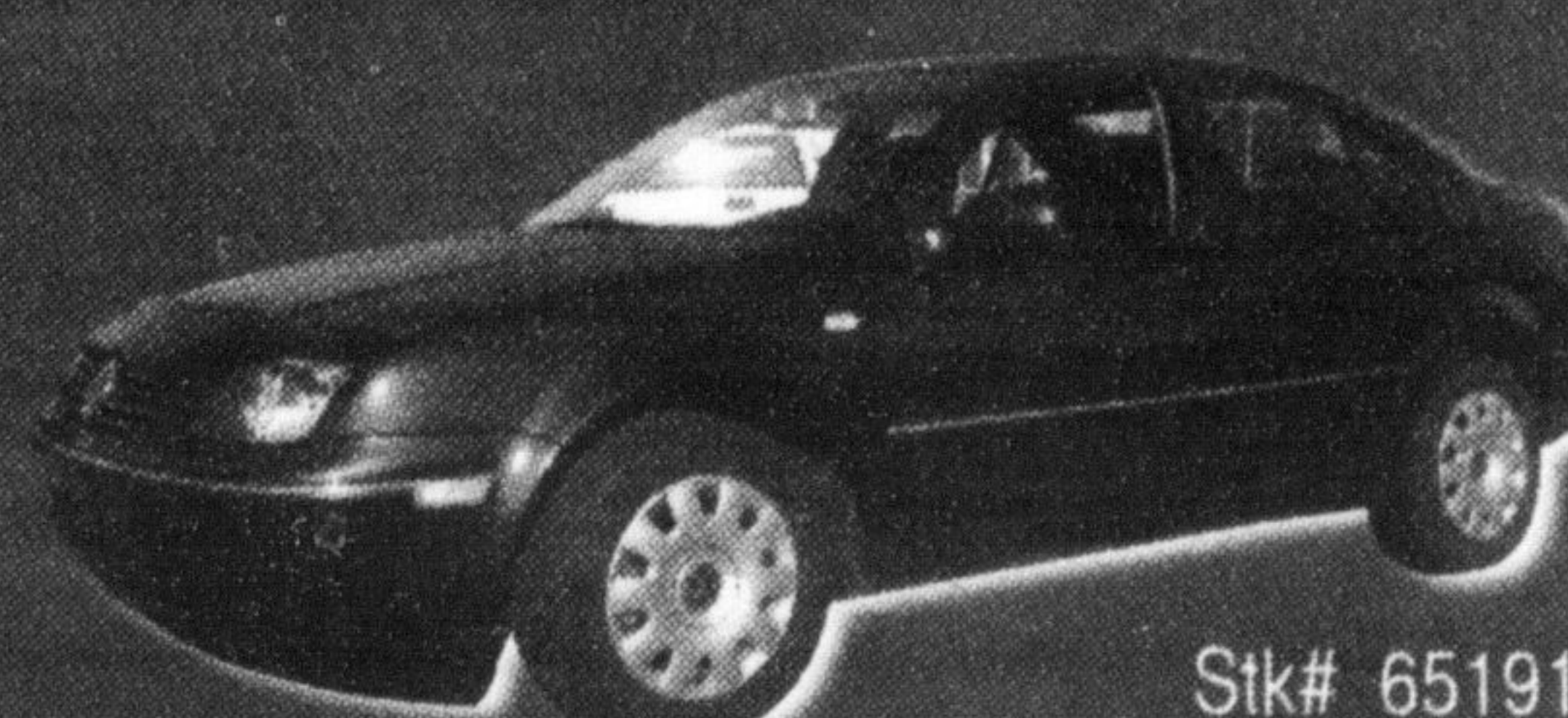
2007 VW Jetta City 2.0