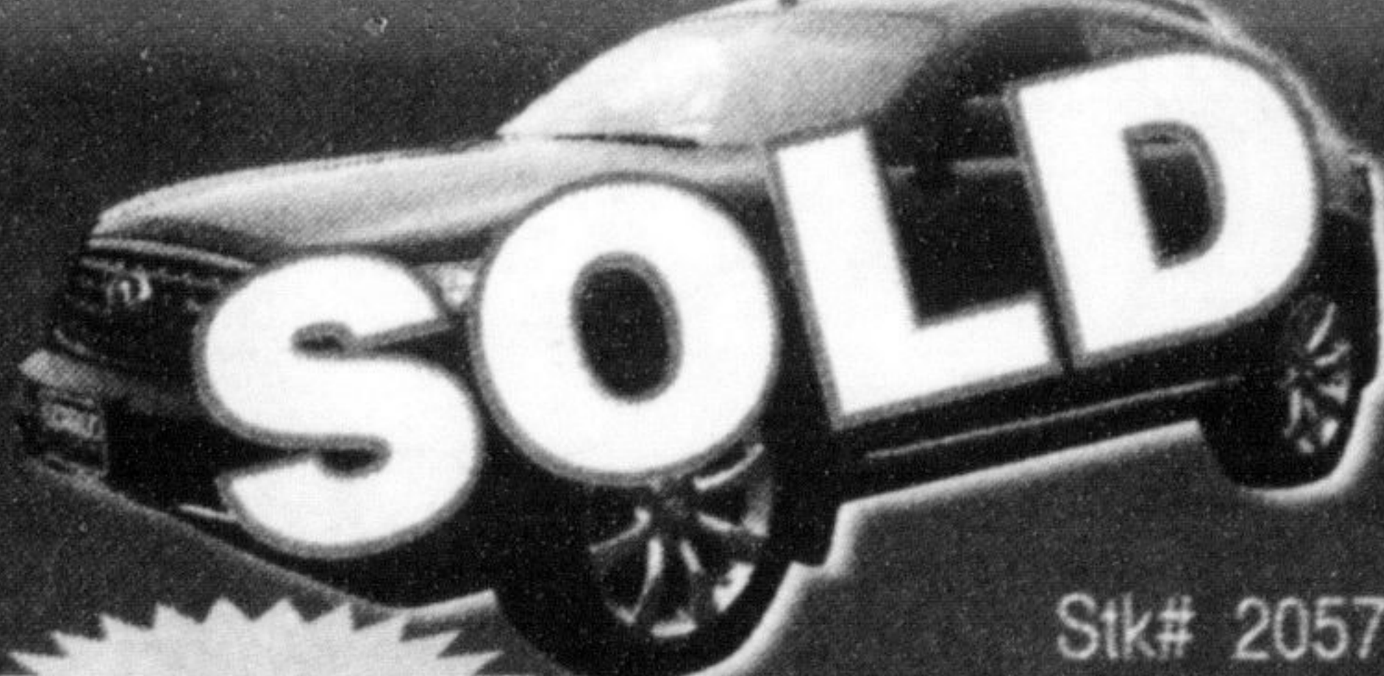
2007 Infiniti Ex35