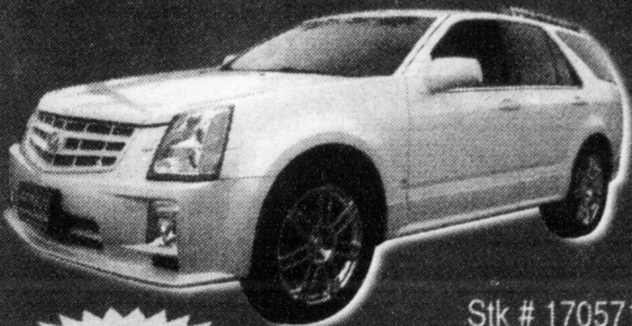
2007 Cadillac SRX