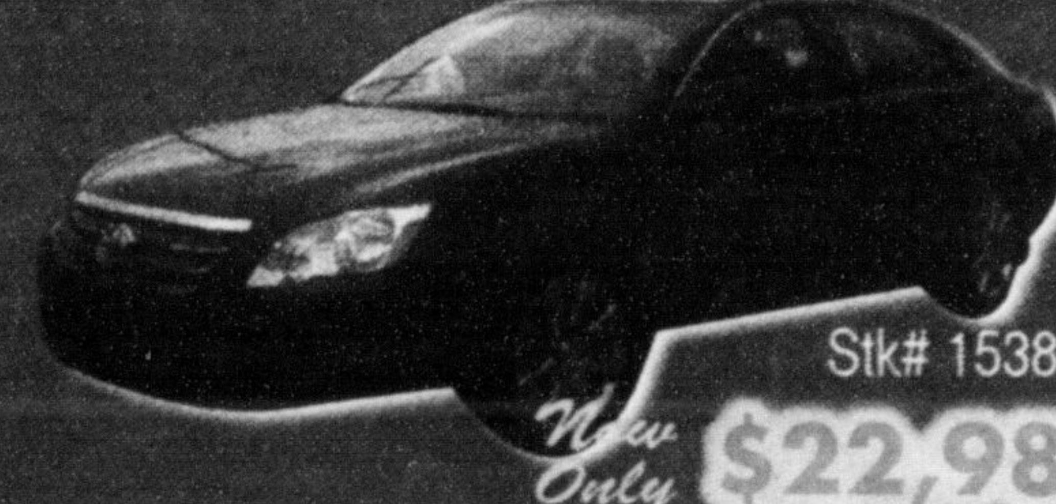
2006 Toyota Avalon XLS