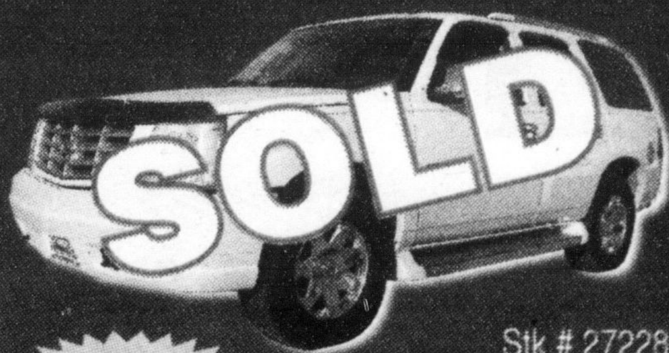
2005 Cadillac Escalade

NO HASSLE, NO HAGGLE PRICING OVER 200 VEHICLES ON SALE!