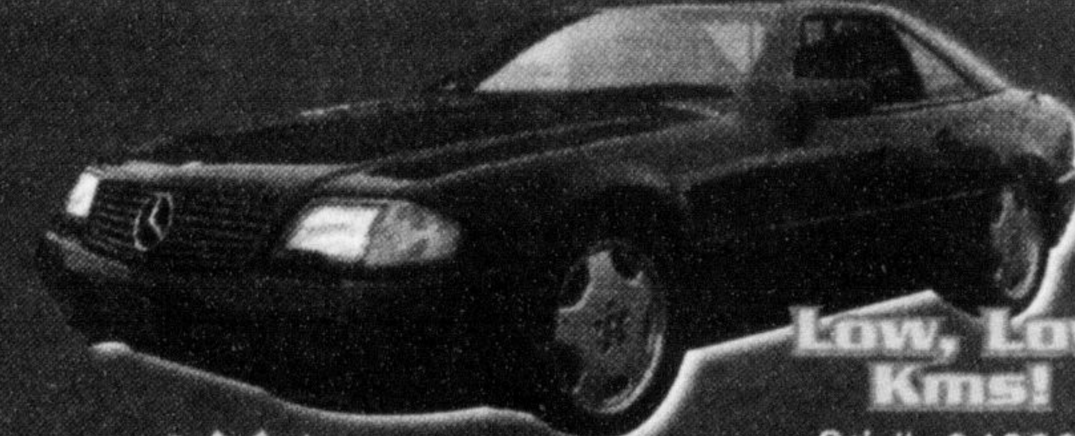
1992 Mercedes-Benz 500 SL