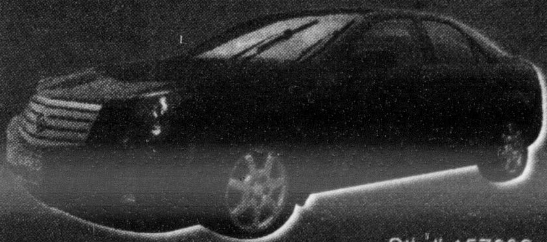
2006 Cadillac CTS