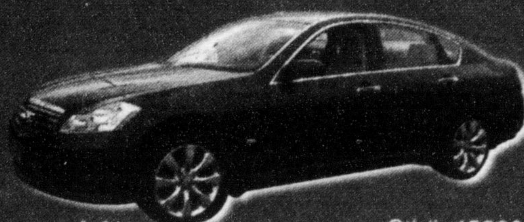
2007 Infiniti MX35