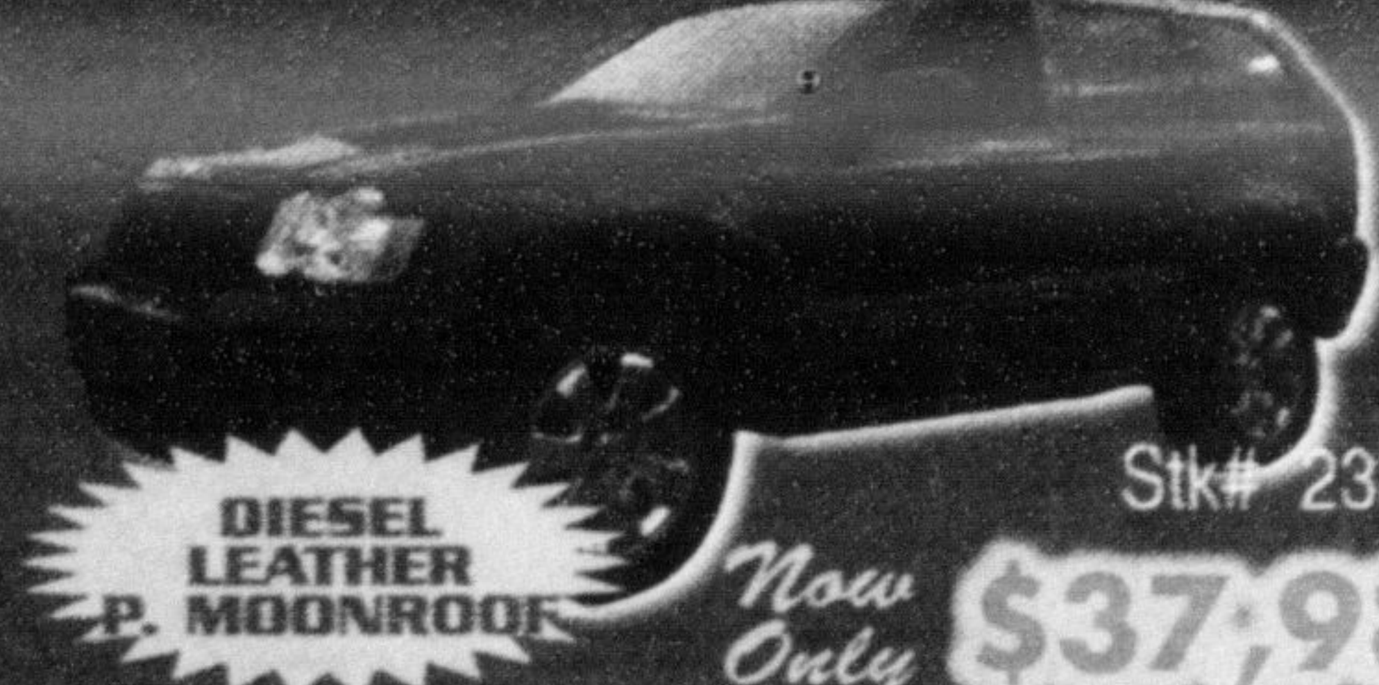
2008 Jeep Grand Cherokee LAREDO