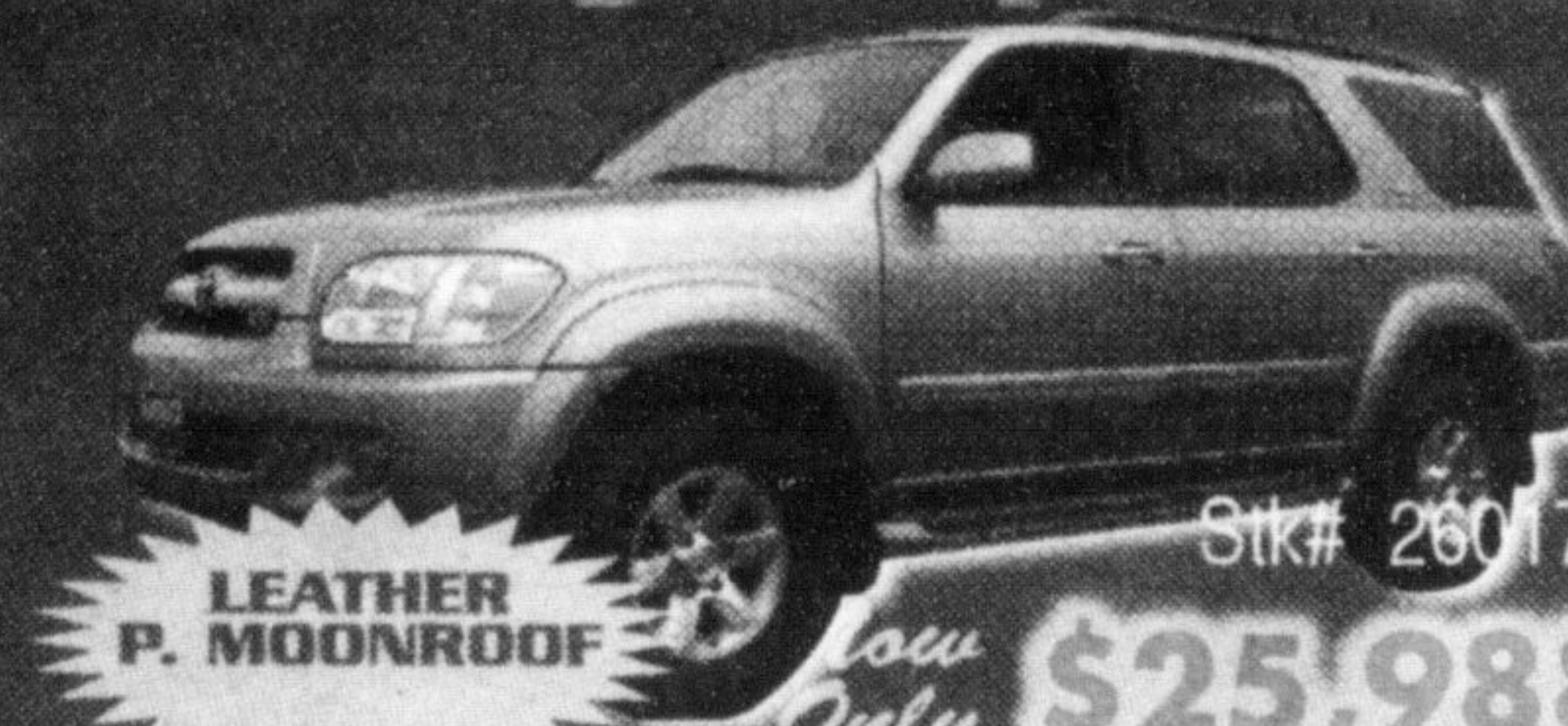
2006 Toyota Sequoia SR5