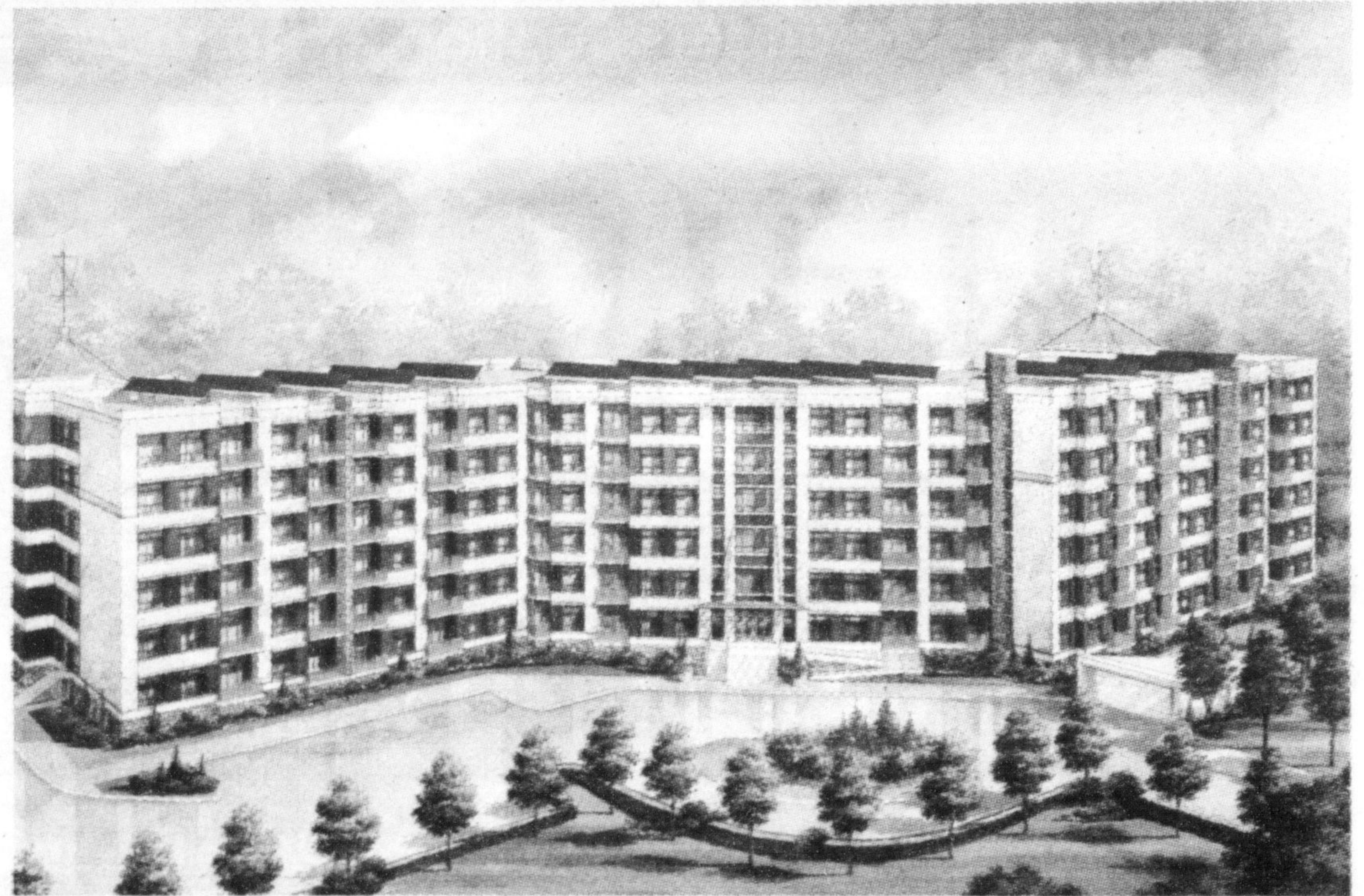
GreenLife will be a six storey building with approximately 160 units starting from $189,900.

GreenLife will be a six storey building with approximately 160 units starting from $189,900 for a 1 bedroom plus den and unit sizes go up to 1350 square foot a 3 bedroom suite. Even the location was chosen with sustainability measures in mind. The site, located in downtown Milton, is within walking distance of all