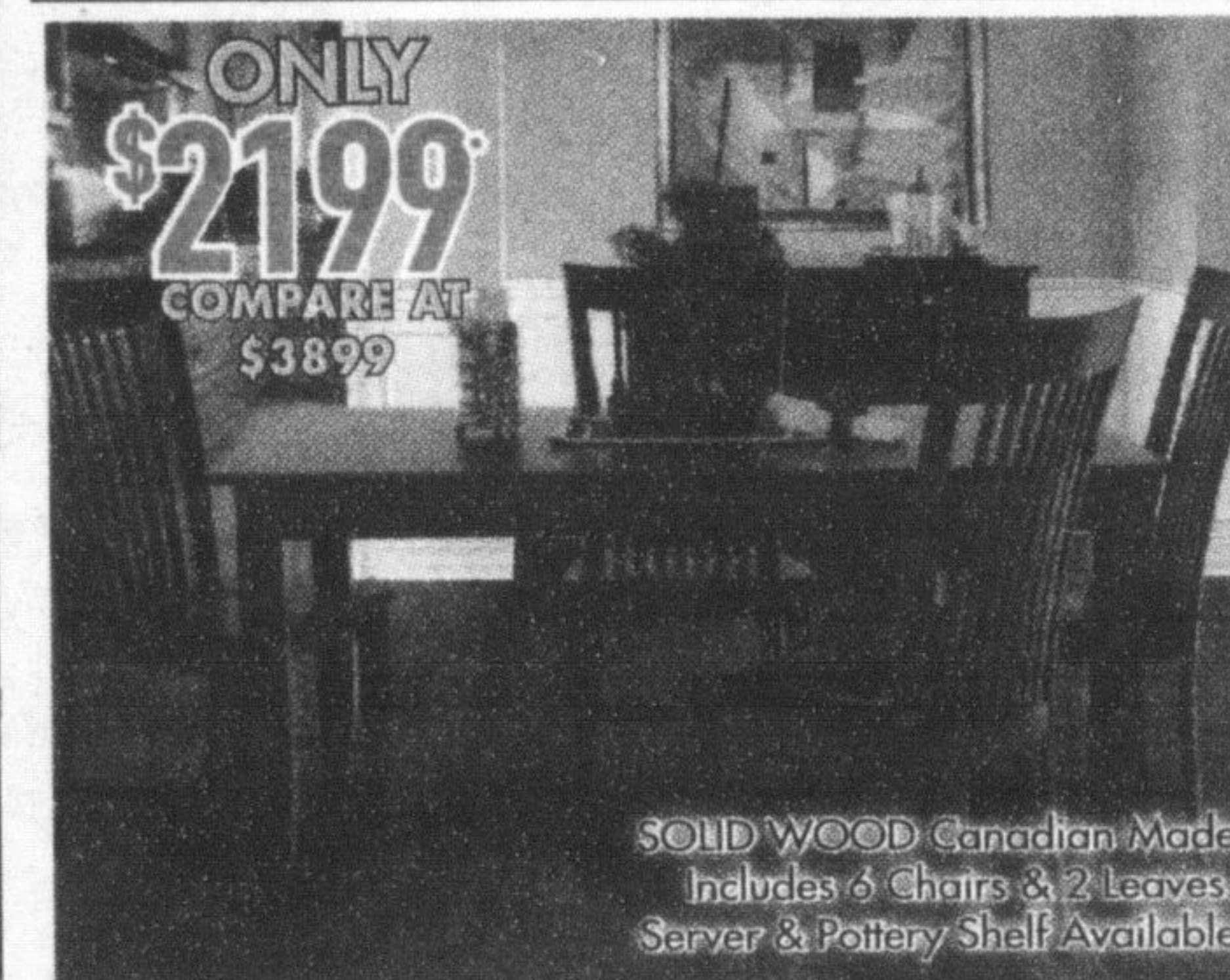
ONLY $2199 COMPARE AT $3899 SOLID WOOD Canadian Made Includes 6 Chairs & 2 Leaves. Server & Pottery Shelf Available