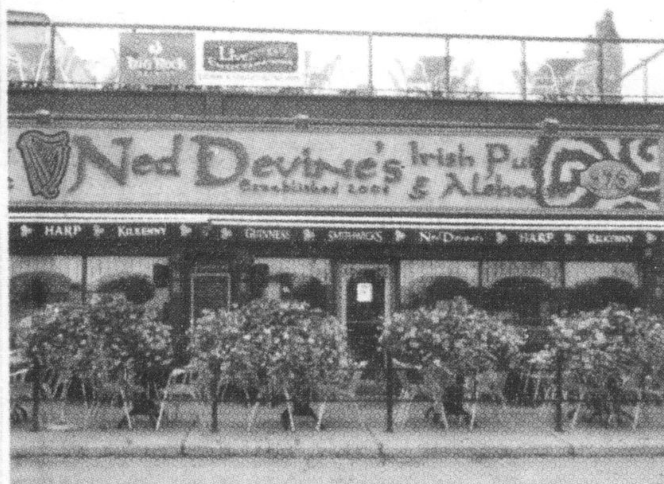
Ned Devine's Irish Pub and Ale House.