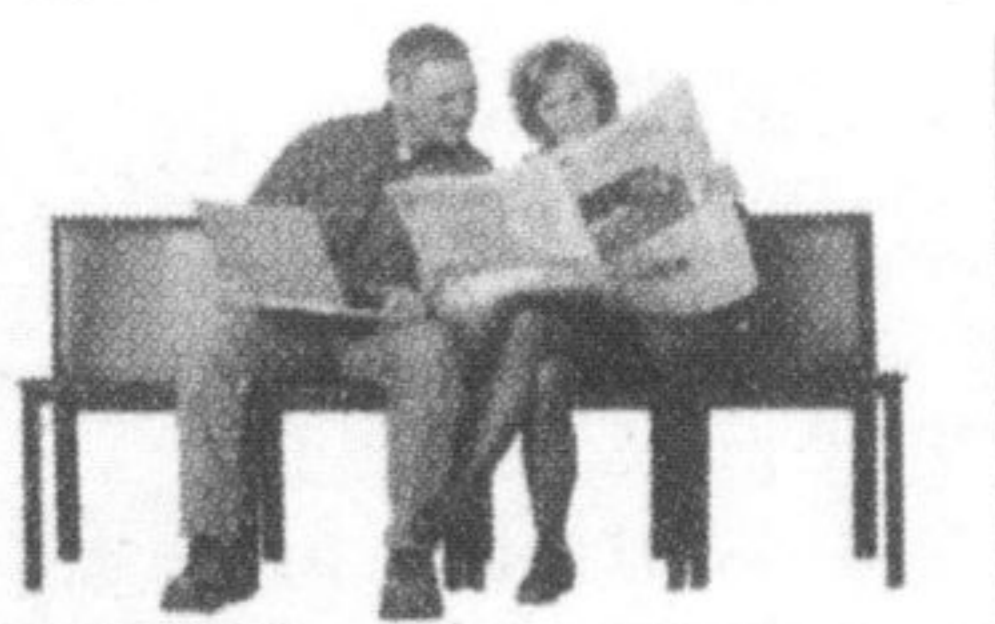
For One and All...