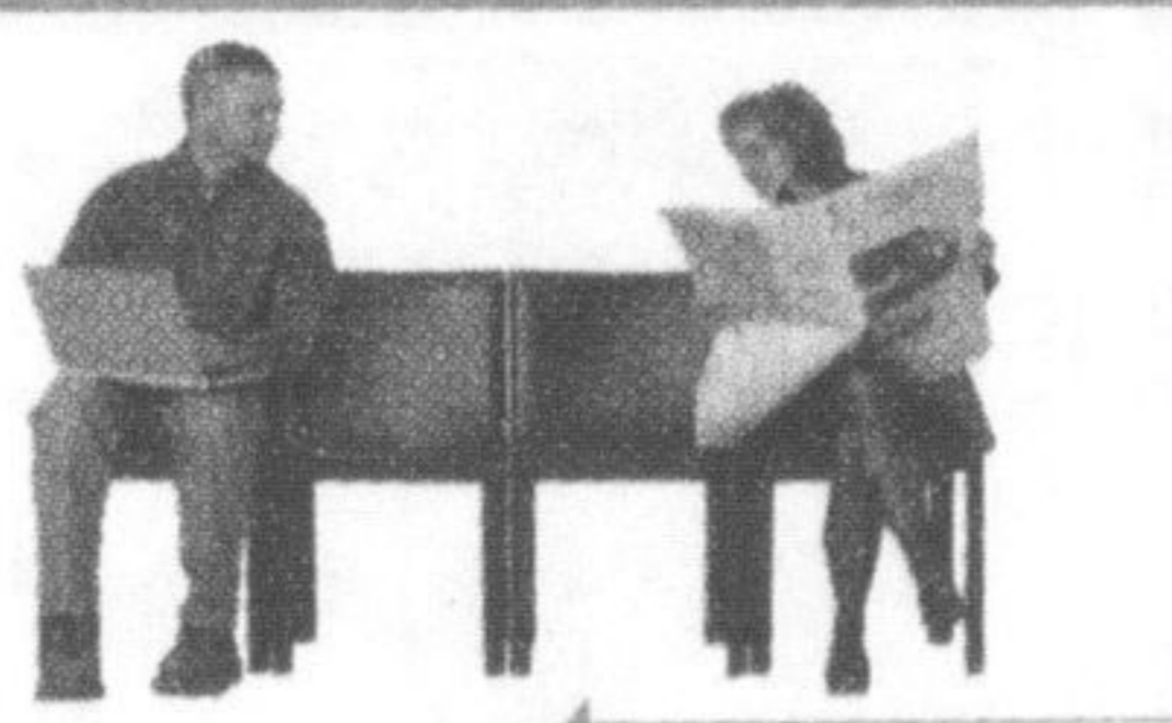
In Print and Online...