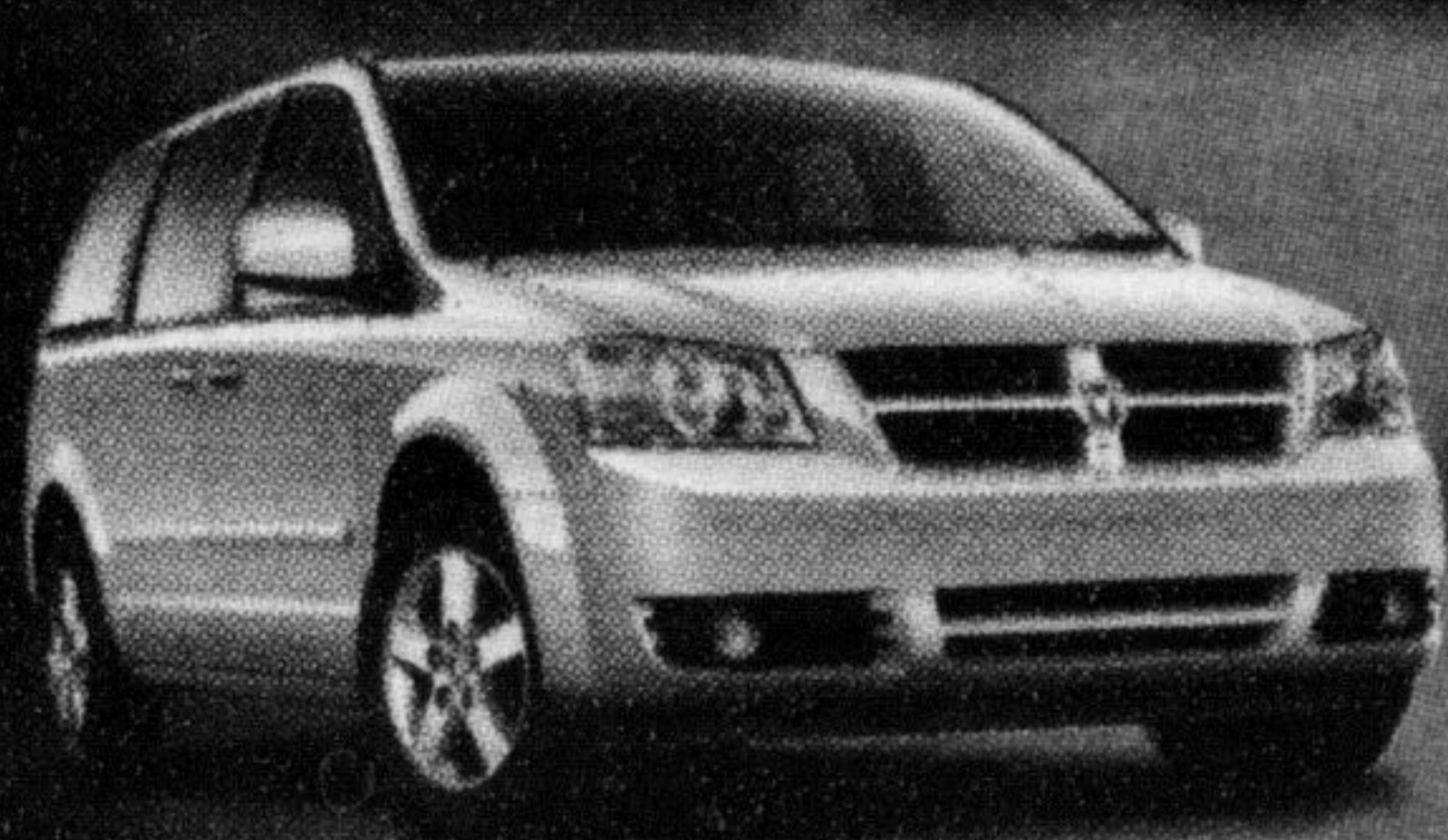
GRAND CARAVAN SE