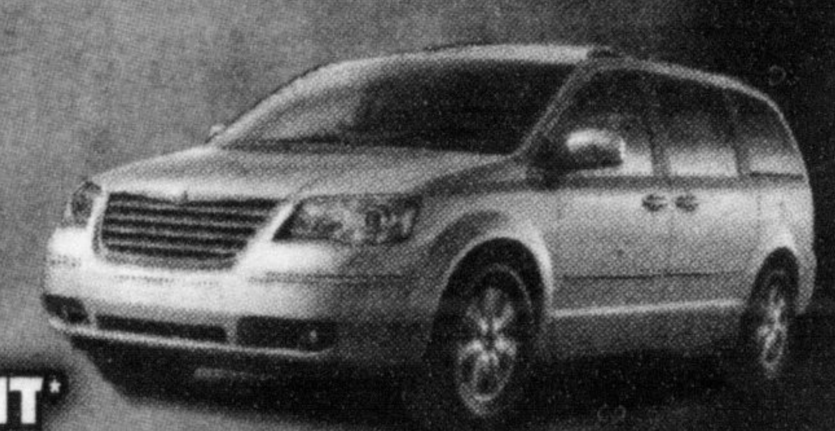
CHRYSLER TOWN & COUNTRY