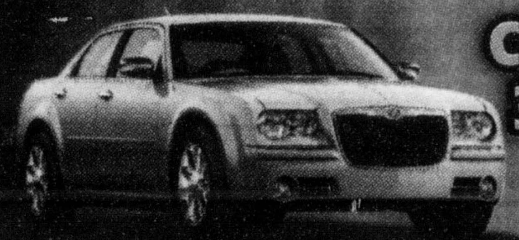
CHRYSLER 300 (6 cyl.)