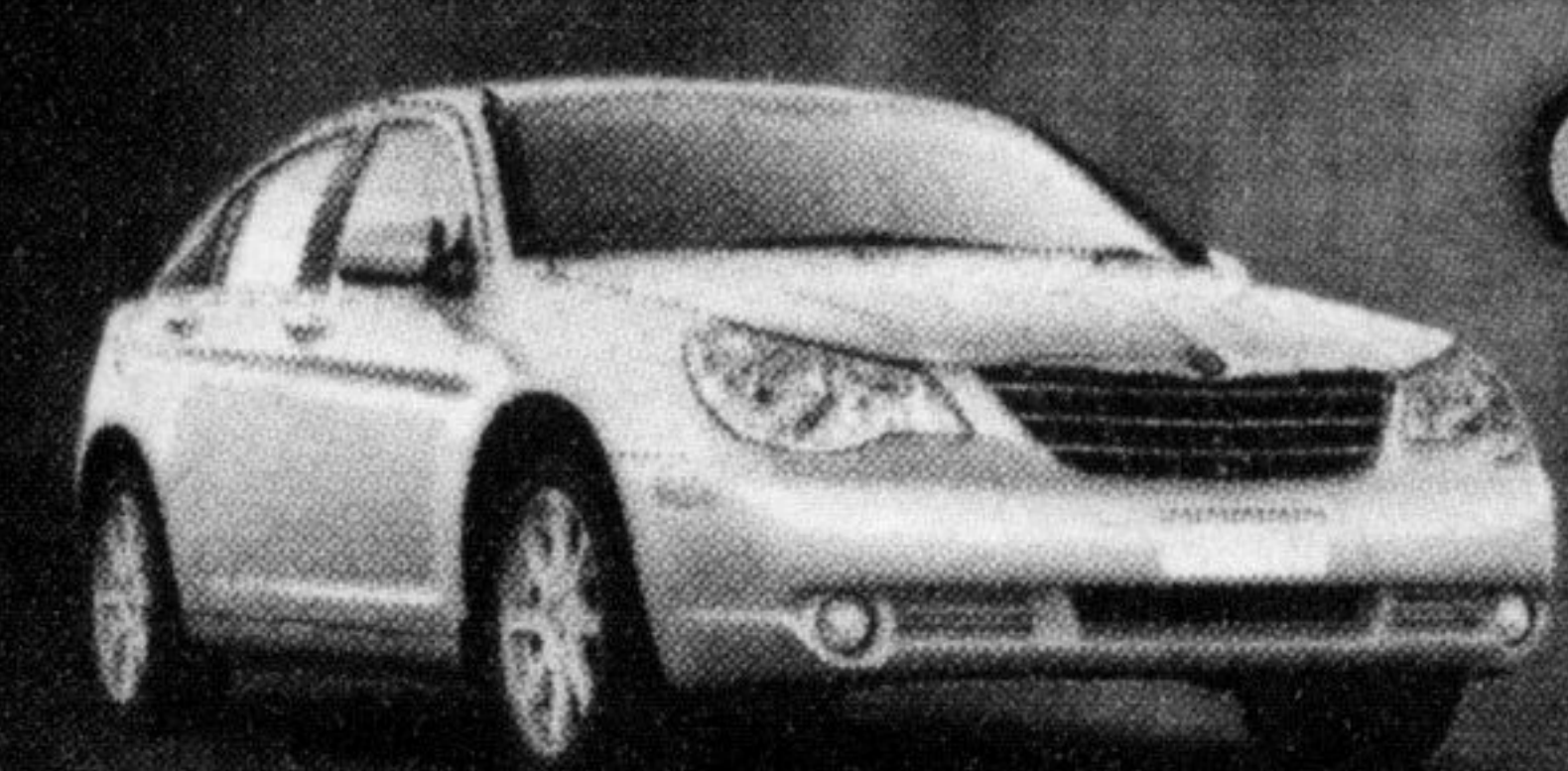
CHRYSLER SEBRING 4 DOOR