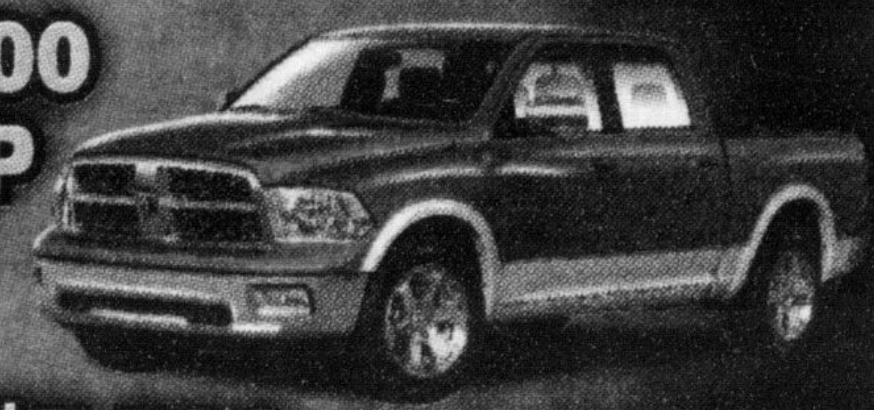
RAM 1500 PICKUP 4X4