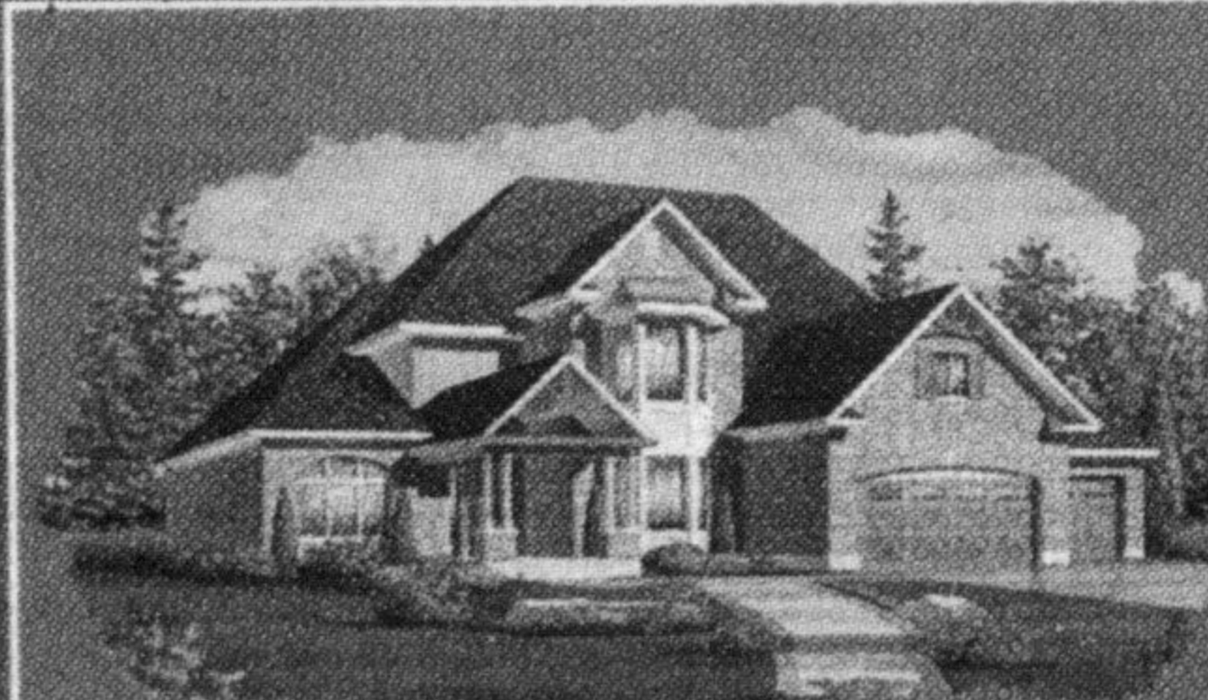
The Carriage Manor 3265 sq. ft.

will make the whole family happy. Immaculate raised bungalow expanded to 5 bedrooms and 5 washrooms with hardwood and ceramic flooring. Custom hickory cabinets, built-in appliances, 2 gas fireplaces, hot tub and so much more. The design quality and comfort will thrill you. The perfect set up! Just listed, call Mike $444,900.