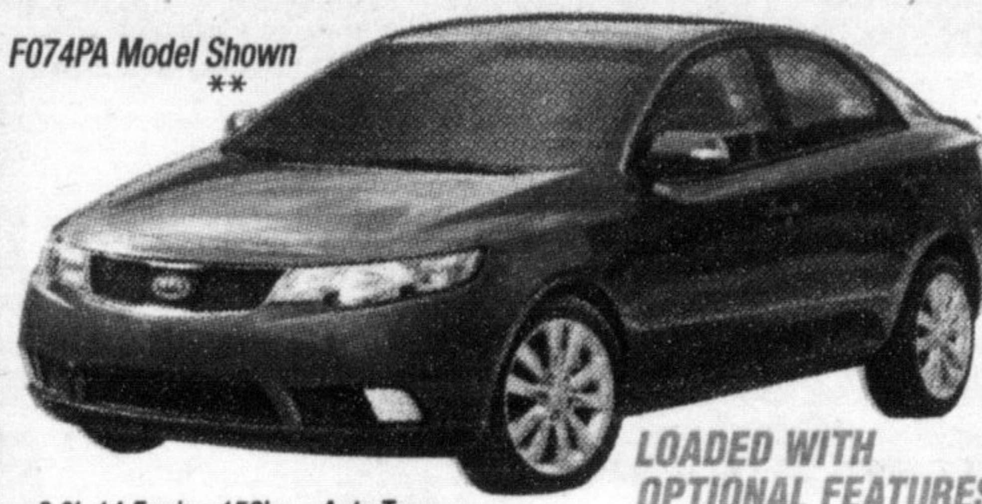
F074PA Model Shown