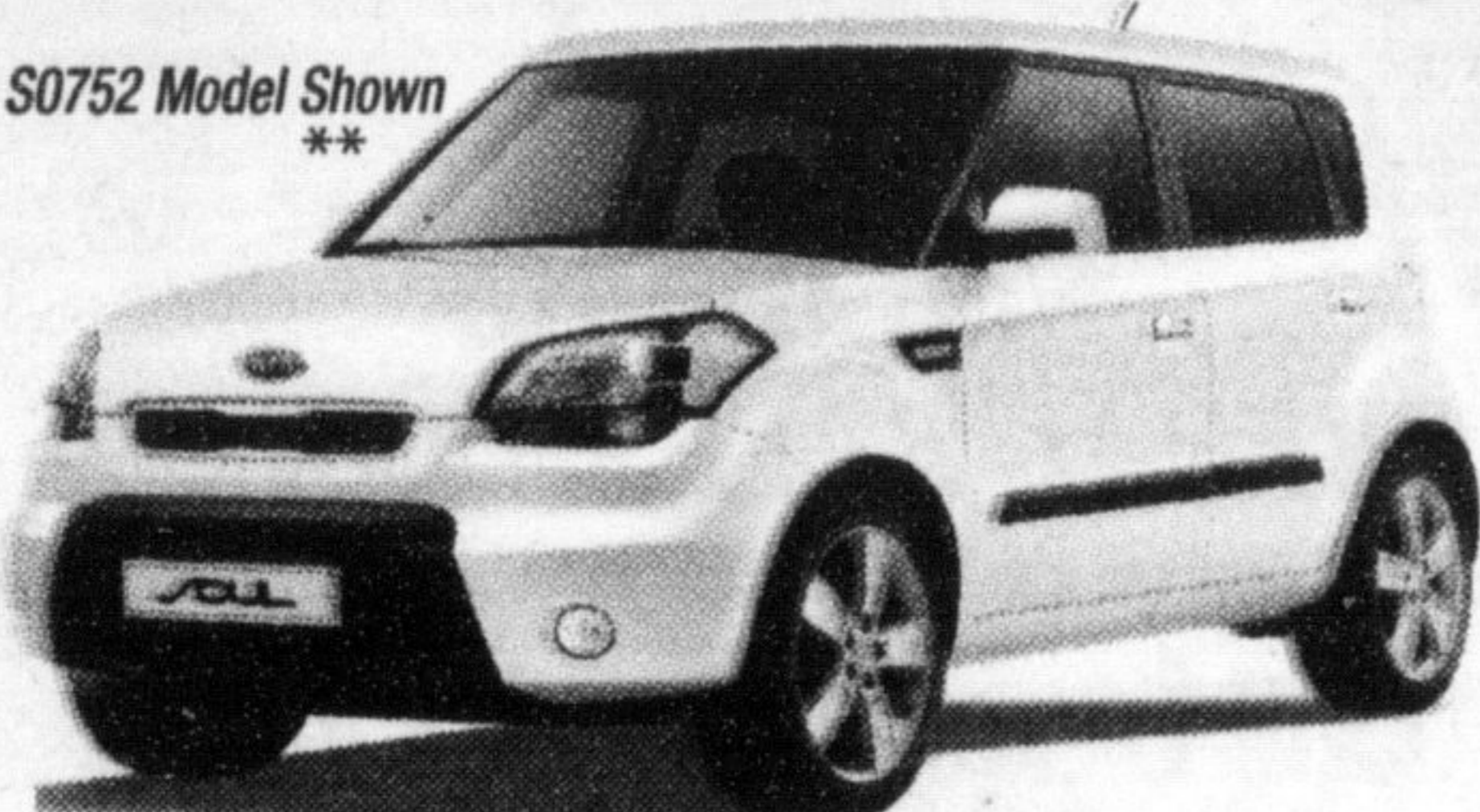
S0752 Model Shown