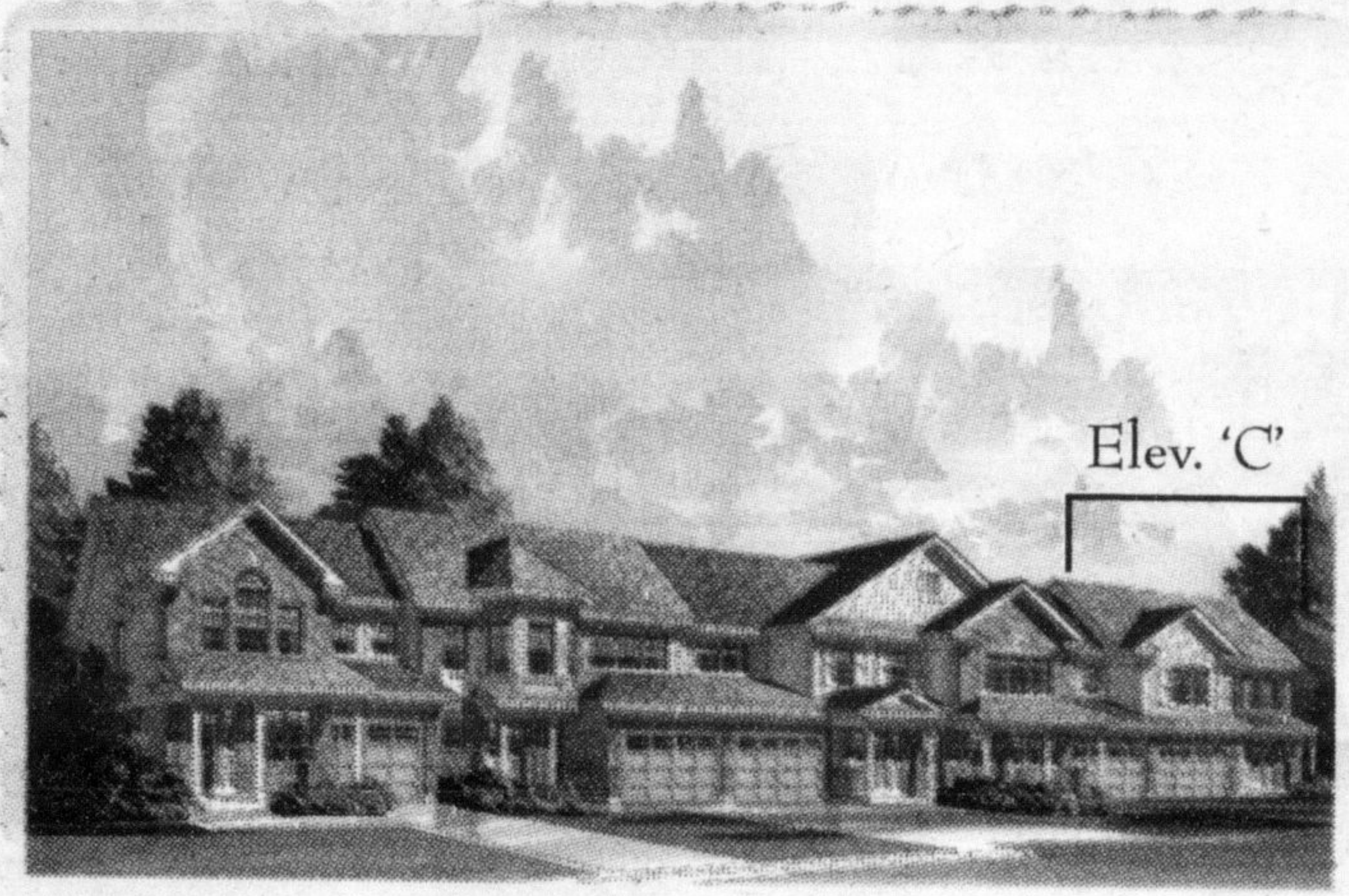
Freehold WideLot™ Townhome, The Cyrus 'C', 1,111 Sq.Ft., $199,990

New Release Of Townhomes From $199,990 & Detached Homes From $214,990