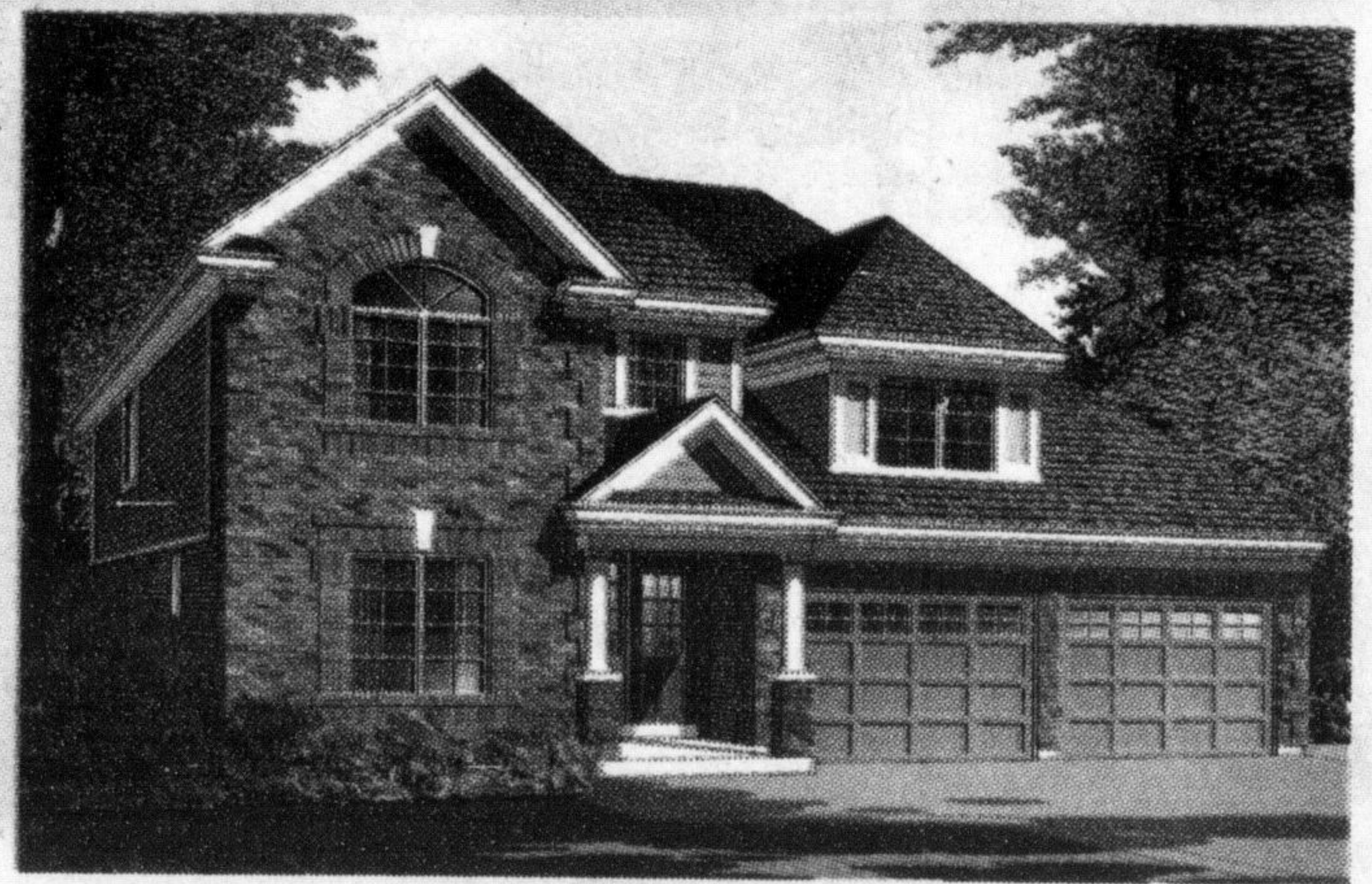
43' WideLot™, The Amberfield 'B', 1,702 Sq.Ft., $279,990