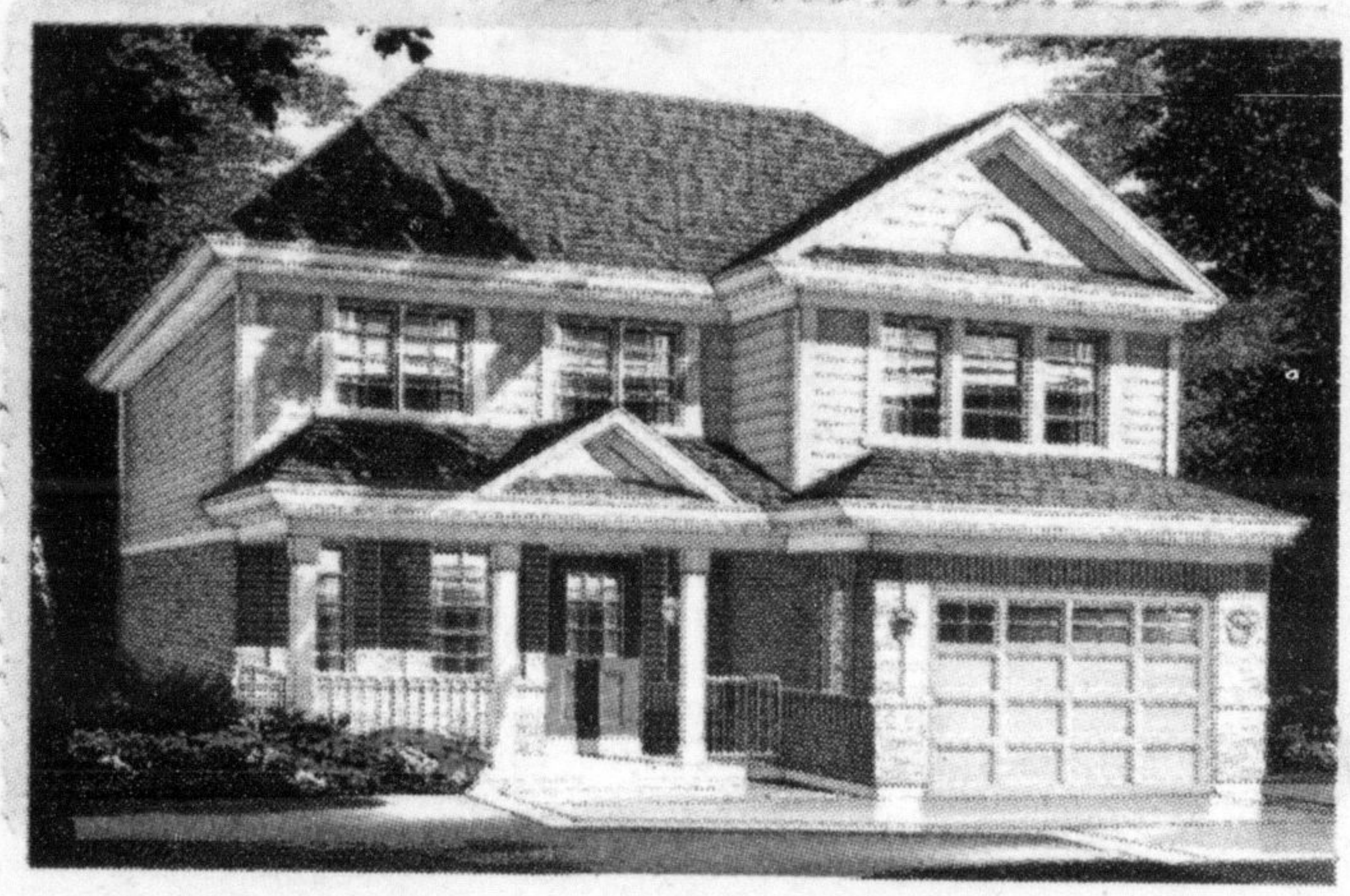
34' WideLot™, The Albany 'A', 1,264 Sq.Ft., $229,990