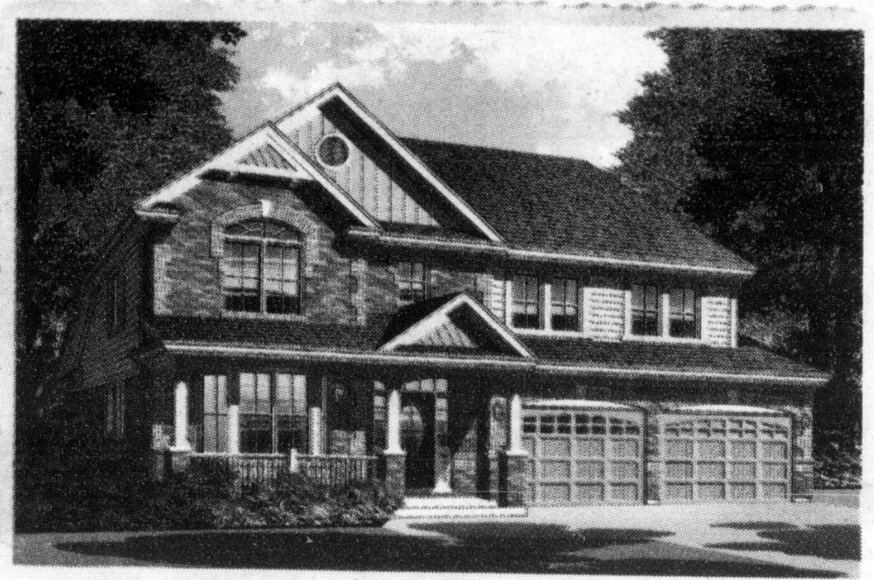
50' WideLot™, The Bellingham 'B', 2,353 Sq.Ft., $327,990