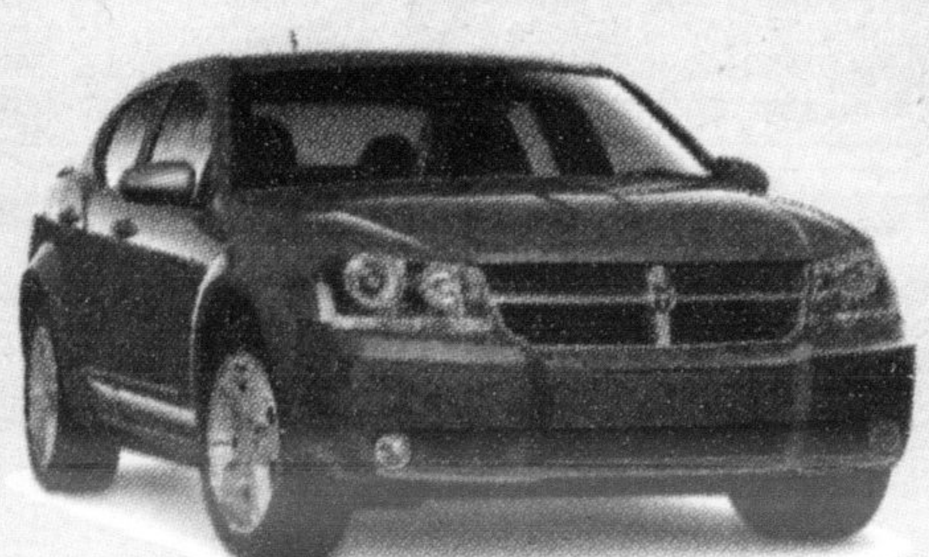
2009 Dodge Avenger

Cash Discount $5,250* 2.99% Purchase Financing APR (for 36 mths.)