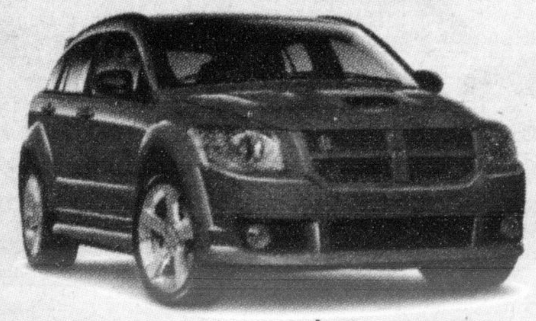
2009 Dodge Caliber SXT

Cash Discount $3,750* 2.99% Purchase Financing APR (for 36 mths.)