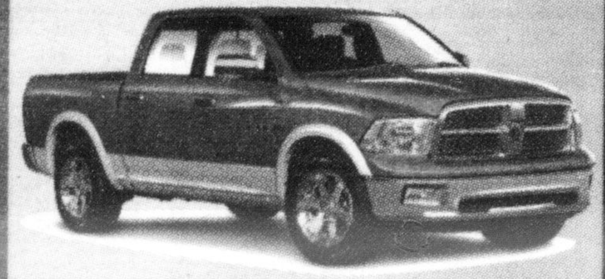
2009 Dodge Ram 1500 Crew Cab

Cash Discount $7,500* 2.99% Purchase Financing APR (for 48 mths.)