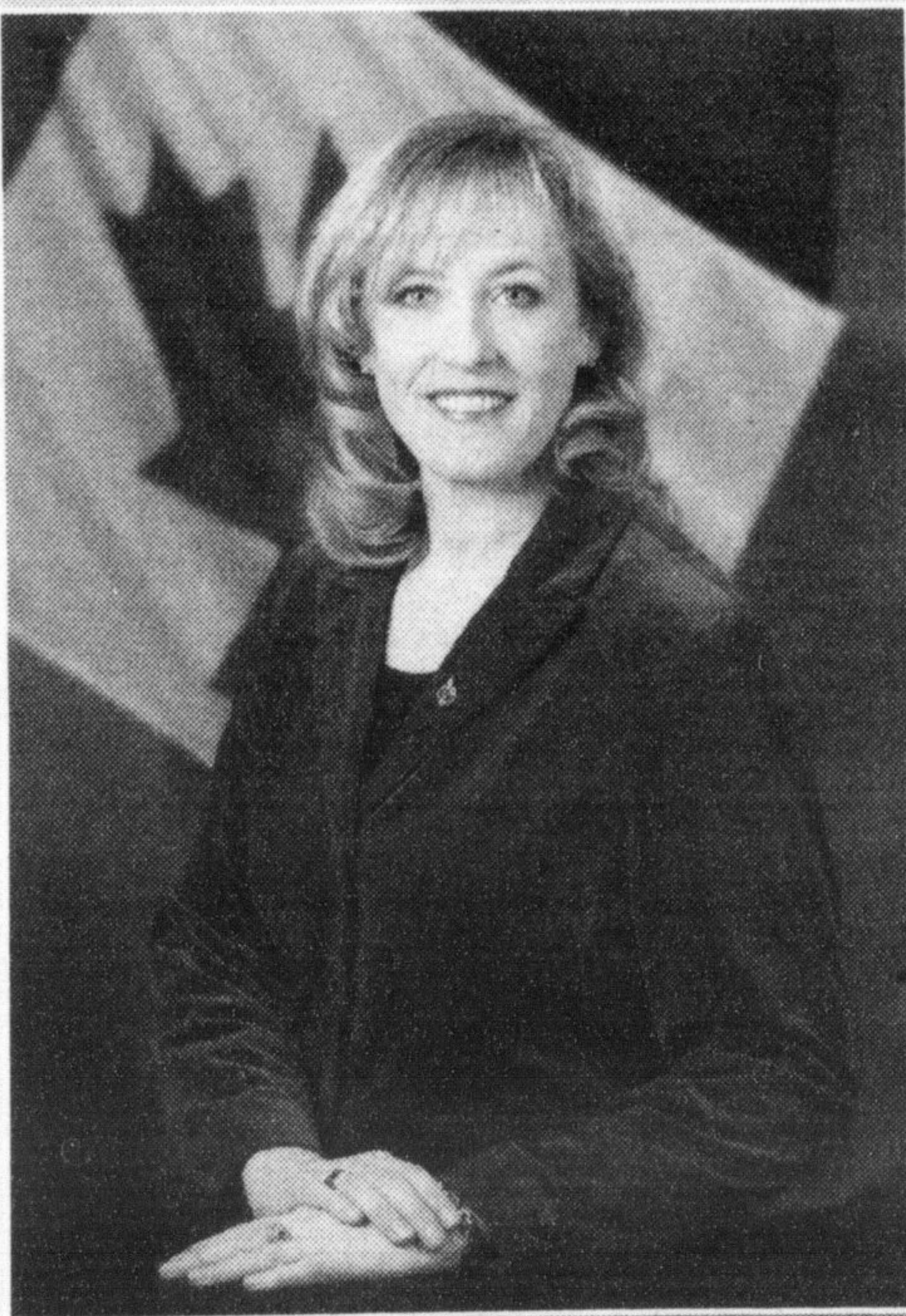
Lisa Raitt Member of Parliament Halton

Please contact my office if you need any assistance with federal services.