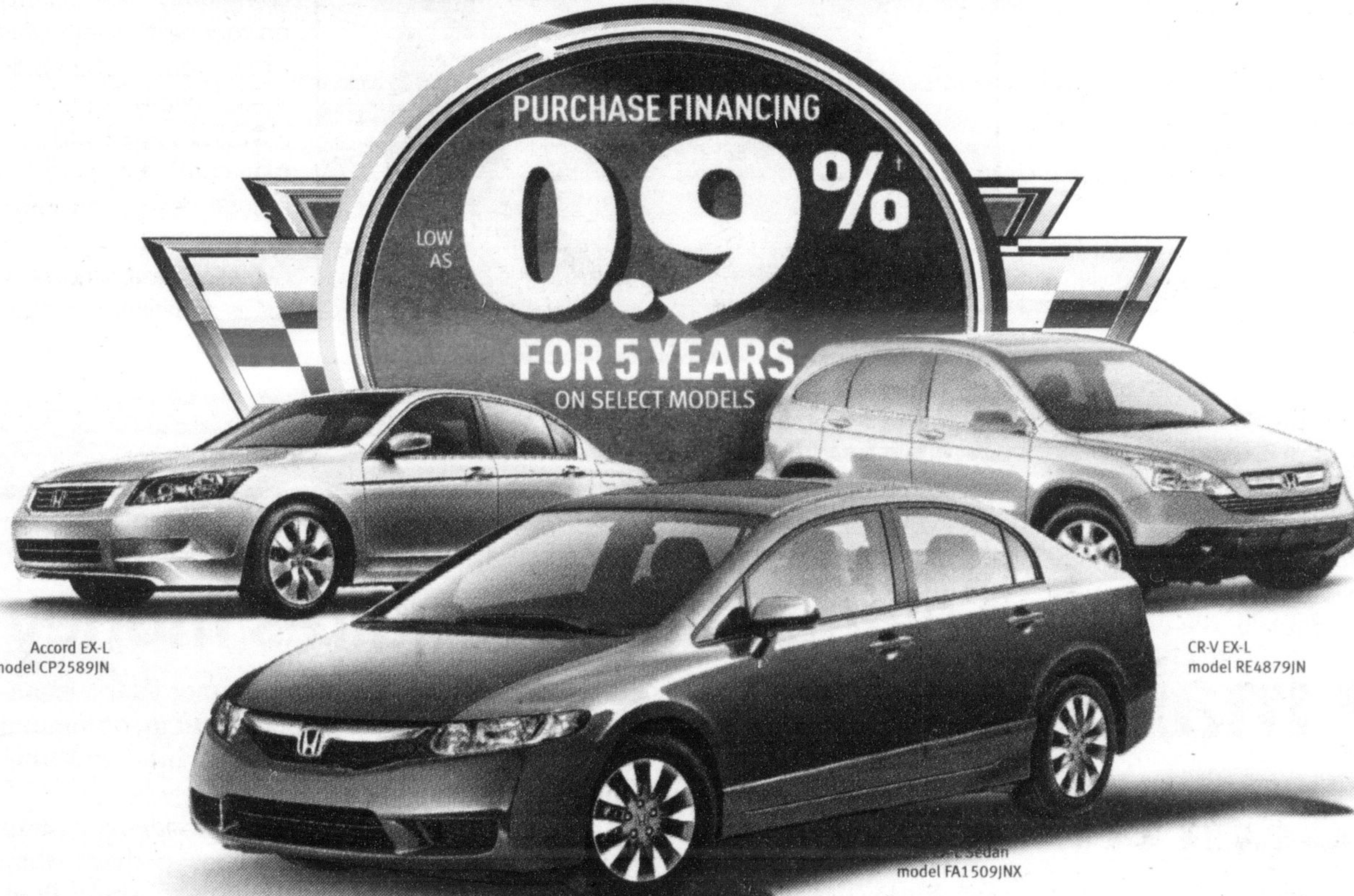
Accord EX-L model CP2589JN

INDY-INSPIRED PERFORMANCE YOUR BUDGET CAN HANDLE.