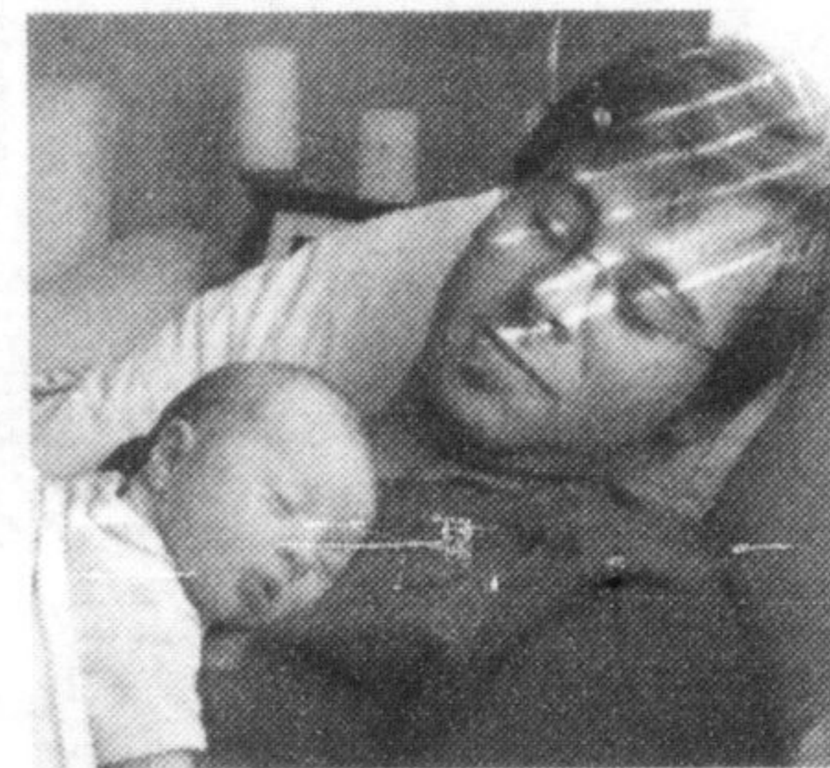
Daddy's Little Girl