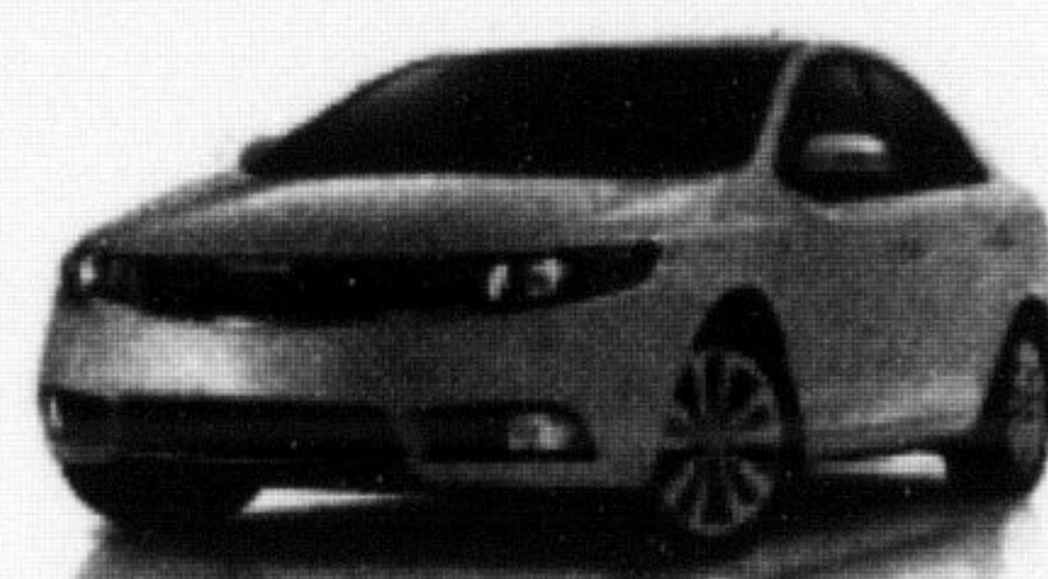
Forte SX shown

bi-weekly for 60 months. Offer includes delivery, destination and fees of $1,489. Based on a purchase price of $17,484.