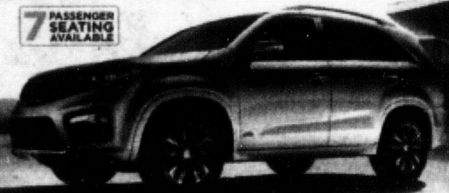
Sorento SX shown

HEATED HUBBLES HEATED FRONT SEATS AVAILABLE ALL-WHEEL DRIVE